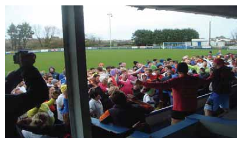
6 – Singing "You'll never Run Swim Alone!"