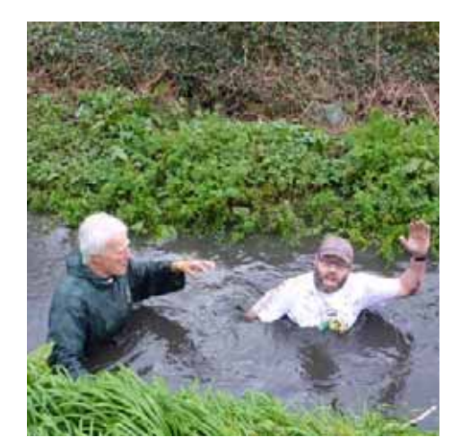
17 - No Beer Can? Drank en-Route!