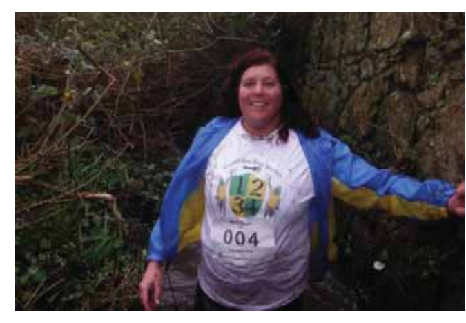
12 – Jumper loves this Ditch Life?