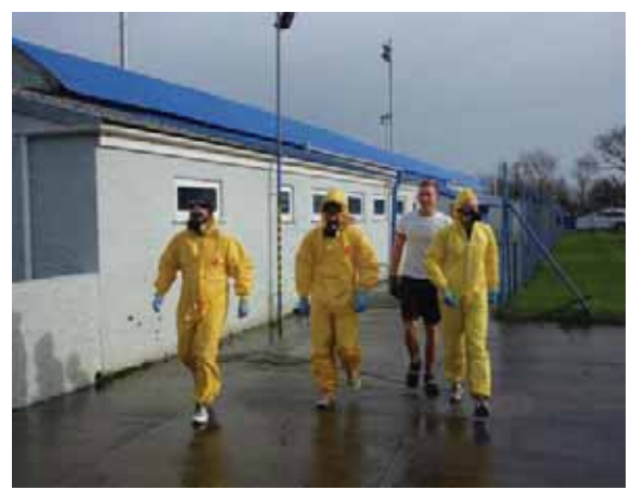
4 – Decontamination Team