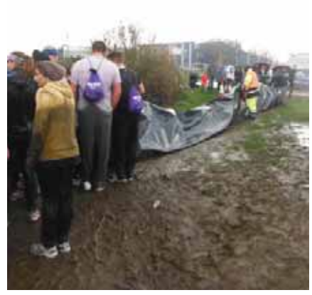
21 - Black Tunnel Crawl!