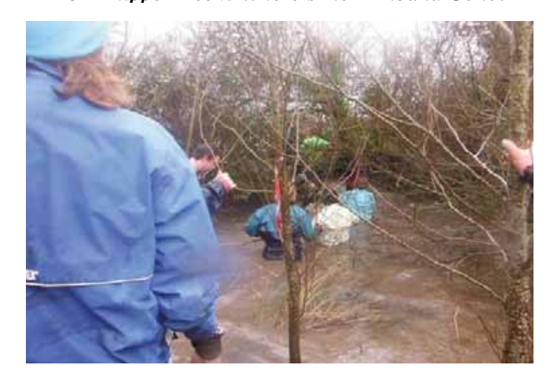
11- Gawd, into the Swamp!!