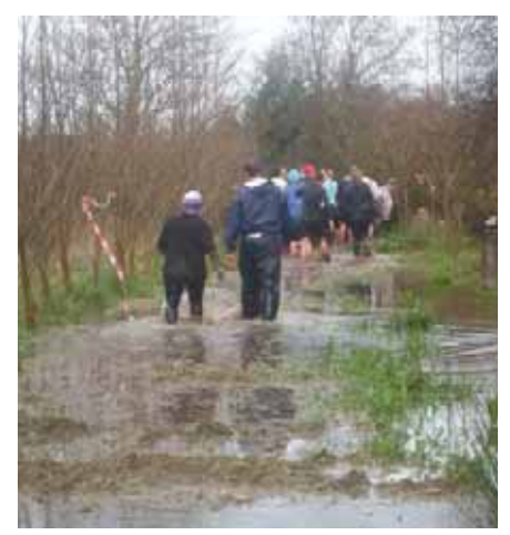
15 – Flooded Meadow