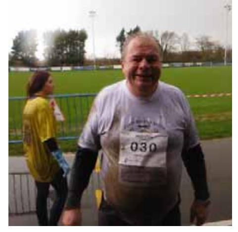
22 -Muddy Winky