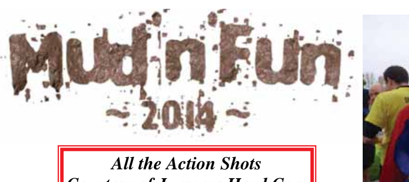
All the Action Shots Courtesy of Jumpers Head Cam Clockwise from Top Left (Concludes on Back Page)