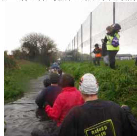
20 - The Final, final Ditch!