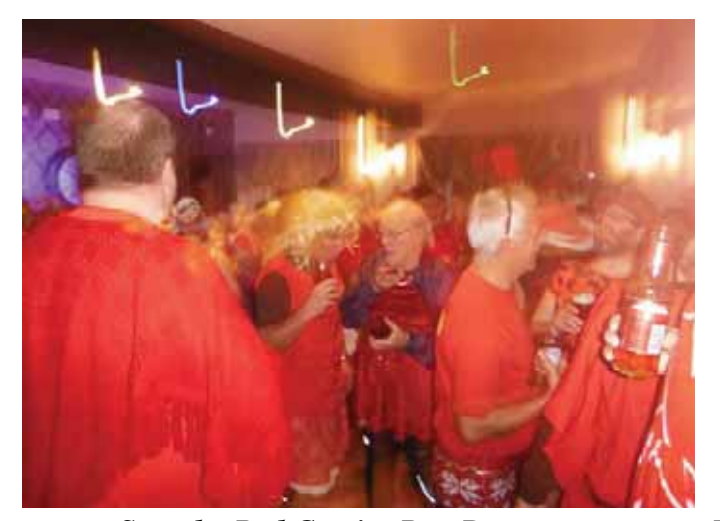
Spot the Red Carrier Bag Pants ...