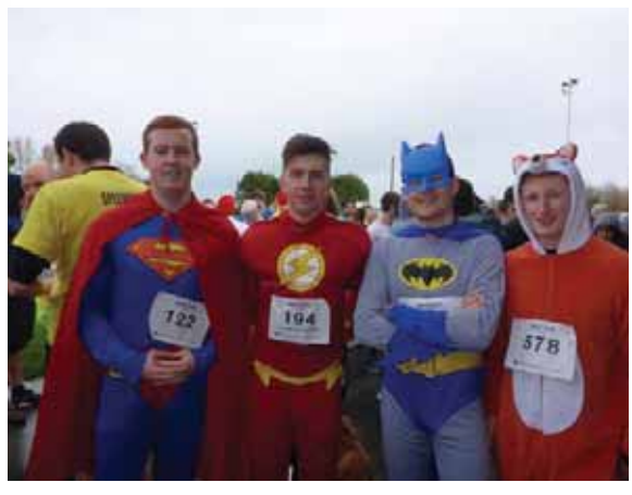
3 – Superman, Batman & their Robins