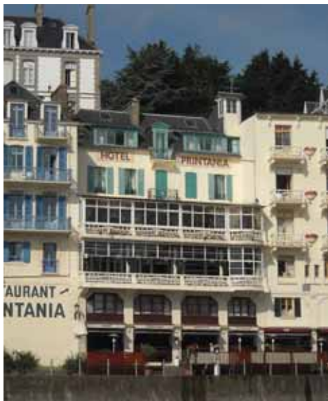
7) Bunking Down: A quick cycle around the pier then check-into Hotel Printania , a quaint seafront hotel with “refined rooms featuring traditional antique furnishings”....