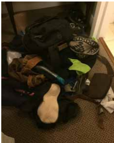
8) Exploding Kit: With Délices Françaises kicking their heels across the “Ballroom” floor Frisco quick changed, exploding his carpet-bag all over bedroom floor!