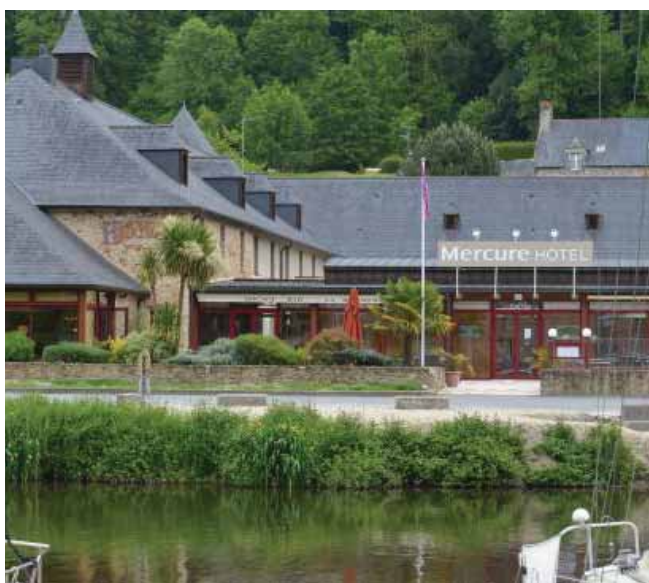
23) Vie de Luxe: After record long Beer Stop we arrived at Hotel Mercure Dinan Port Le Jerzual (sounds better than Best Western!). Wow, Hares really pulled out all stops, a Fabulous Four star hotel with heated Pool & Jacuzzi to boot, several Crapaud's enjoying!