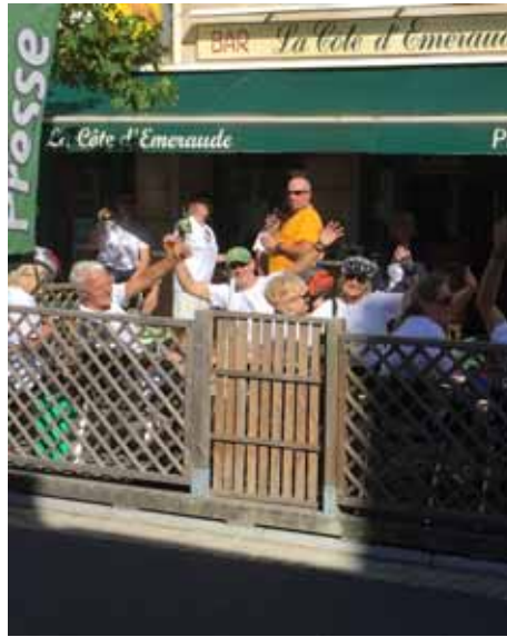
15) Jinxed Bike: Crossing Rance Barrage Fuzzz madly pedalled but moved very slowly. At Beer Stop Bar La Côte d'Emeraude in Saint Jouan-des-Guerets. Piston Broke