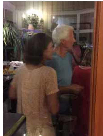
9) French Tart: Following scents downstairs Frisco got stuck into dancing with Filles Françaises , like a nag on heat. Close escape from nearby boyfriends. Mon Dieu!