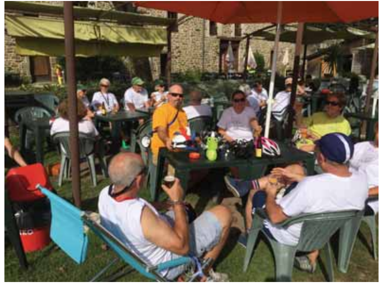
20) Beer Stops: After Molehills had conjured up Car Boot Beer for a refresher stop opposite Rance Lock the Pack arrived at Les Rossignols Beer Garden just before Dinan, where we chilled out in the sun after the days exertions (good excuse for More Beer ), necessitating in..