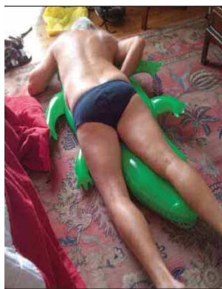
13) Bombed Out: After his night-time advances to several Délices Françaises were rejected Frisco unpacked his Blow-Up Croc , fell on top and passed out stone cold.