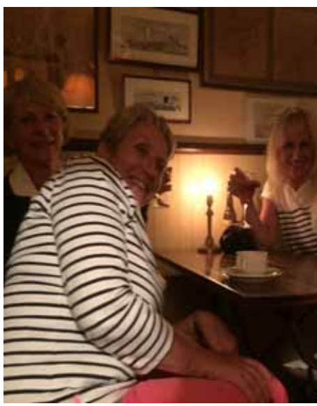
12) Vivre Dangereux: Others really pushed the Boat Out limiting themselves to Cafe au Lait such as Fuzzz, Wendolene & ET . Go on ladies, be careful!