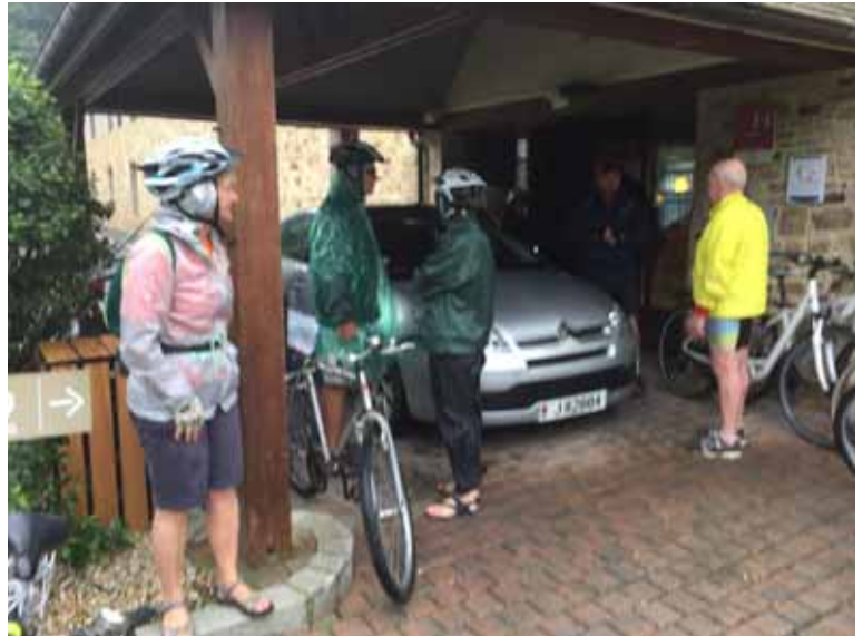
25) Slow Start: After last night's excess & misbehaviour we slowly enjoyed the sumptuous breakfast at Le Mercure. Little did Hooker, Nil-by-Mouth or any of us know we were facing the Most Testing Bike Ride in history of Bike Bashes! Ooh.