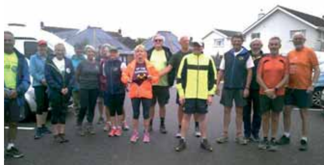
The massive pack