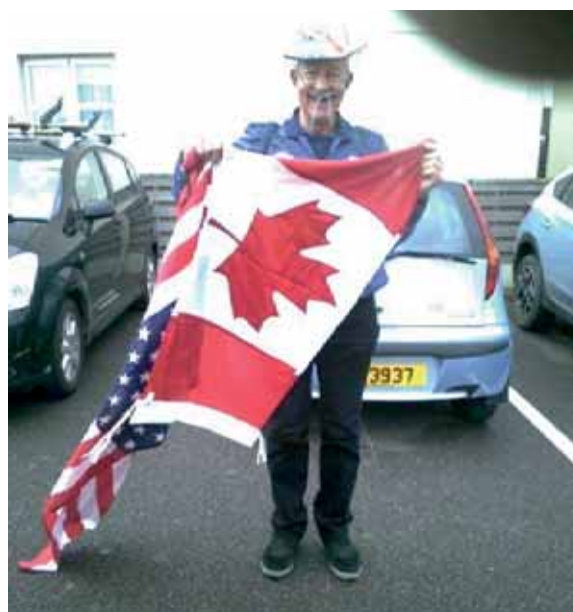
North American Hero

The GM informs the pack that Software had been contact traced (otherwise he would be preparing this report) & that Tinky Winky was joining His Excellency the Lieutenant Governor for champagne & nibbles all at the expense of poor taxpayers like us. 28 Degrees informs us that it is a reasonably long run with the trail marked in chalk Soon after we set out the drizzle starts & for a while gets steadily heavier. Thank goodness it is supposed to be summer & it is therefore not too cold.