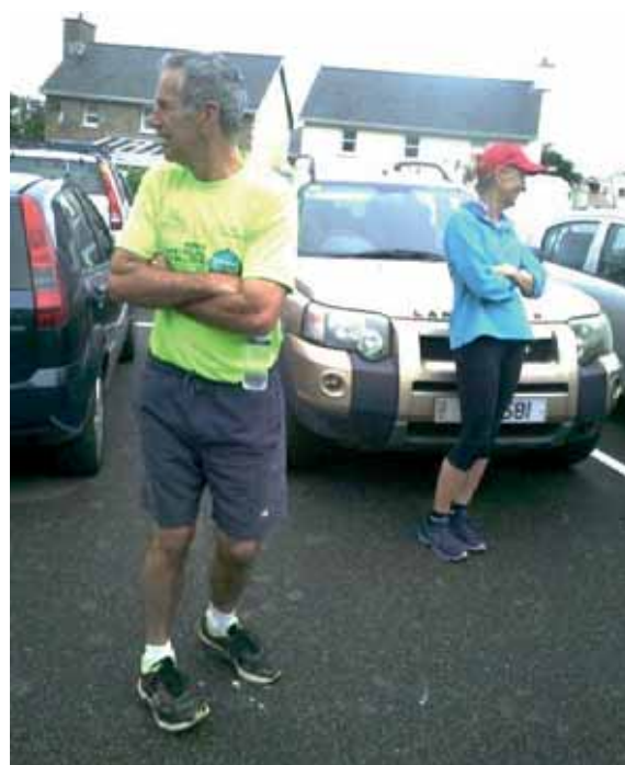
We don't talk anymore

Where have all the Hashers gone? Are they suffering severe hangovers from celebrating England's stunning 4-0 win over Ukraine or have the heavy clouds with the promise of rain discouraged the faint hearted? Whatever, the numbers gradually increase & we are particularly pleased to welcome Captain Poocock back to the fold after his visit to England to see his grandson. Not only is he the only one to respond to the suggestion that as it was American Independence Day some USA token could be displayed but he also celebrated Canada Day that had been 1 st July. He was also sporting England FA gear to boot.