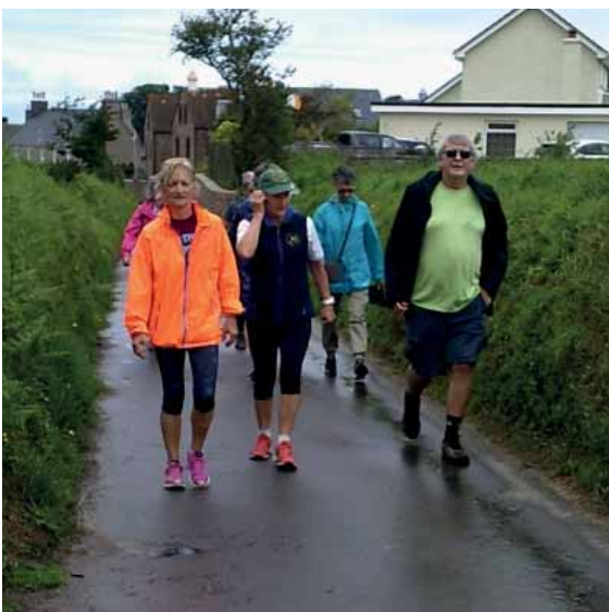
Runners & walkers united