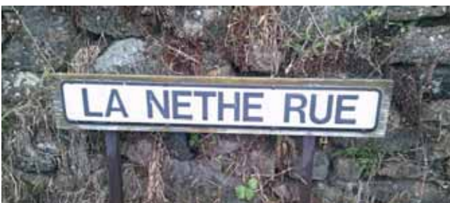
The Black Road