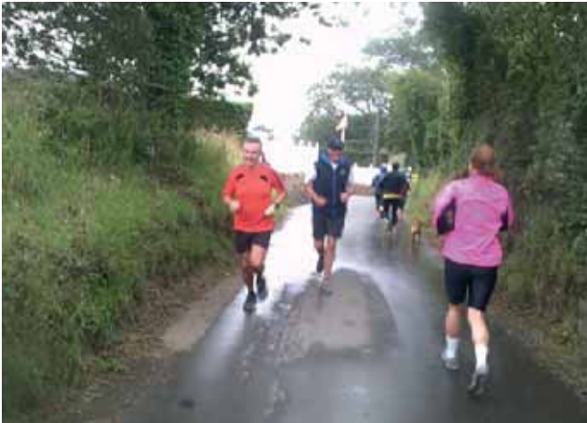
Double arrow victims