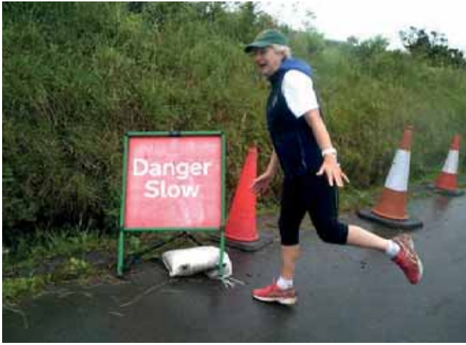
Not too much of a problem