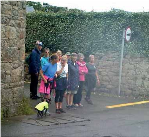
Look left, look right