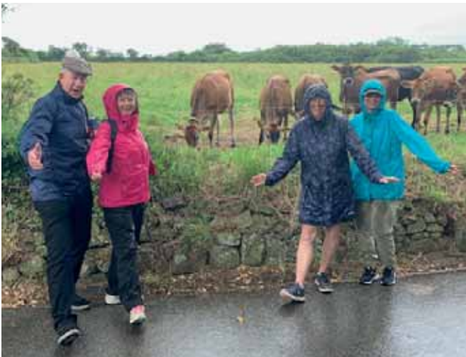
Walkers singing & dancing in the rain