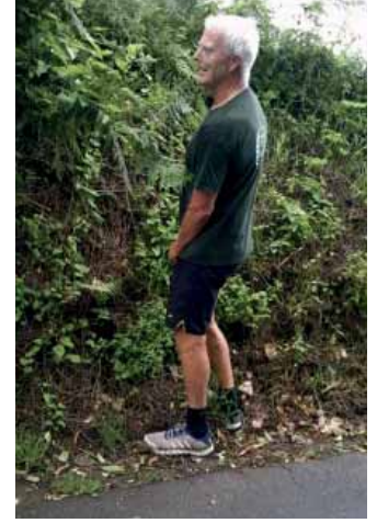
Relaxing & relieving