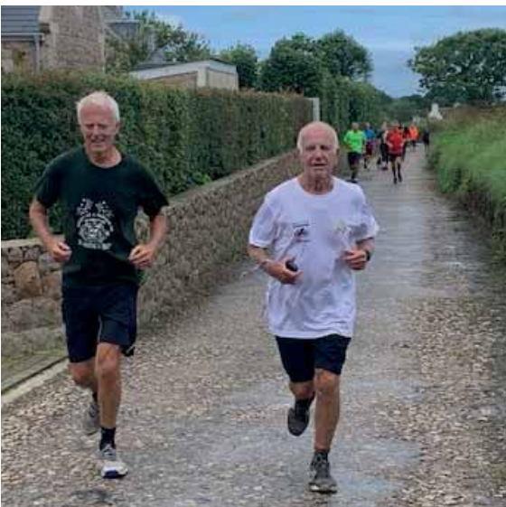
Livened up- the pub is near