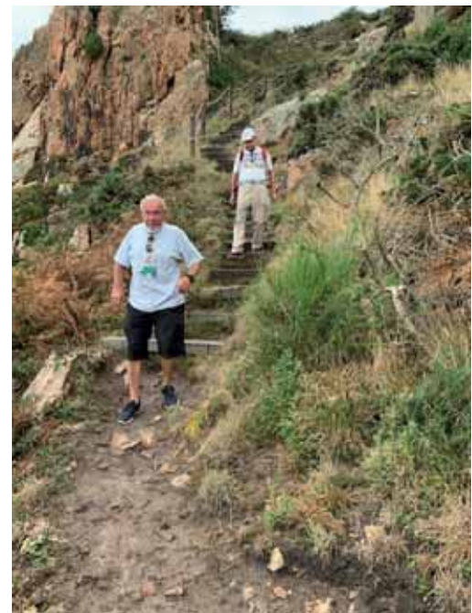
Those dreaded steps!

The walkers had set off in a different direction to the runners heading towards the railway track then onto the cliff path to Beauport, including enjoying those dreaded 100 steps. It could not have been too bad as all made it back to the Bowls Club safe & well in good time for the welcome refreshments.