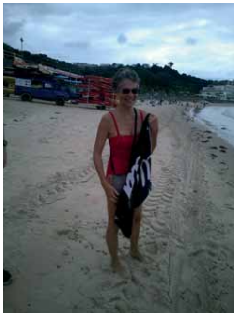
The sea was warm