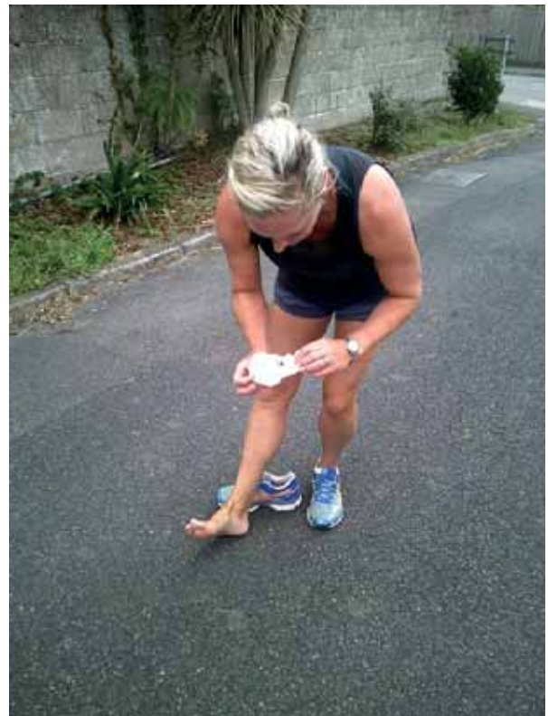
Just back & already in trouble

Our lone running hare explained that there were no hazards to be aware of & he hoped that it was a well laid trail, so it was just "on on". The trail was to lead us towards La Moye School and Les Quennevais Sports track with a sneaky loop towards St Brelade's football club.