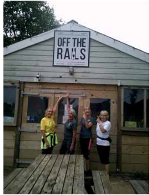
That explains it all