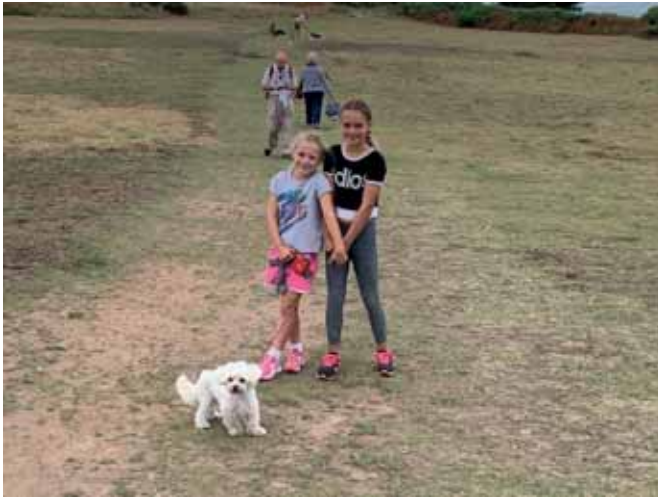
One dog in charge