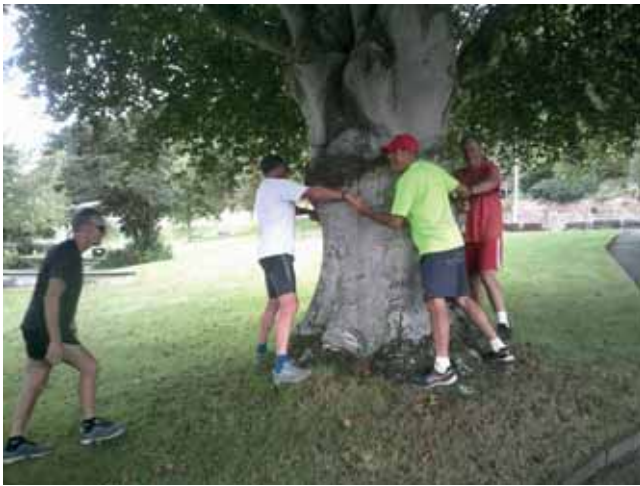
The tree survived - just