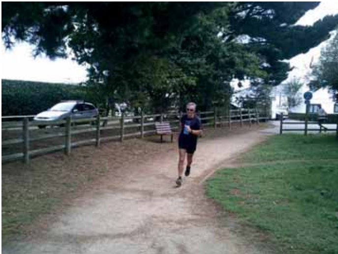
I'm coming back