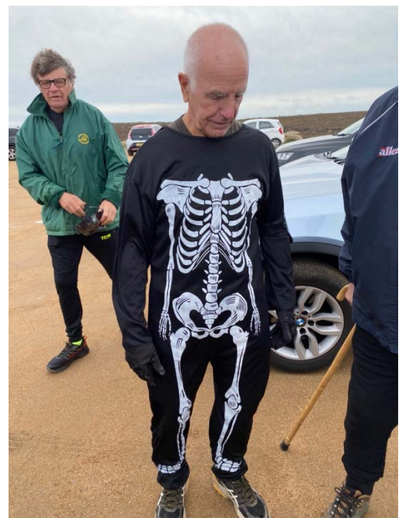
I've Run down to my Skeleton!