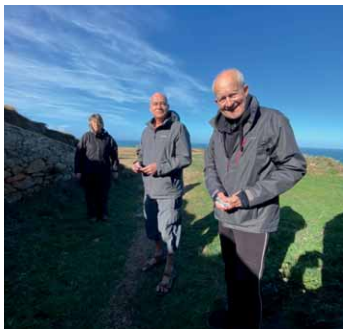
After the Marathon!