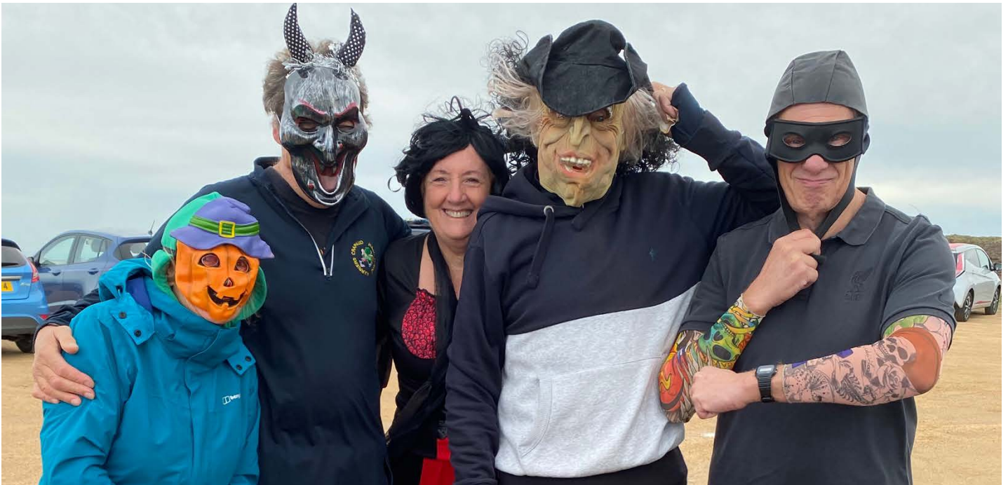
Pumpkin, Ghoul, Femme Fatale, Goblin, Masked Tattoe'd Executioner - this Run had it all!