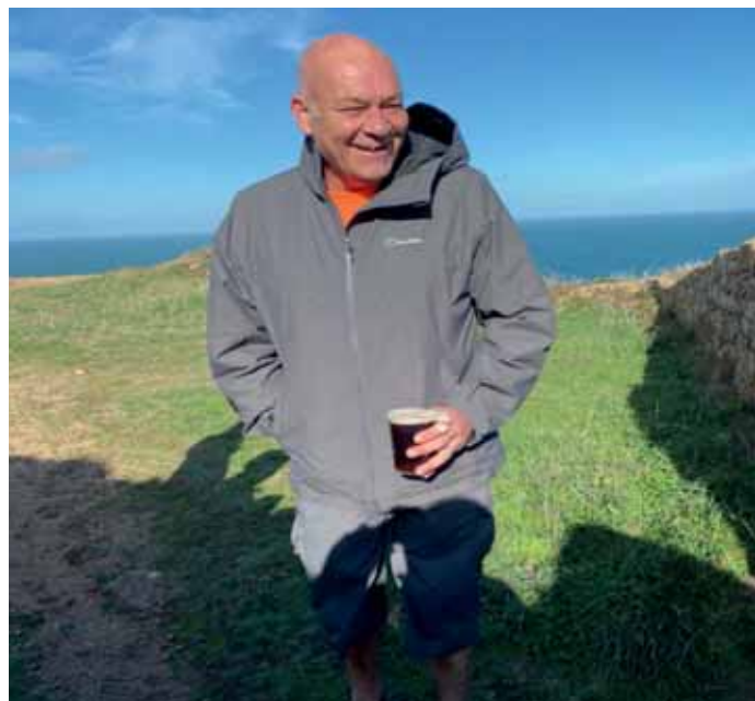
Trail? What Trail? Jokes on you all!