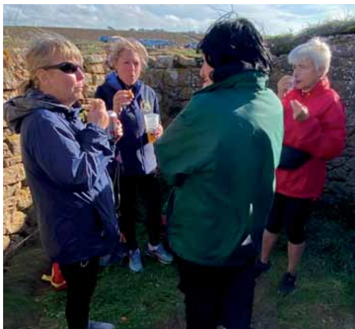
Witches Coven Conferring?