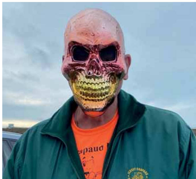
The Mastermind Ghoul... err, Hare!