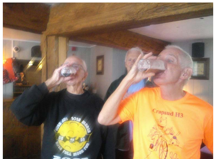
Punishment well disposed of