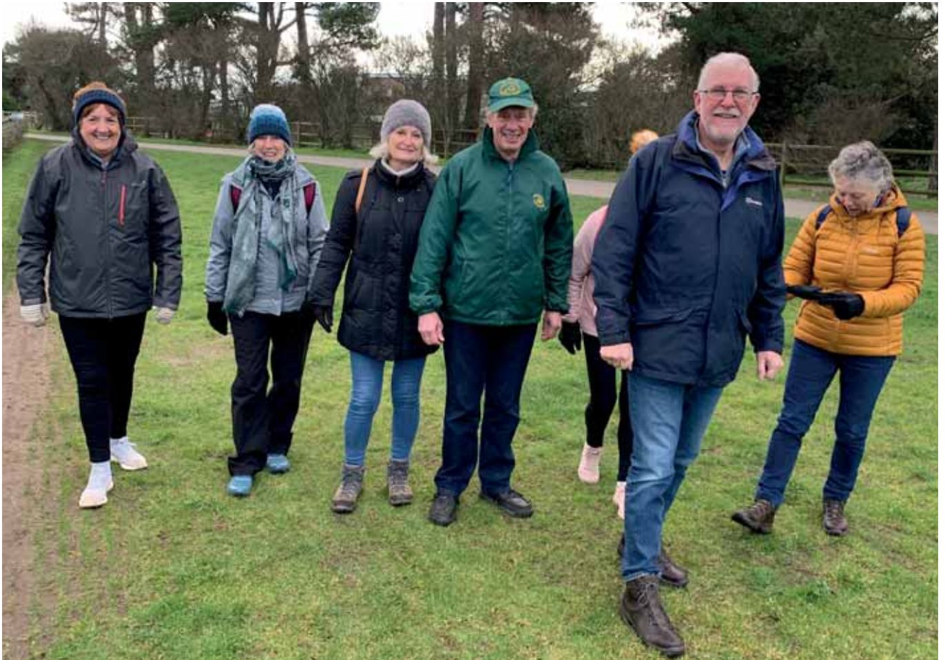
The walkers pause