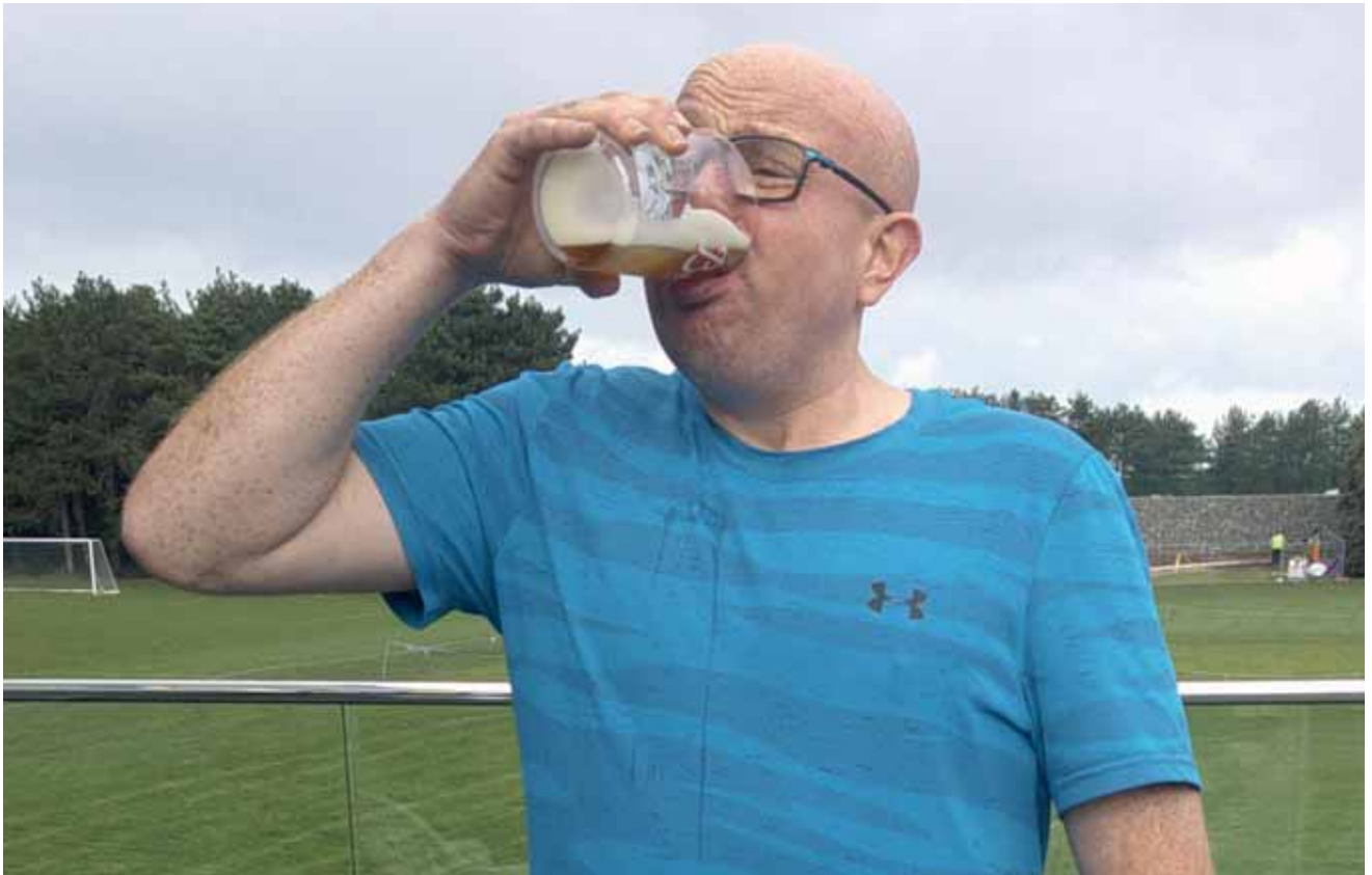
Down in one