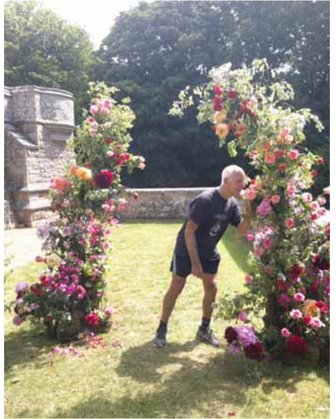
Smelling of Roses