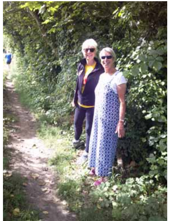
The walking "pack"