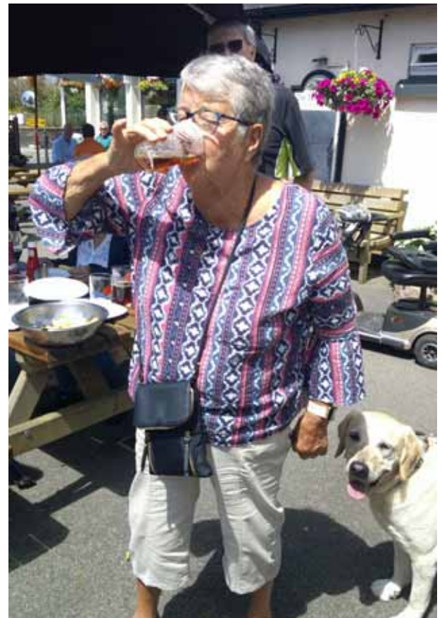
Birthday reward & admiring canine