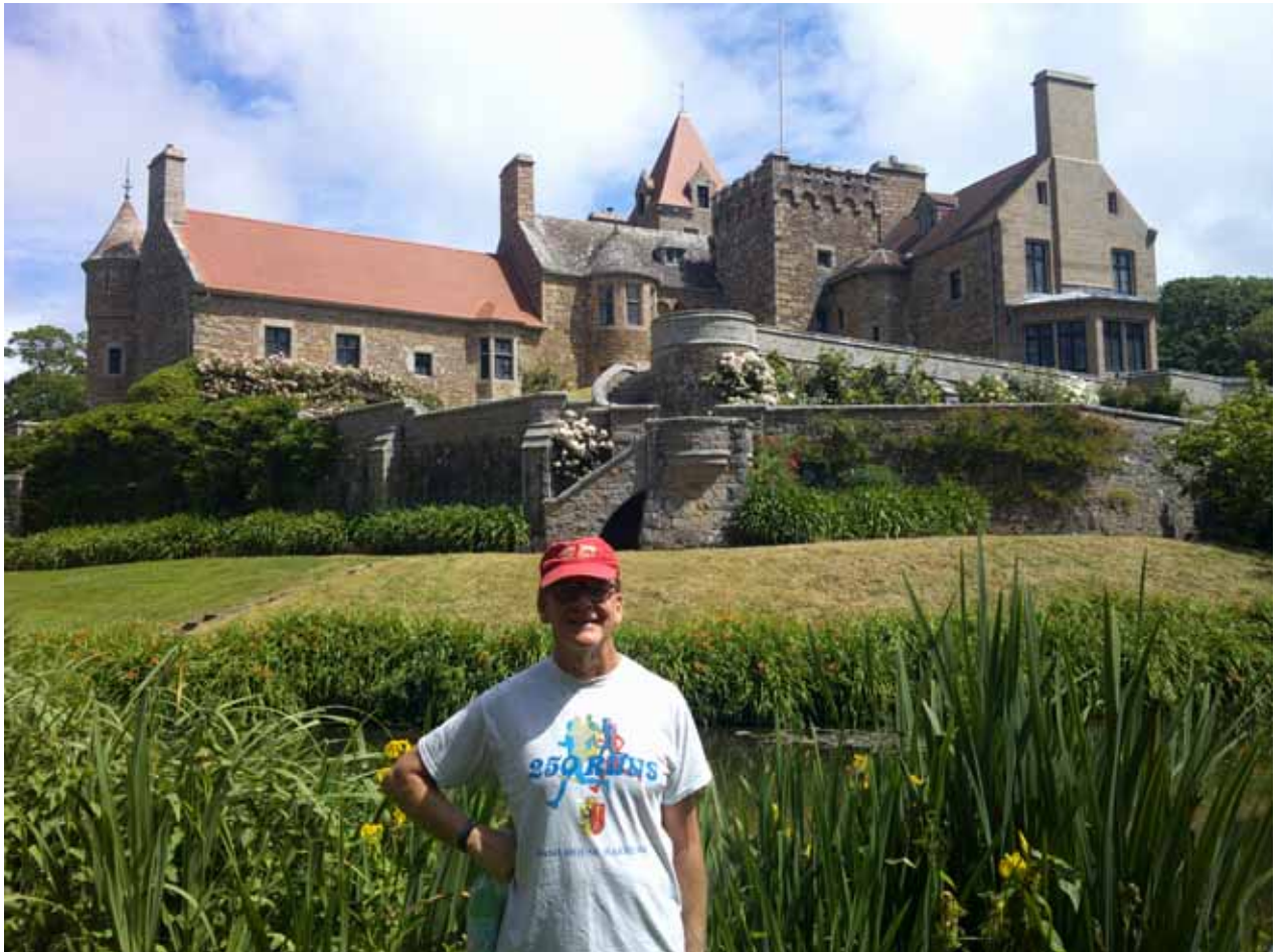
Welcome to my humble pad