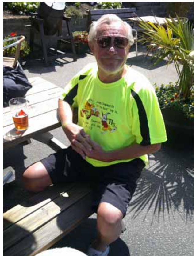
Ragsby enjoying the ale