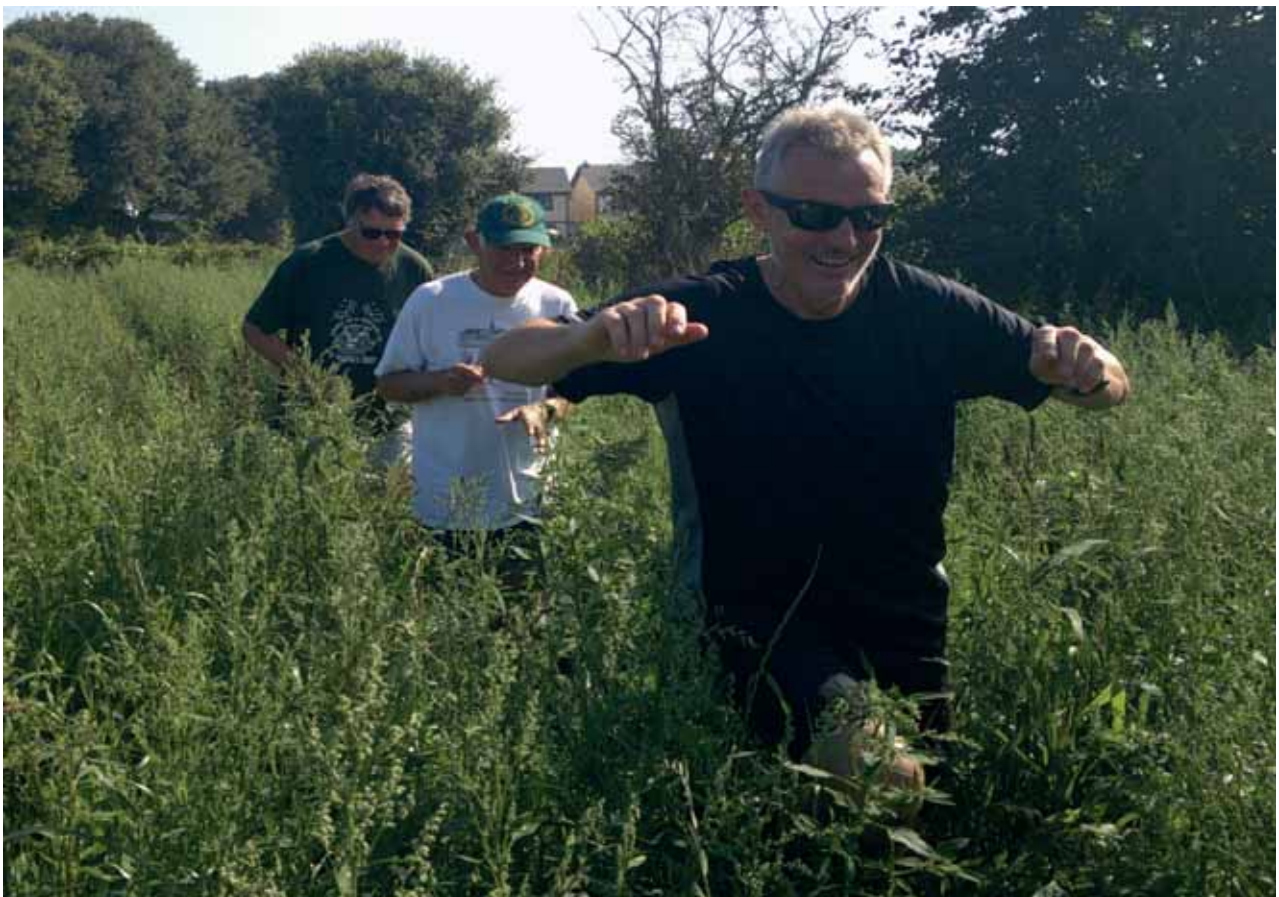
Becoming Submerged in the Nettle Field!