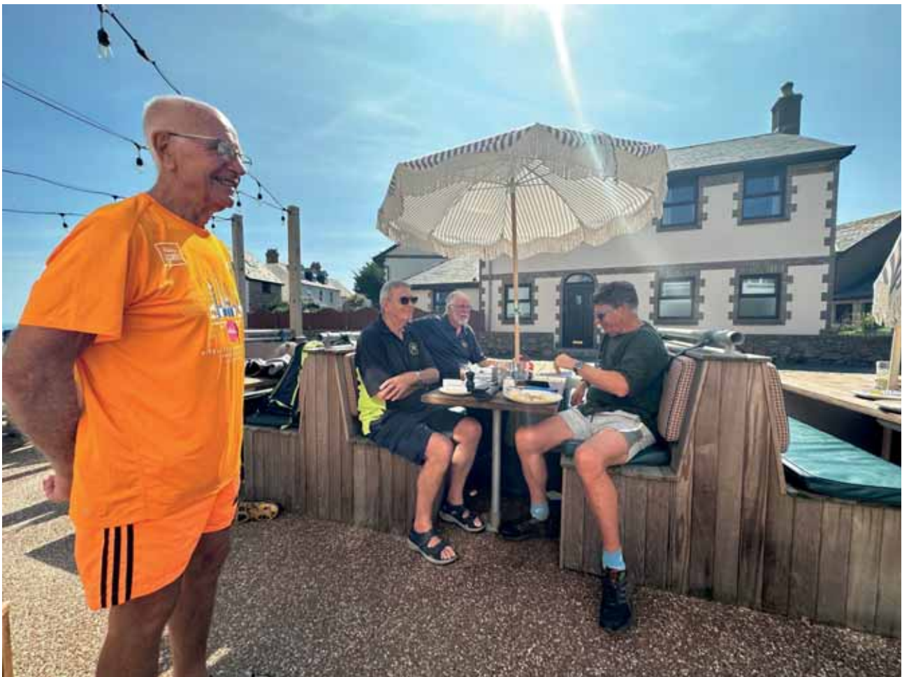
Finally Steptoe held-forth with more impossible questions!