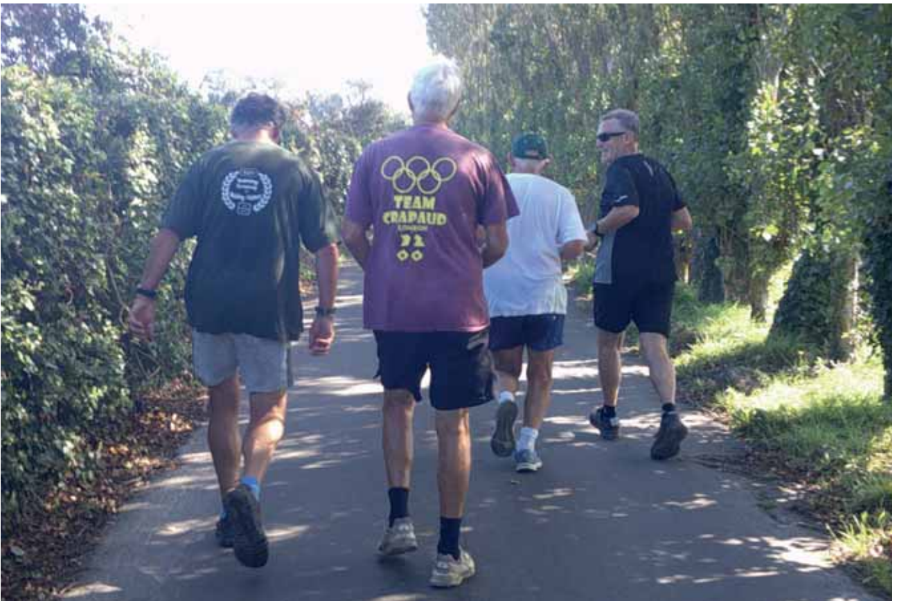
What a Collection of Wobbly Bums!