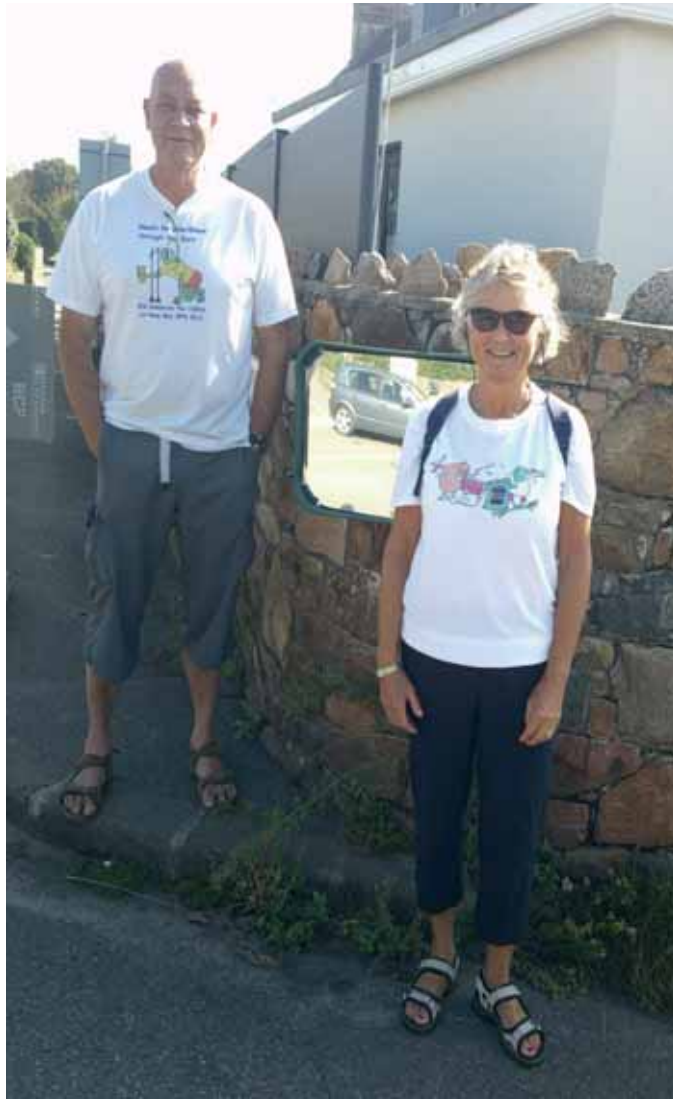
Little & Large?