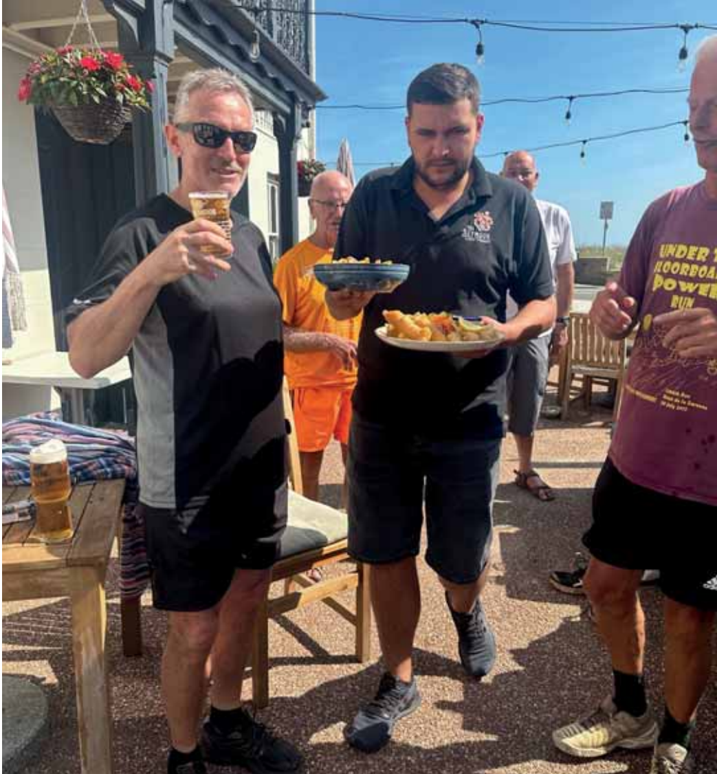
Ballcock took a break while Nosh was served