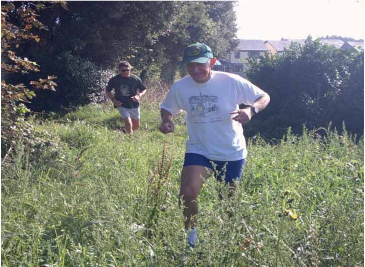
Diving into the Nettle Field!