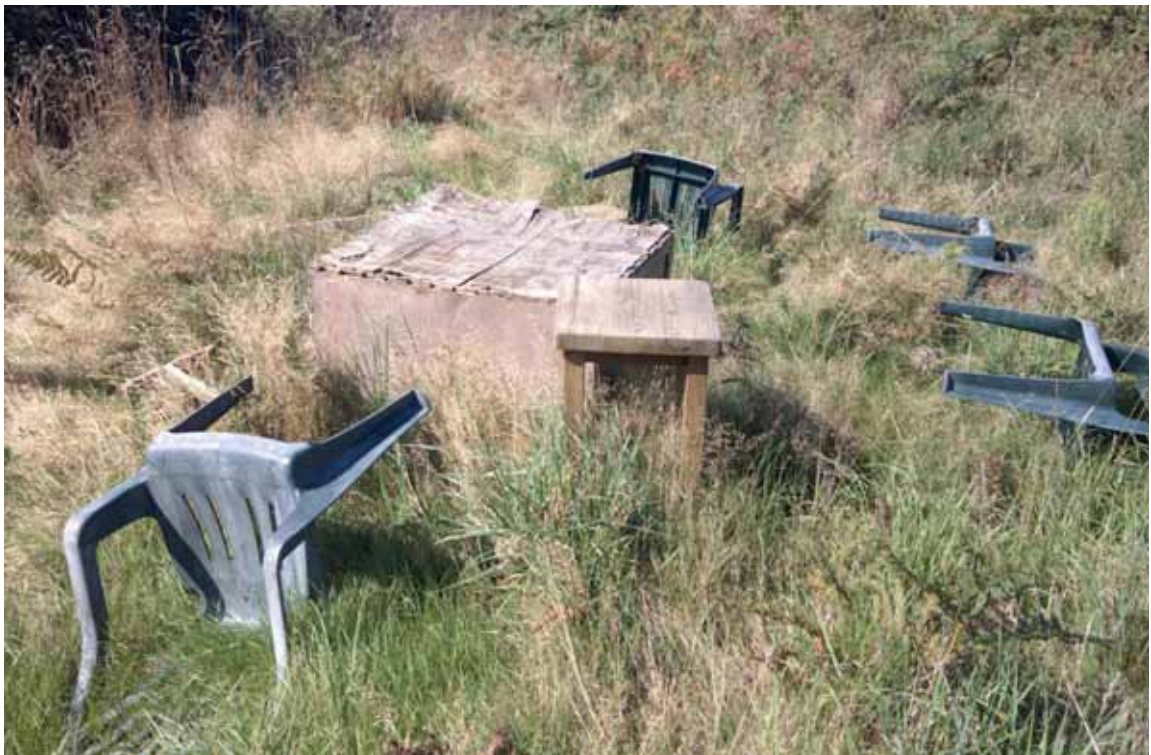
Pack thought On-Down's were gonna be Alfresco again!