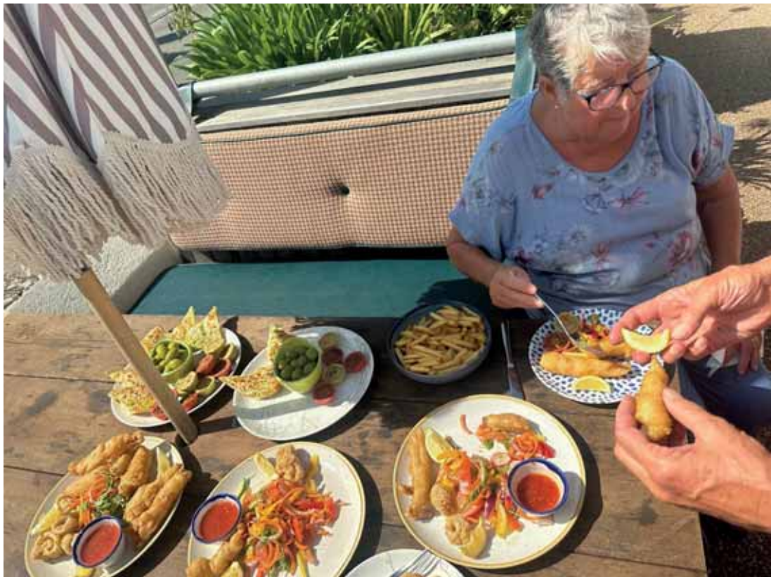
Walkies wasted no time getting "stuffed"!