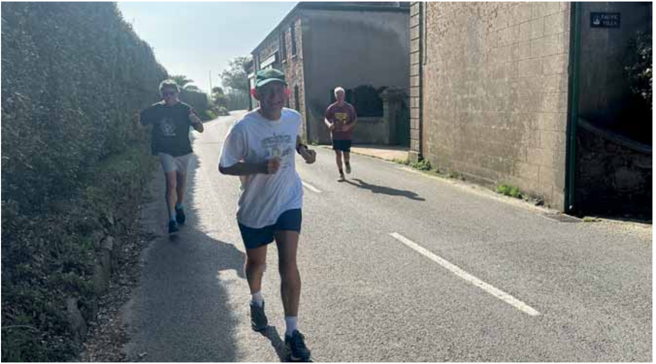
Full Speed past Fauvic Villa