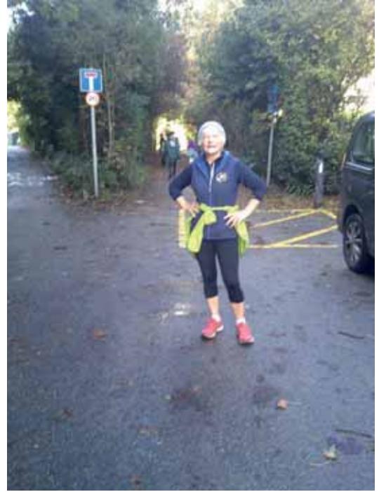
Where are you? I'm waiting!