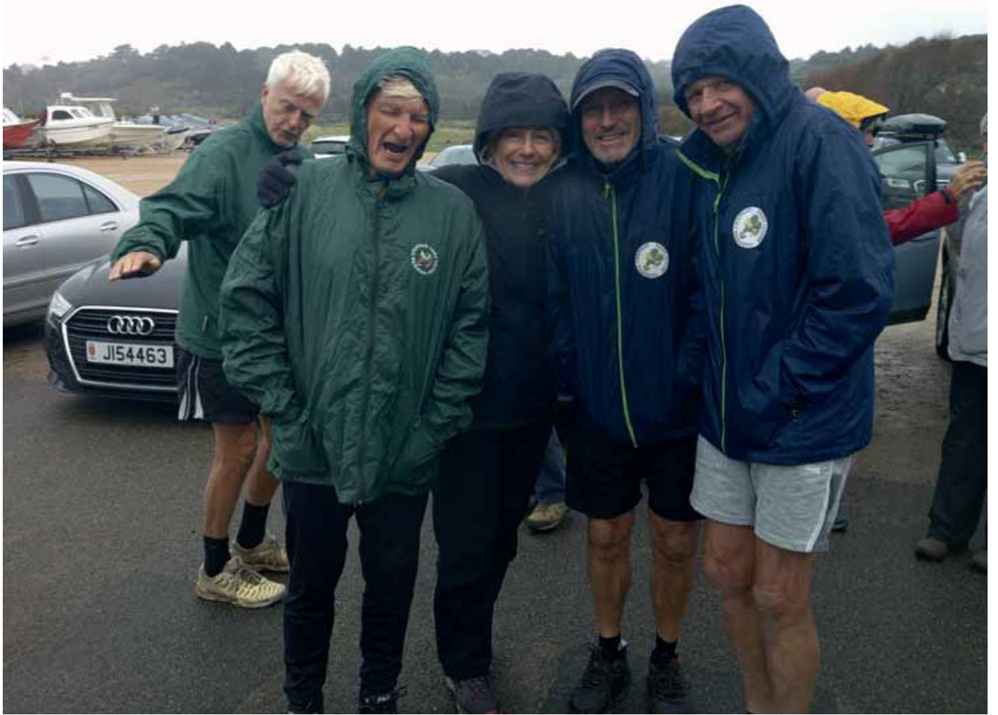
Wet weather gear for all (plus a yawn)