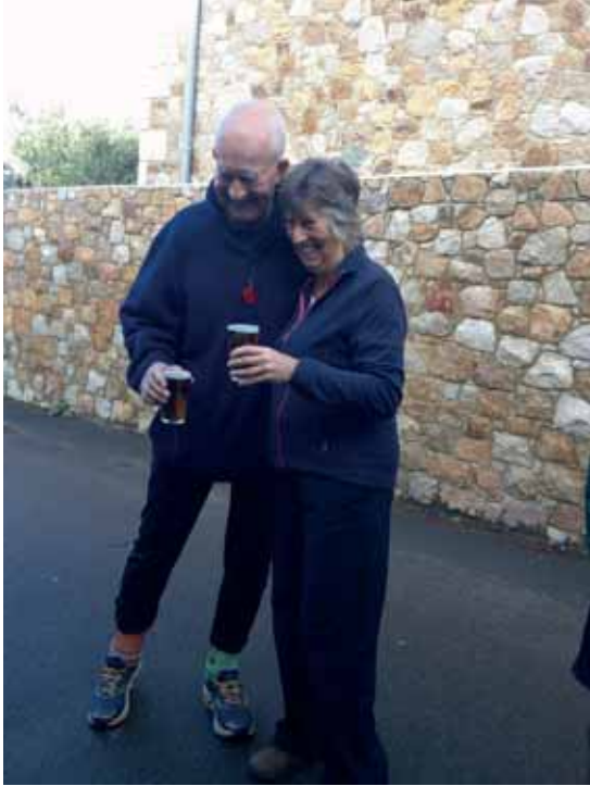
Yes, it is decent ale!