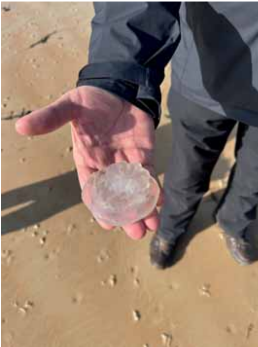
Turned to jelly