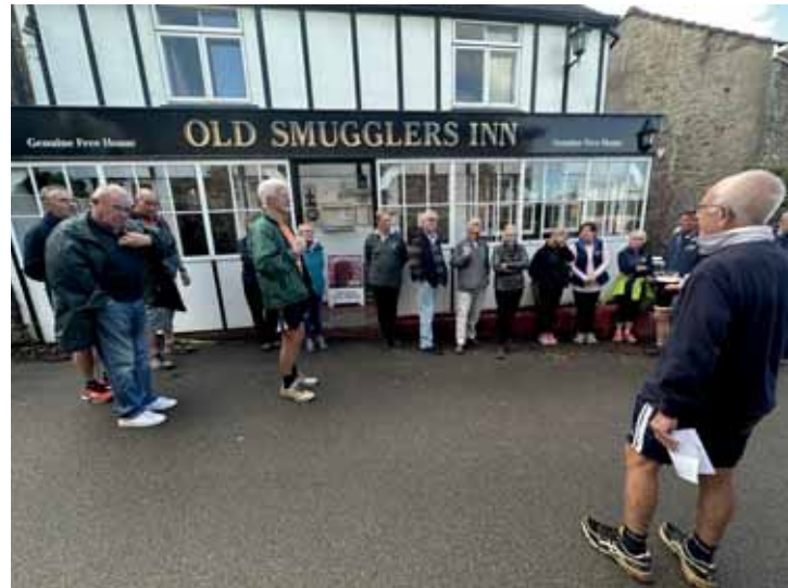
All agog in the road