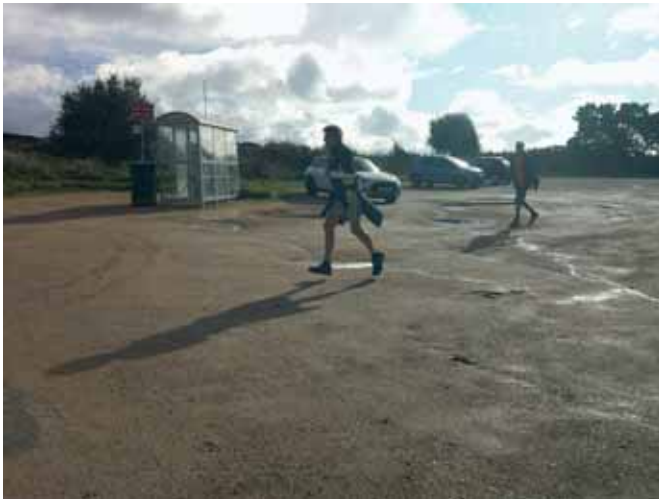
Off piste & catching up