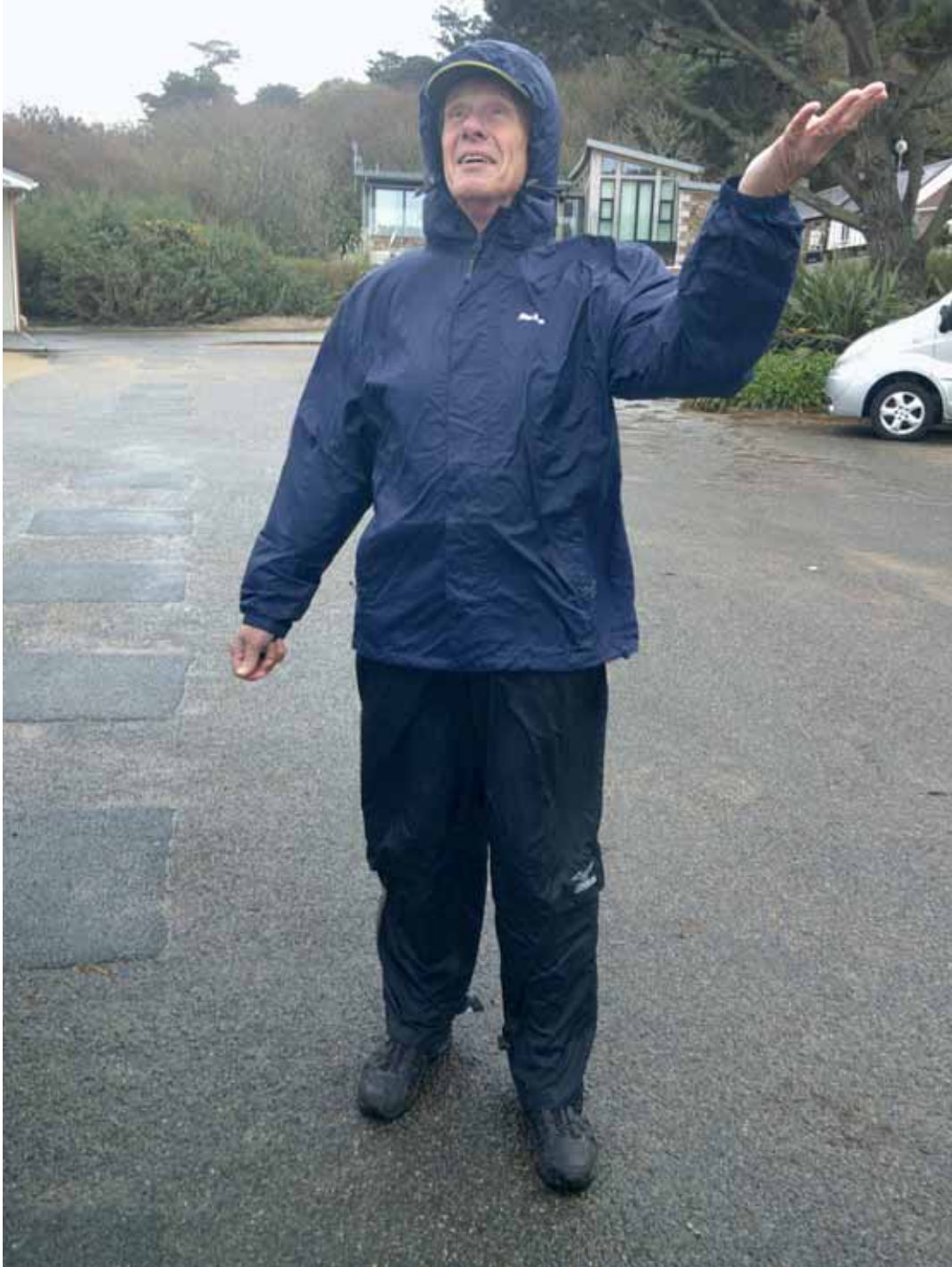
Captain Birds Eye checked out the conditions