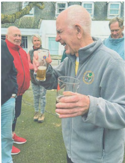
Yuk! GM's worst nightmare