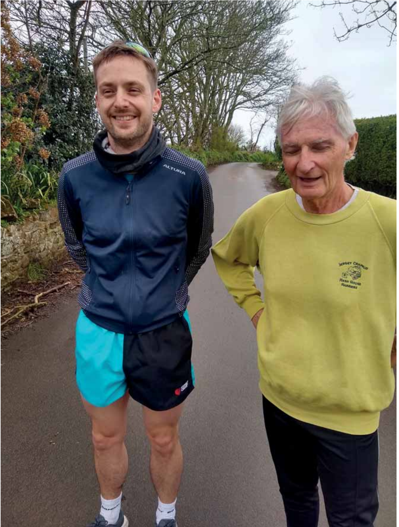
SOFTWARE AND SON