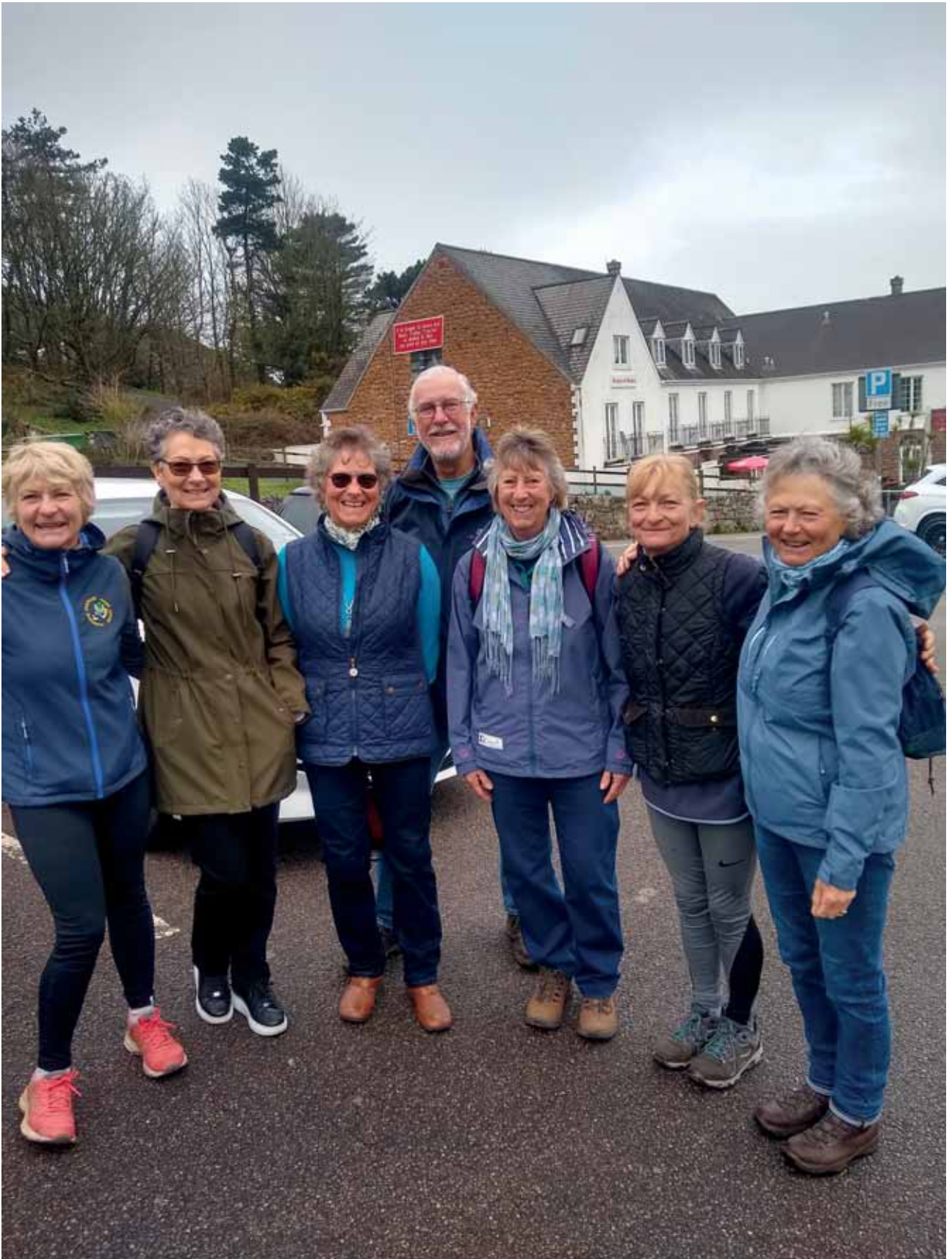
LOTS OF SISTERS AND A BROTHER IN LAW