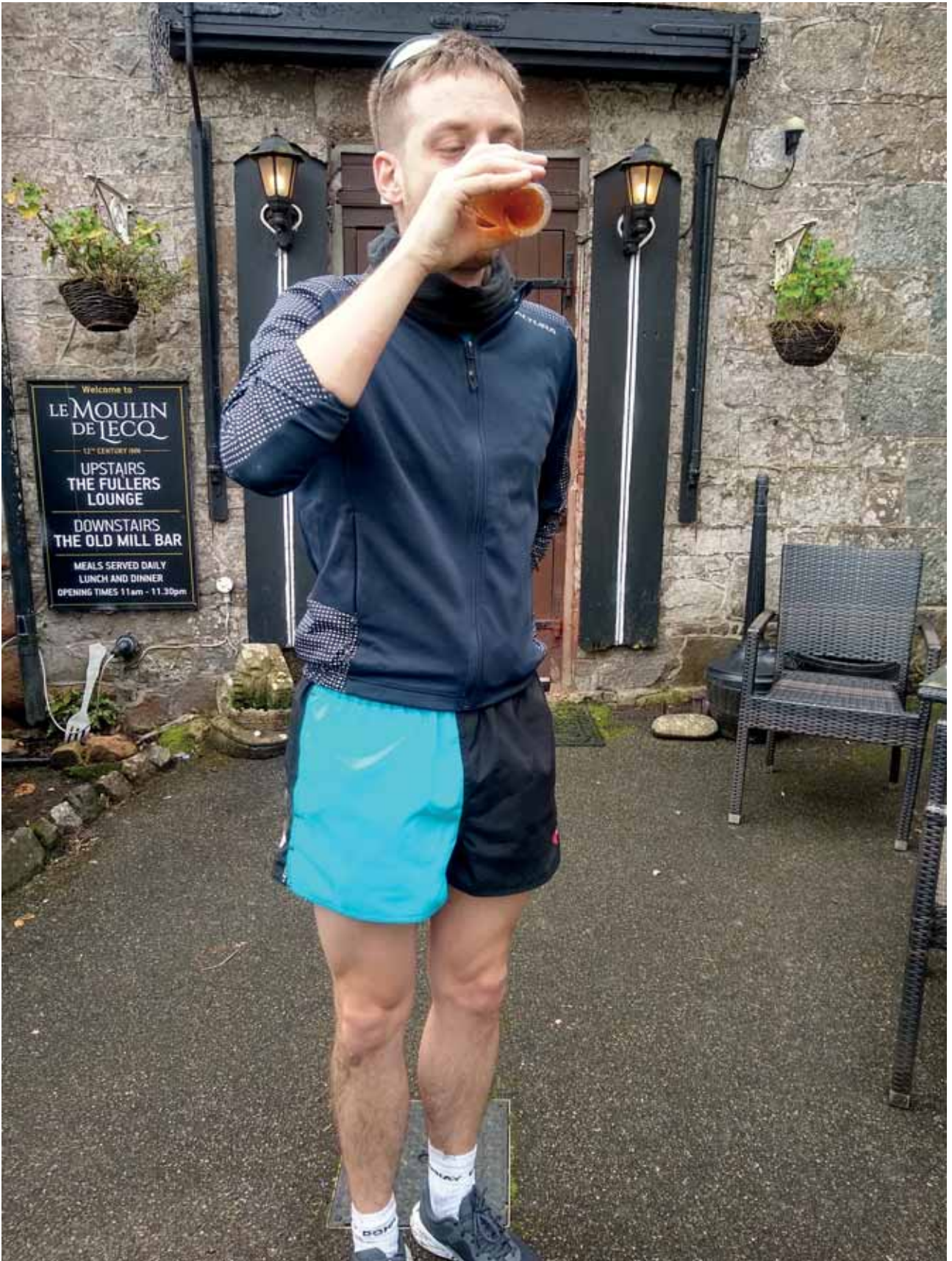
THE SINNER PUNISHED