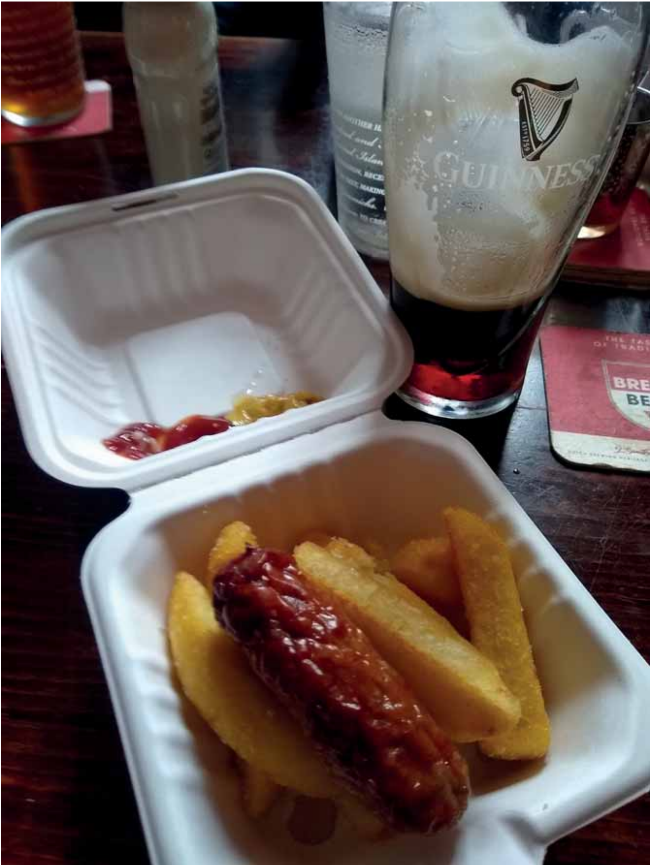
CHIPS, SAUSAGE AND BLACK STUFF