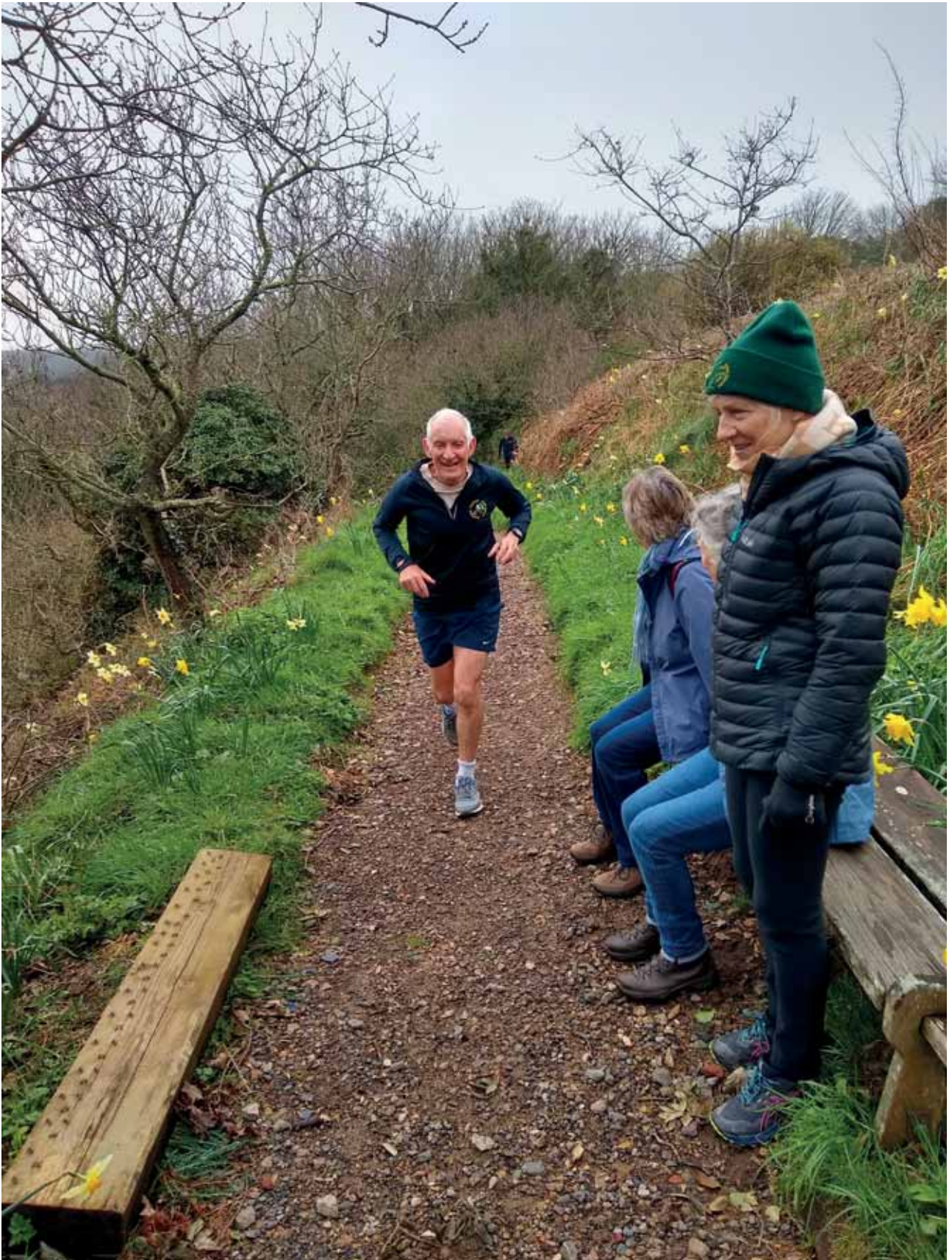
BAGS OF IT LEADS THE WAY