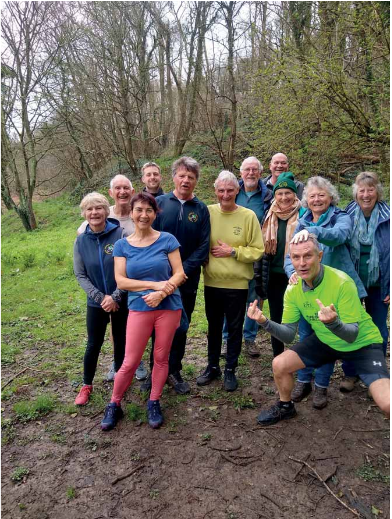
A COMING TOGETHER