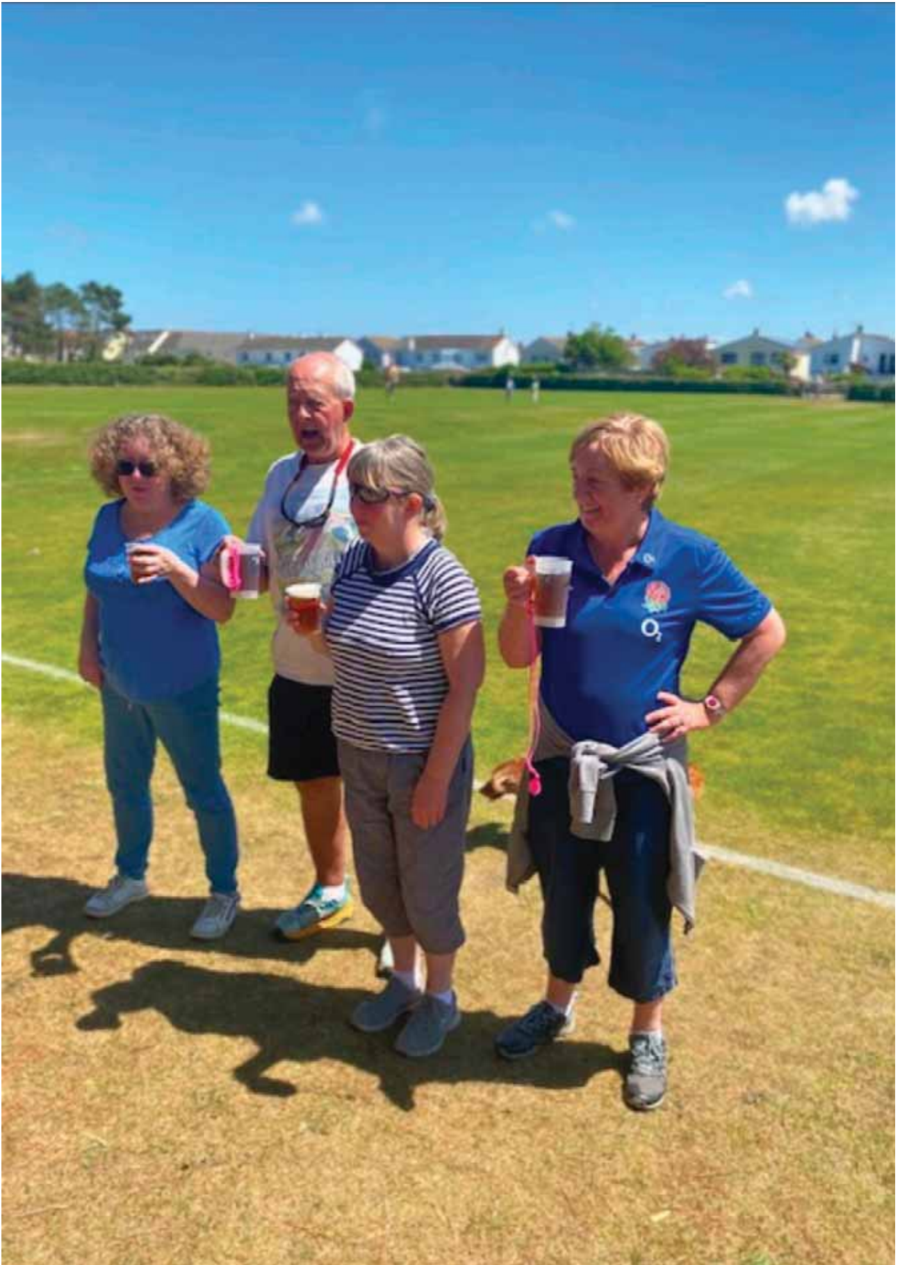
“HASHERS THROUGH AND THROUGH”