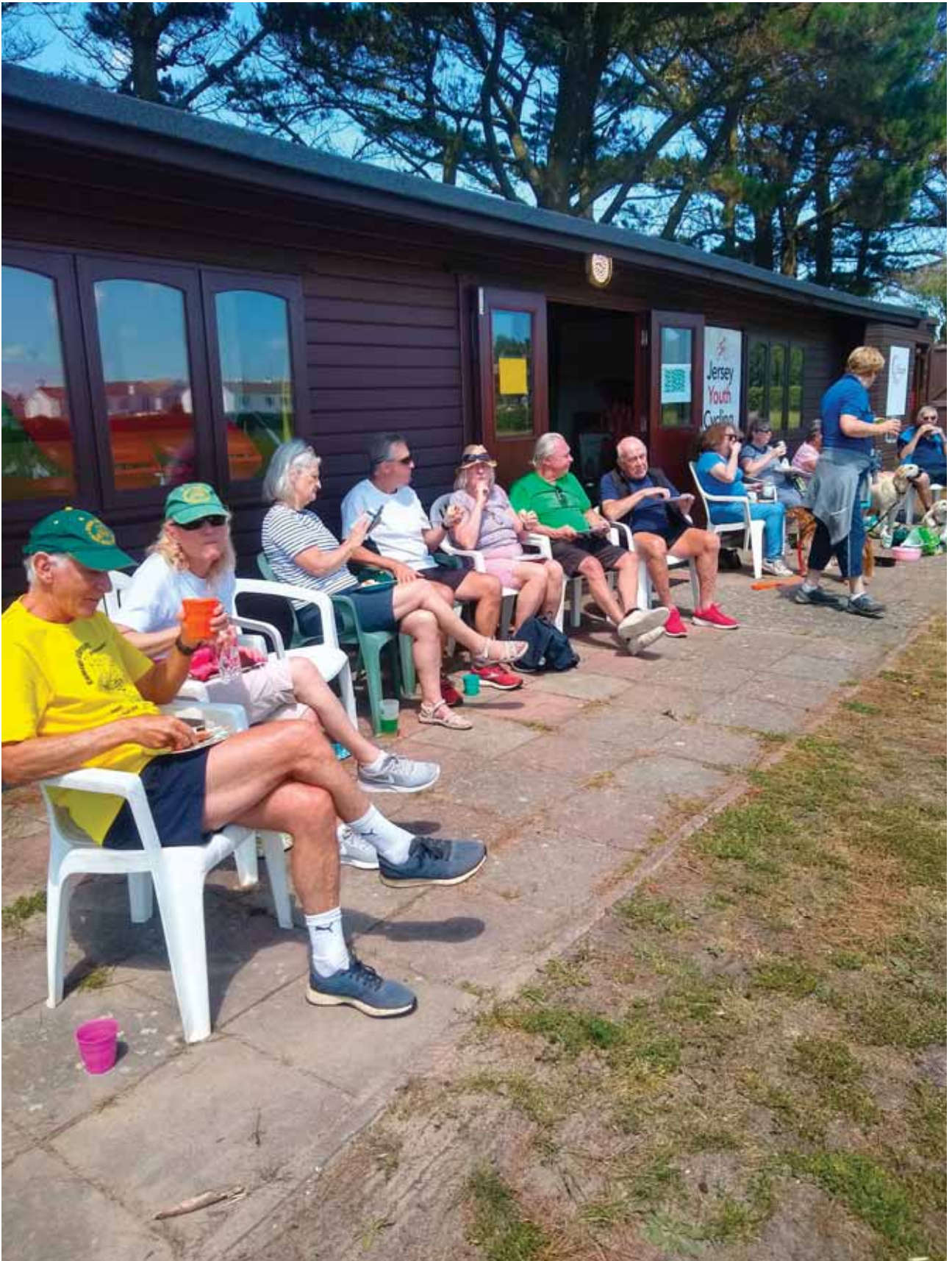
CHEZ CROQUET CLUB