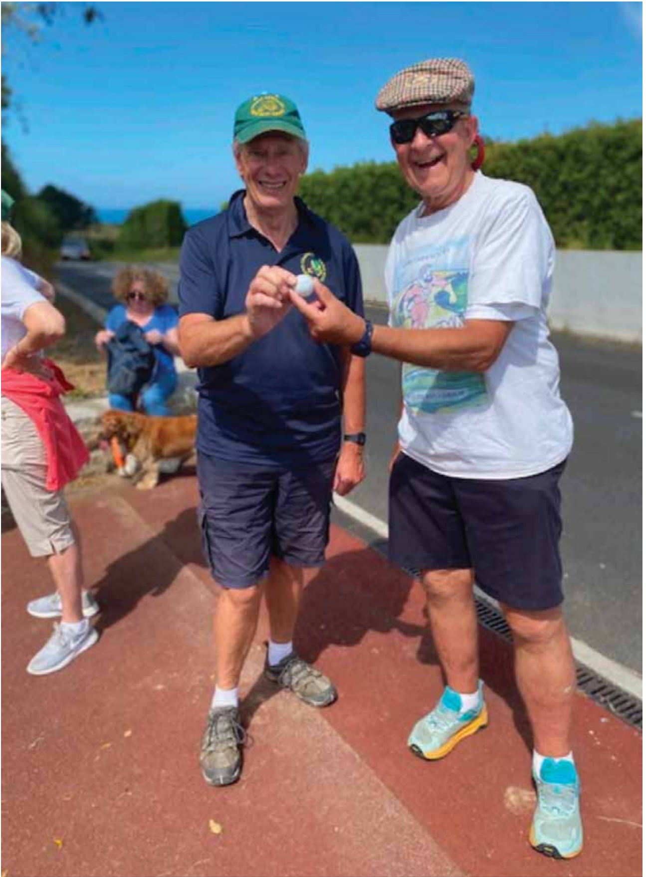
BALLS TO YOU