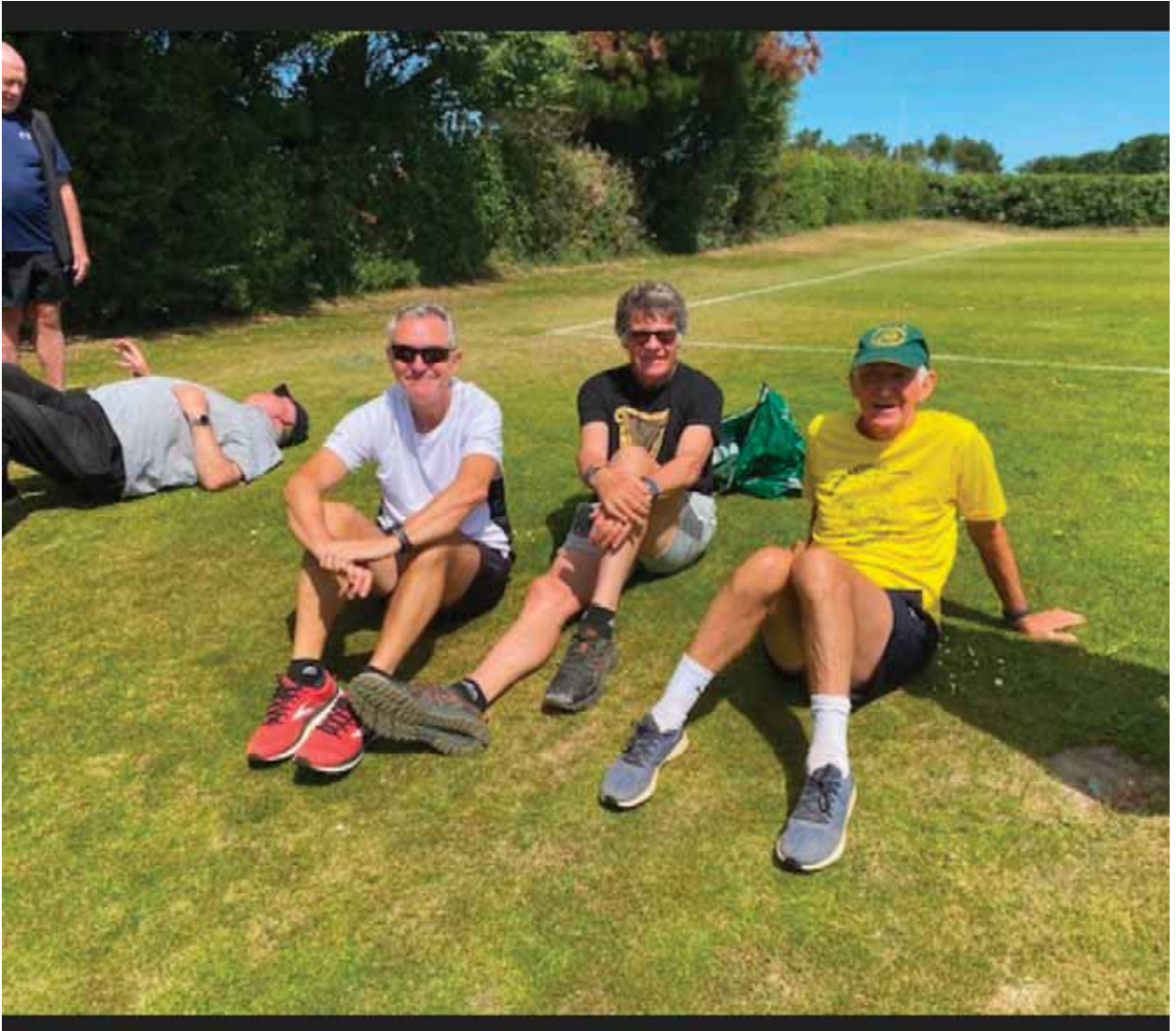
LOVELY DAY FOR LOUNGING ABOUT