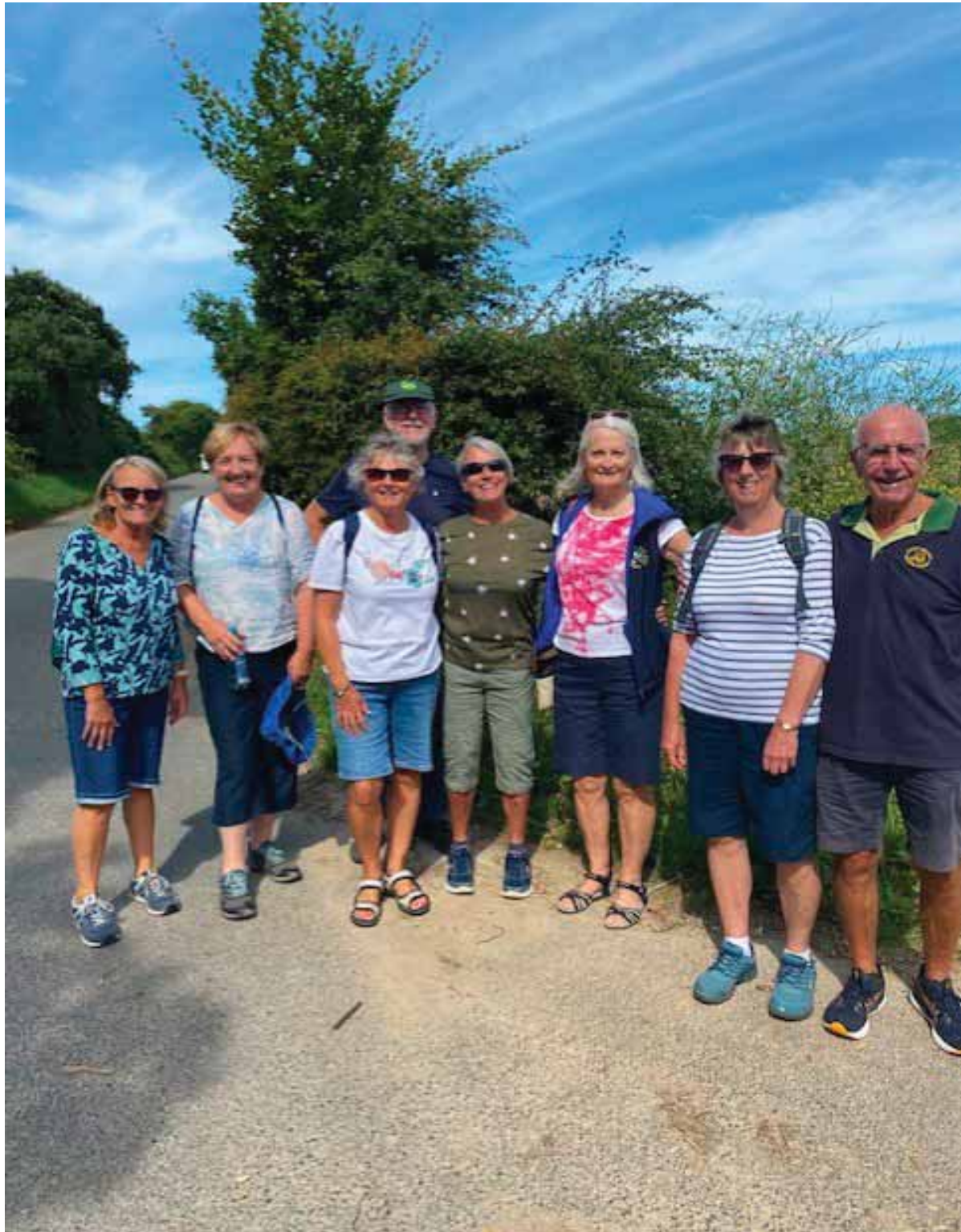
“HASHERS THROUGH AND THROUGH”