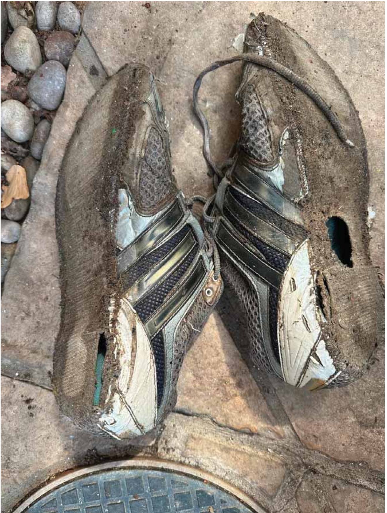
TINKY'S OLD AND BATTERED FOOTWEAR