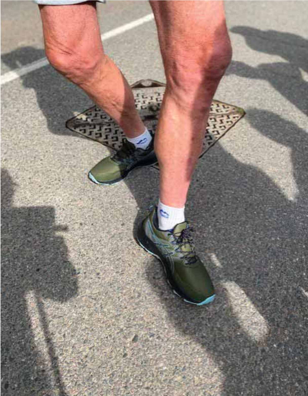
JACKO'S BRAND NEW FOOTWEAR