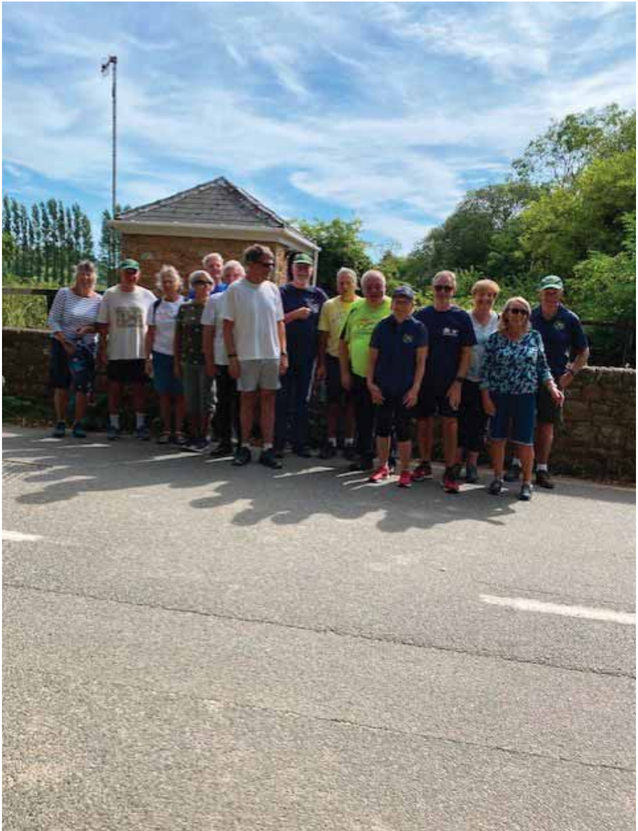
THE PACK ASSEMBLES