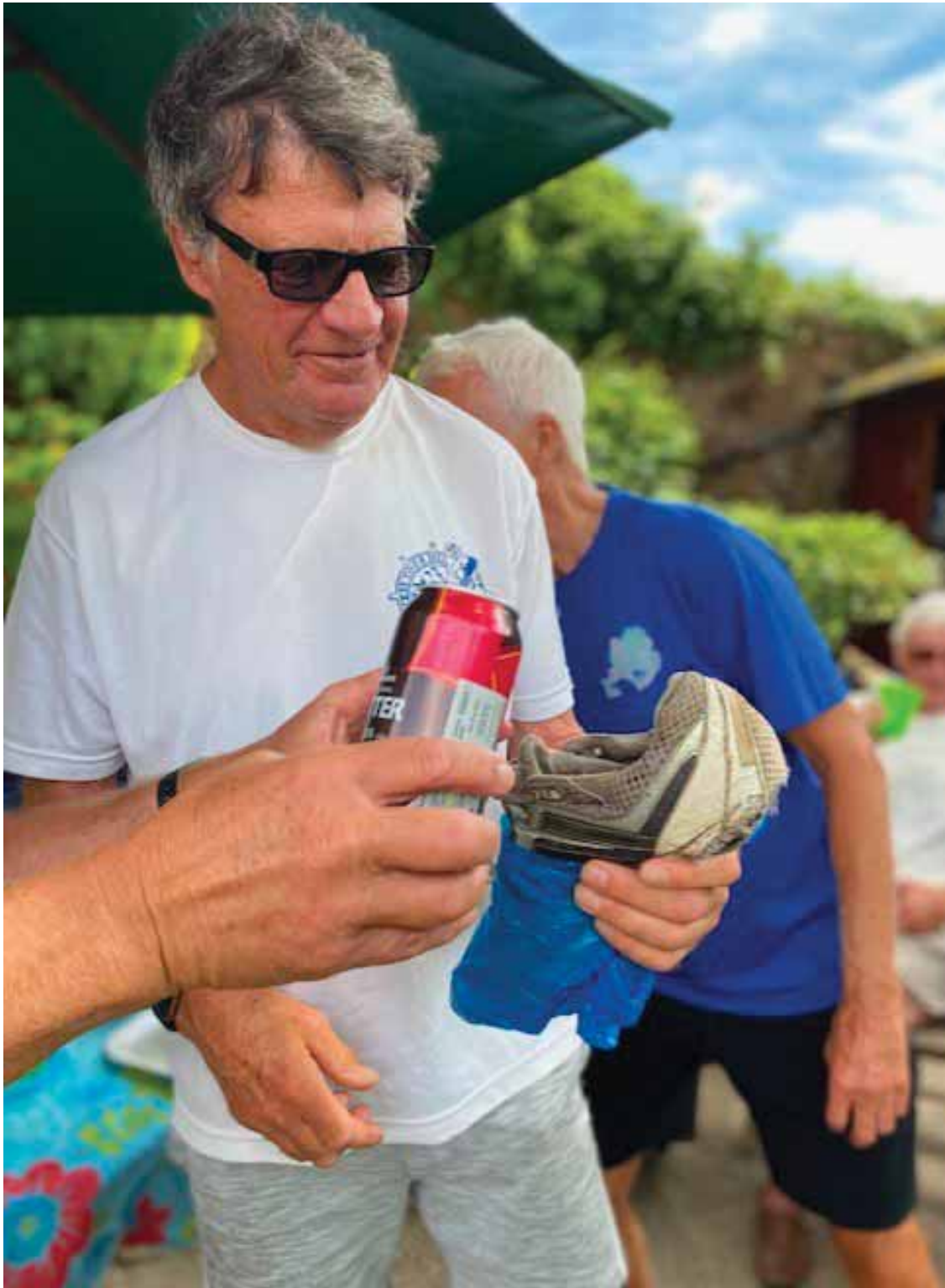
TINKY'S BATTERED FOOTWEAR SERVES ANOTHER PURPOSE