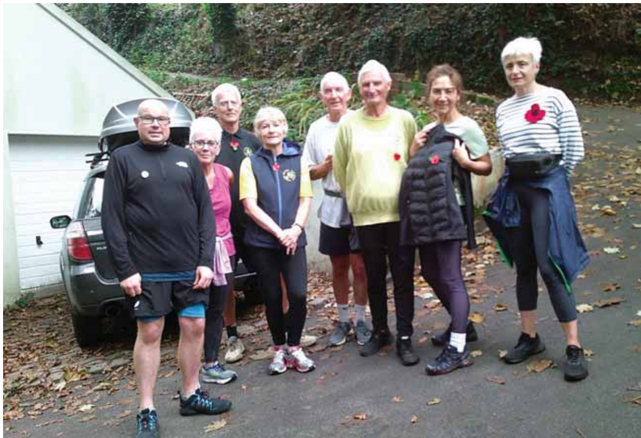
Post Remembrance pause