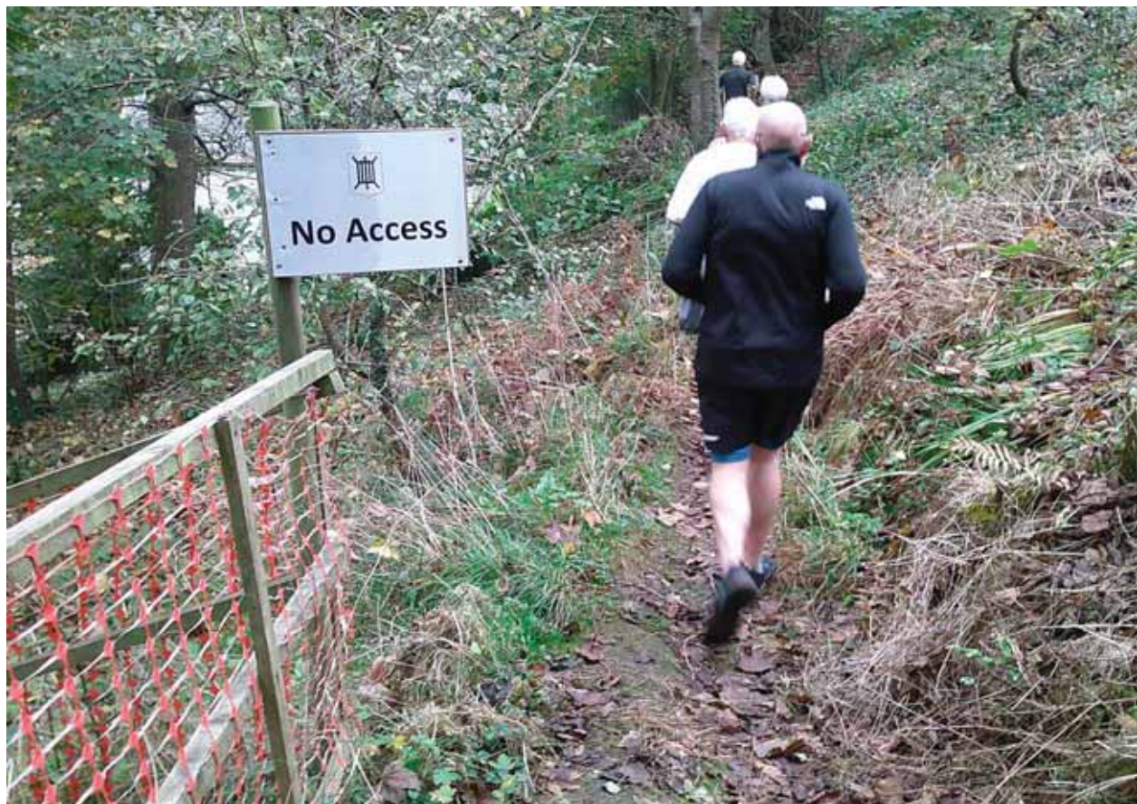
Does not apply to Hashers