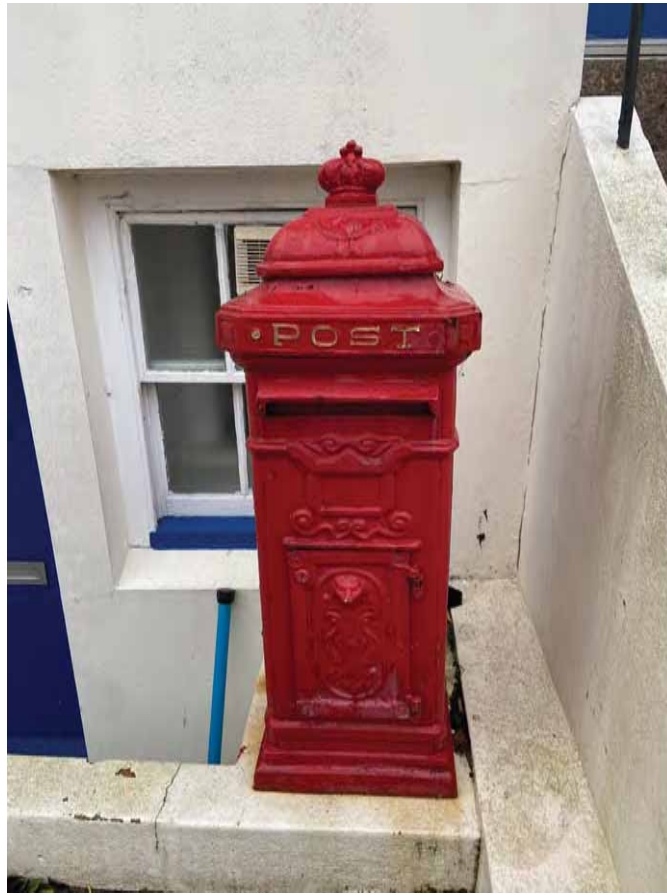
Too late for this Christmas