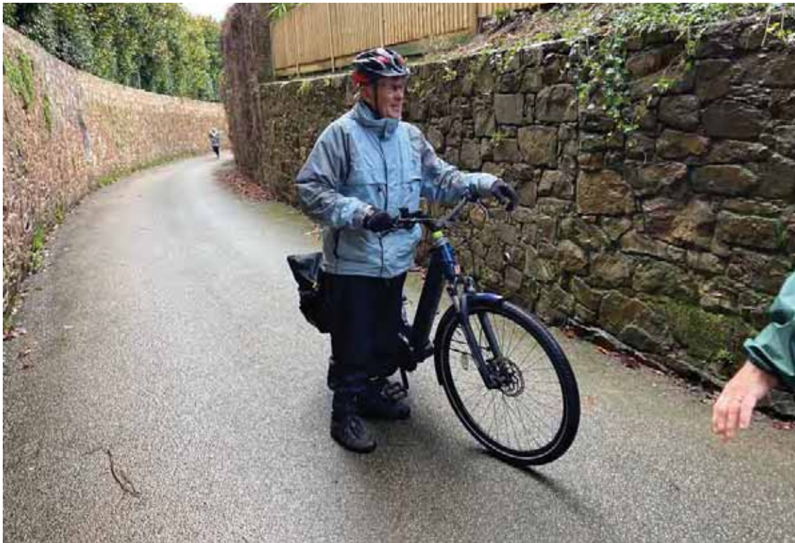
Still with us!