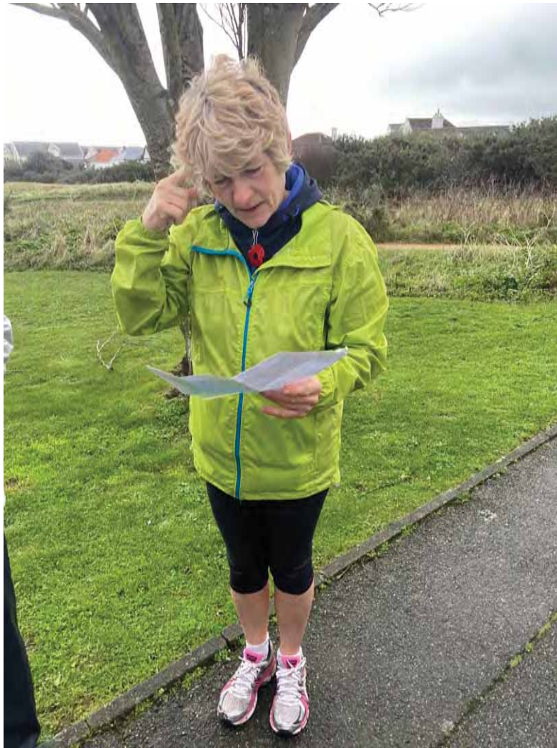
Puzzled even before the start