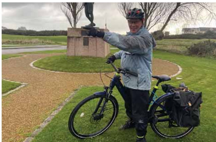
It's that a way!