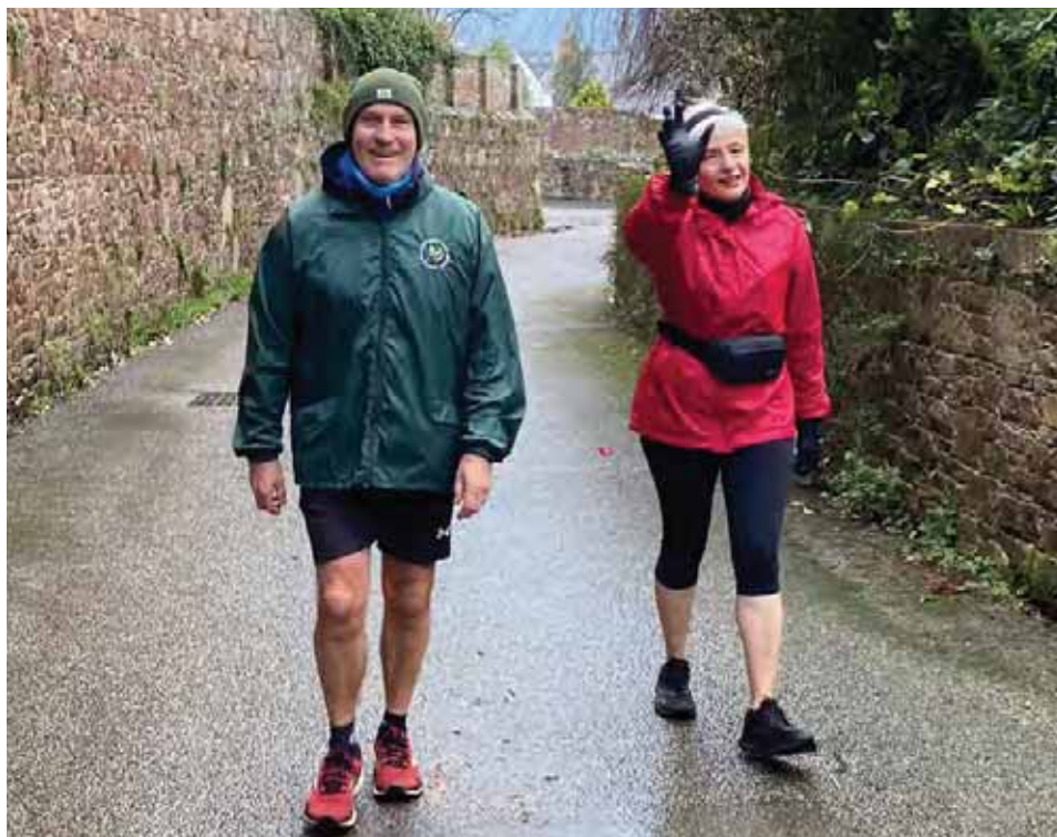
Catching Steptoe up