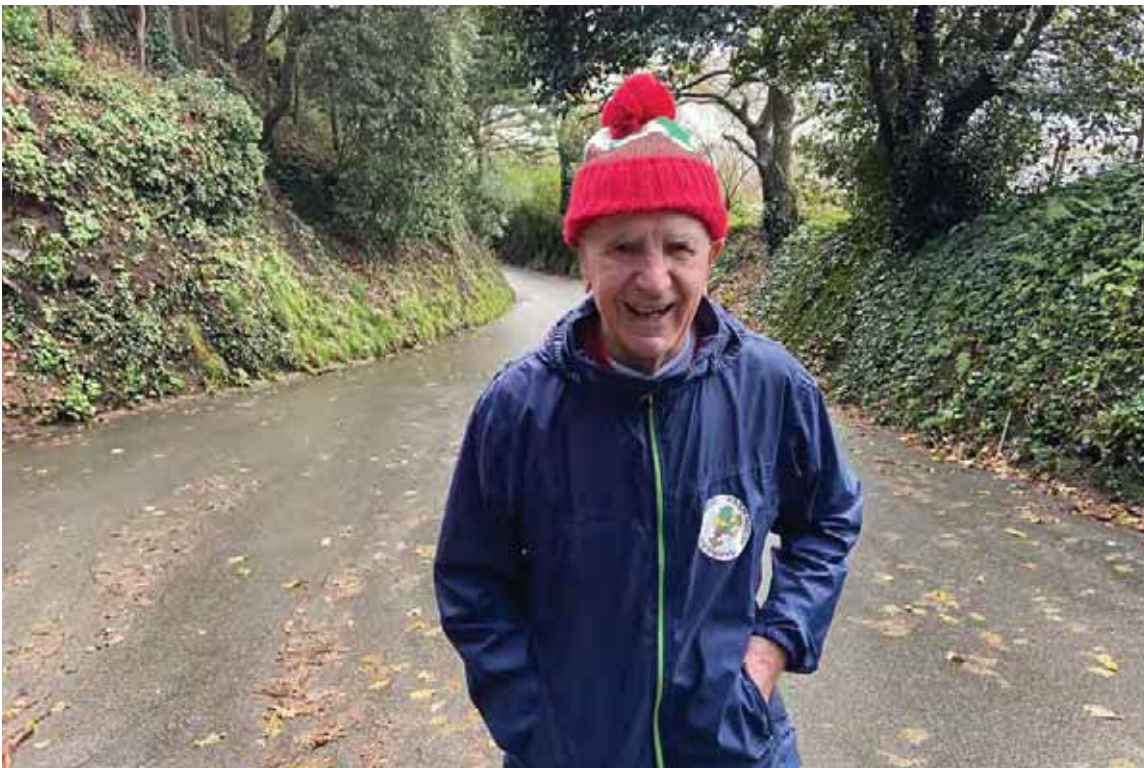
Pleased to be back with the pack!