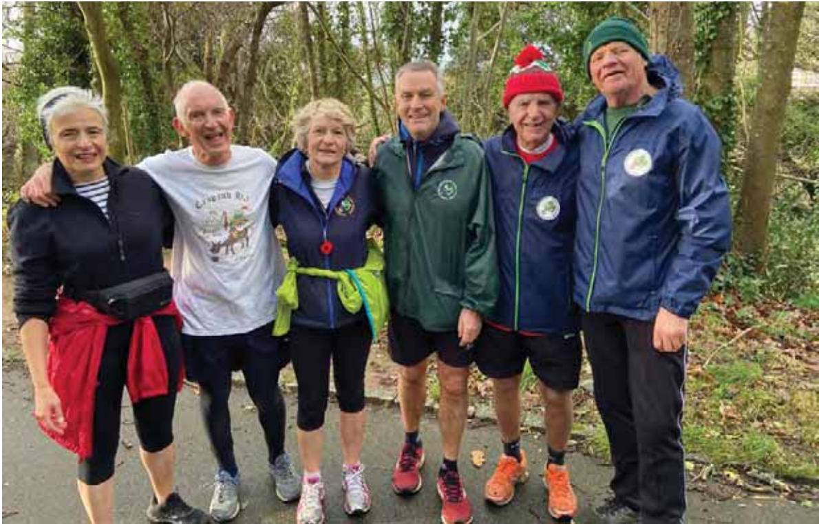
Last photo before the drop!