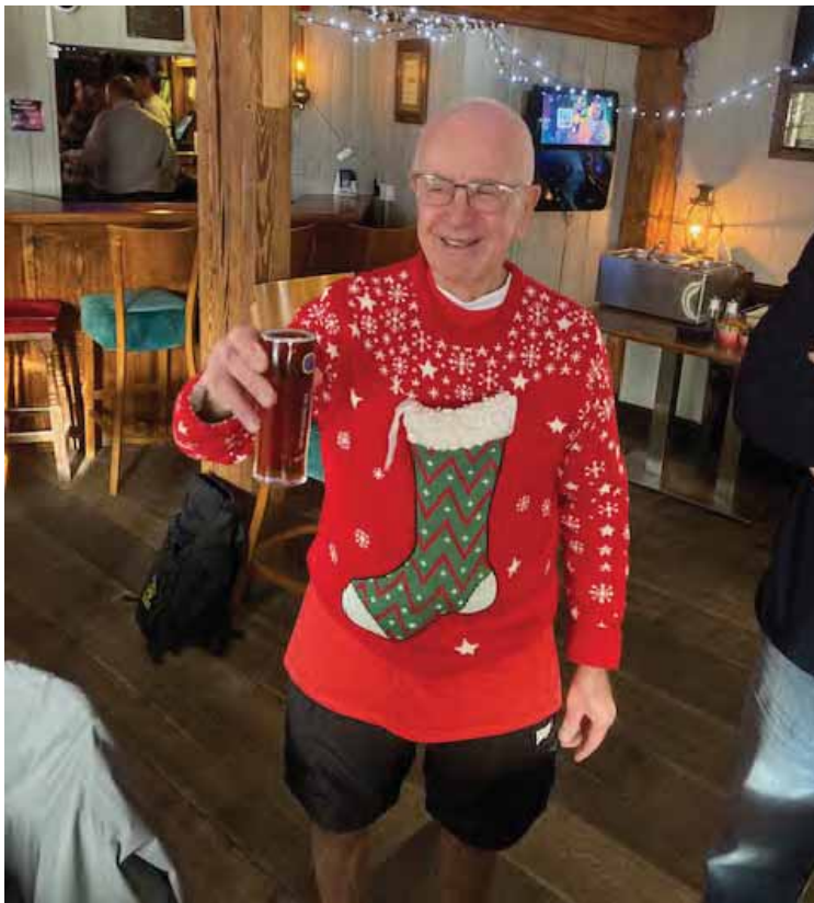
At least it's decent ale!