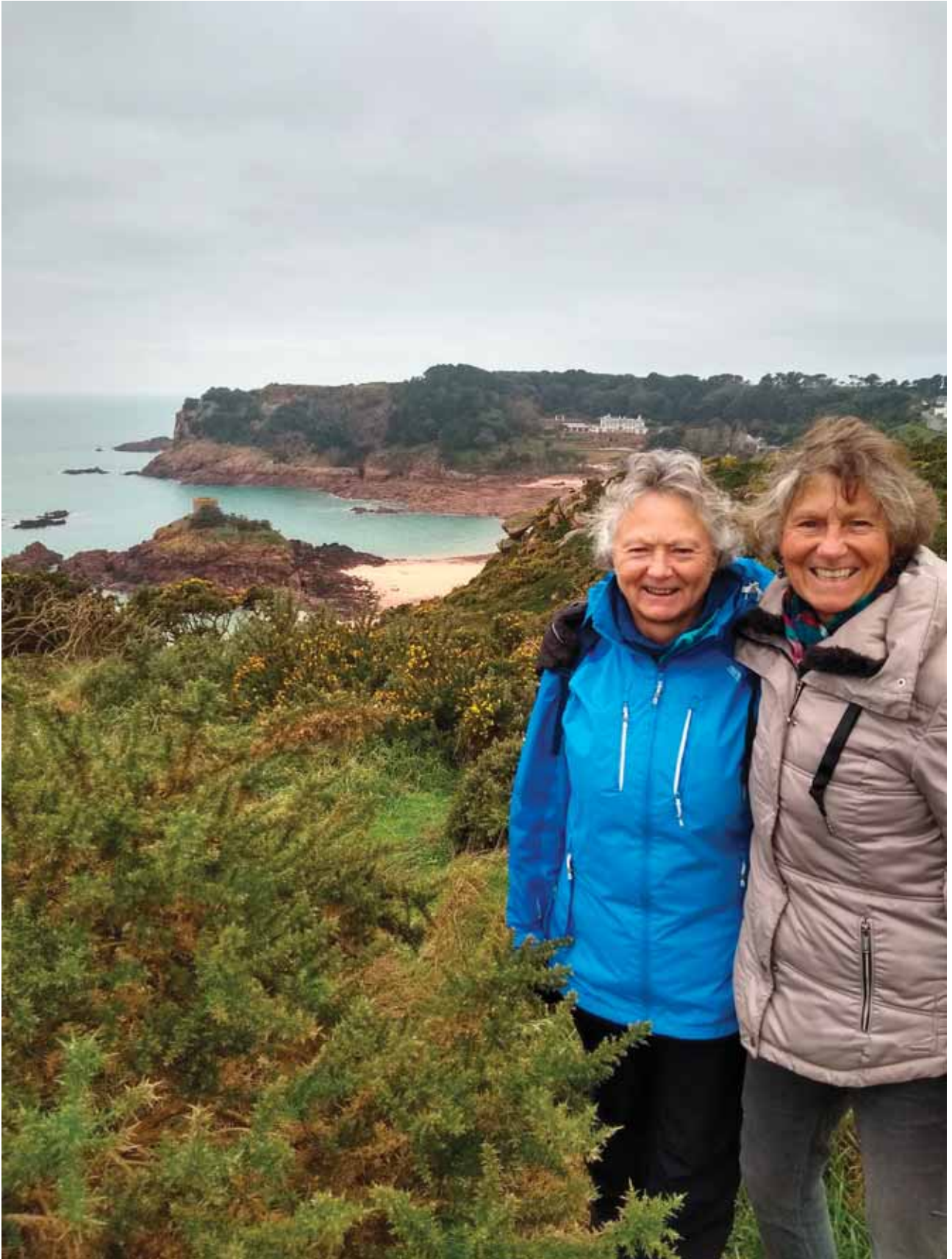
What a lovely view