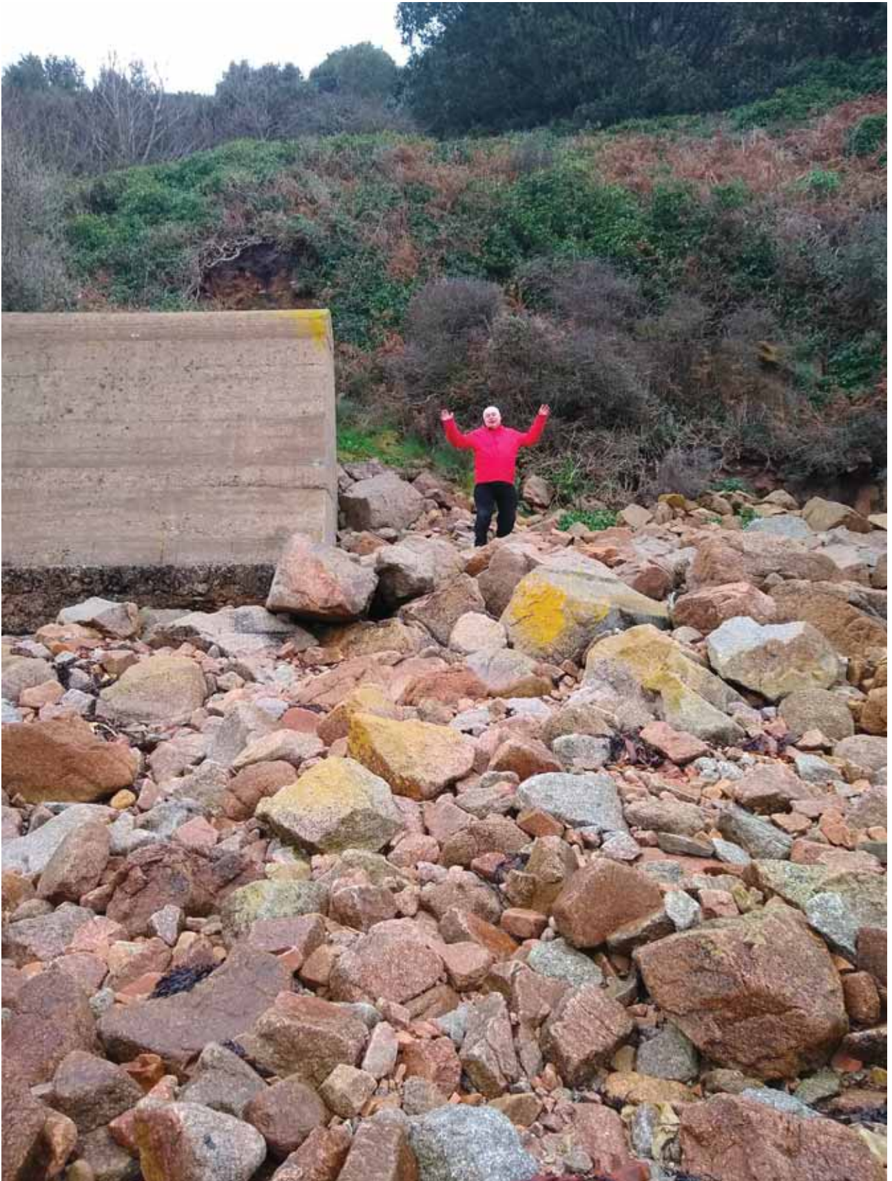
And that was the last we saw of Tinky until the pub