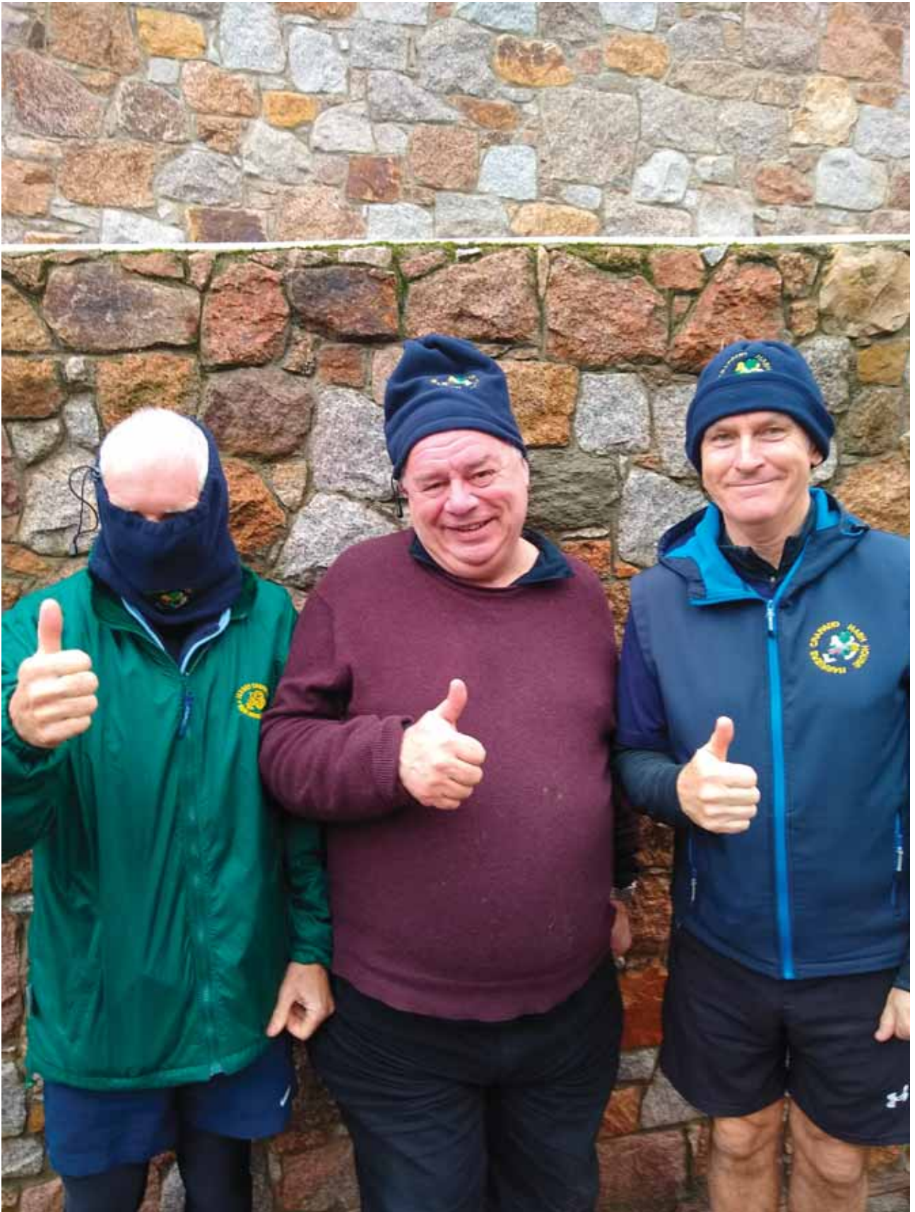
Our Xmas gifts beautifully modelled