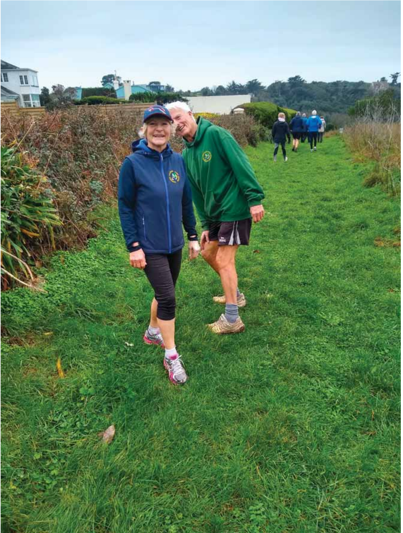
“He's behind you”