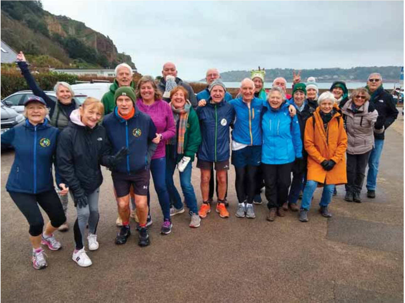
What a happy bunch