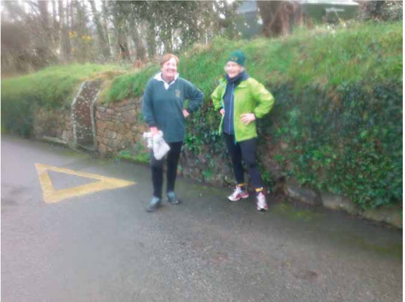
Pausing for breath