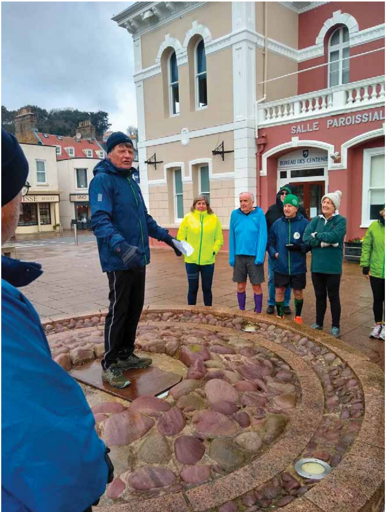
Friends, Hashers, Countrymen...