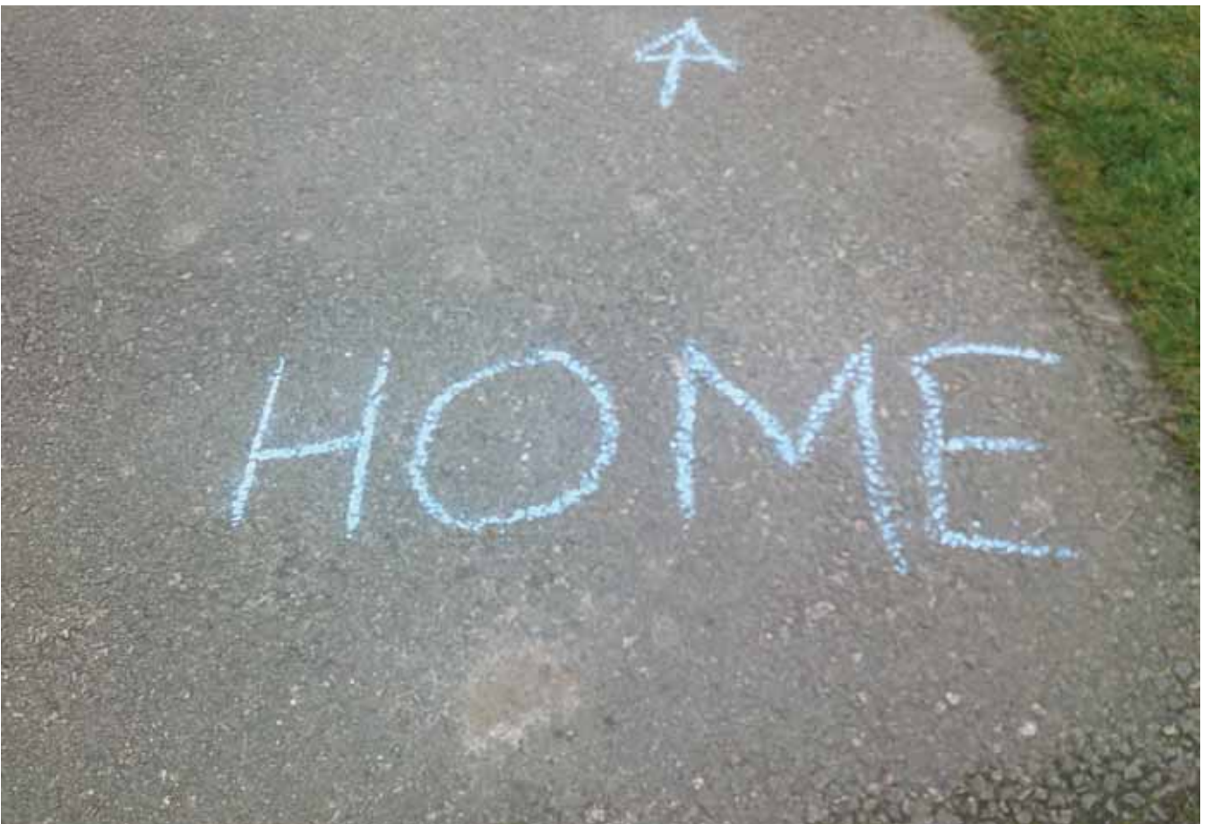
At Last, Thank God!