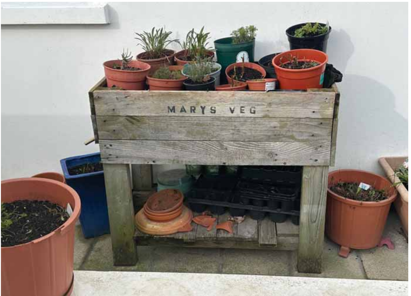
Marys Private Veg. Garden Needs Help! (Tinks)