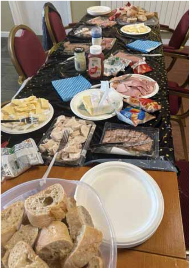
Smorgasbord Repast! (Tinks)