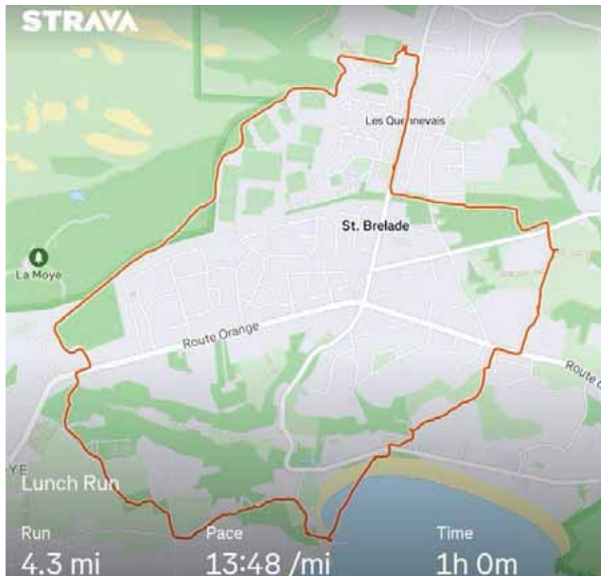
Runners Trail according to Strava! (Steptoe)