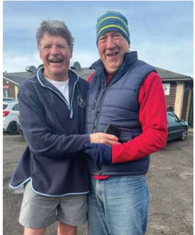
GM's Cuddling! (Tinks)