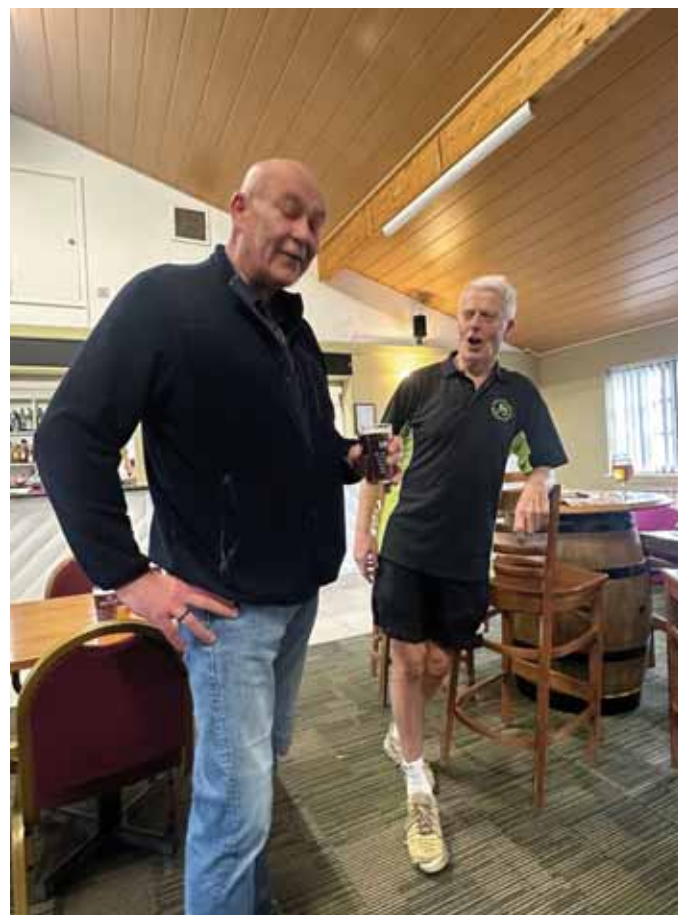
Illegal Entry's Birthday! (Tinks)