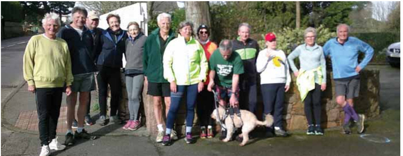
JH3 & CH3 Runners Re-united!