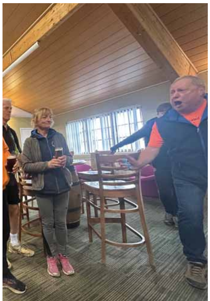
Rampant's Gone Rampant! (Tinks)