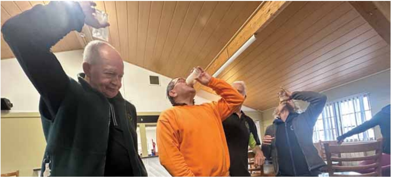
The Last Dregs! (Tinks)