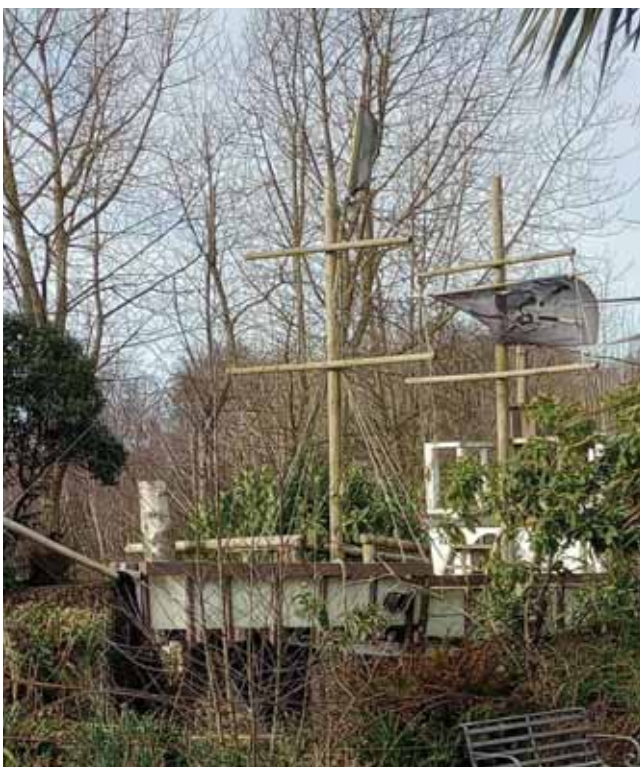
Shipwrecked on Dry Land! (Big Dick)