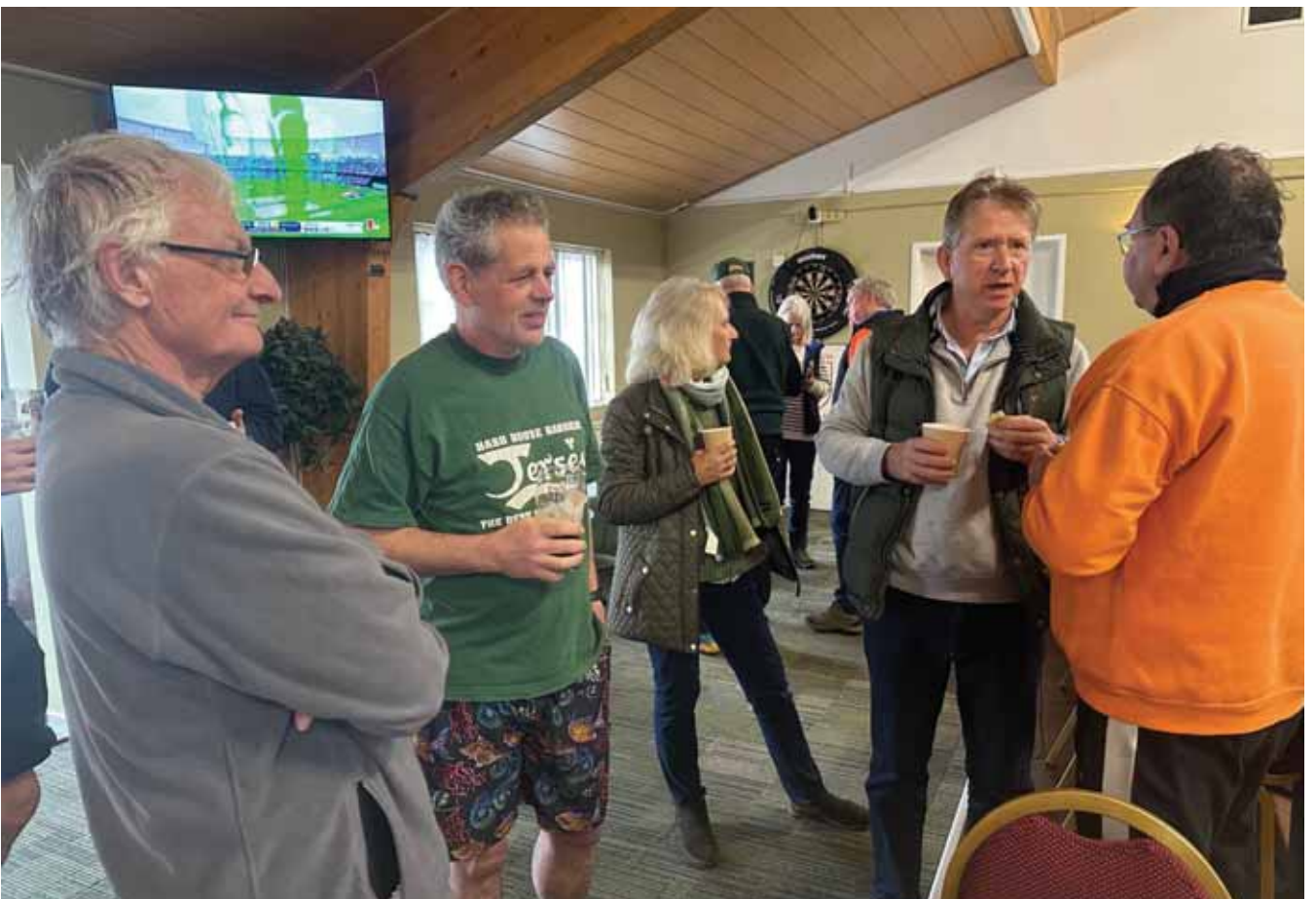
More Joint Hash Chattering! (Tinks)