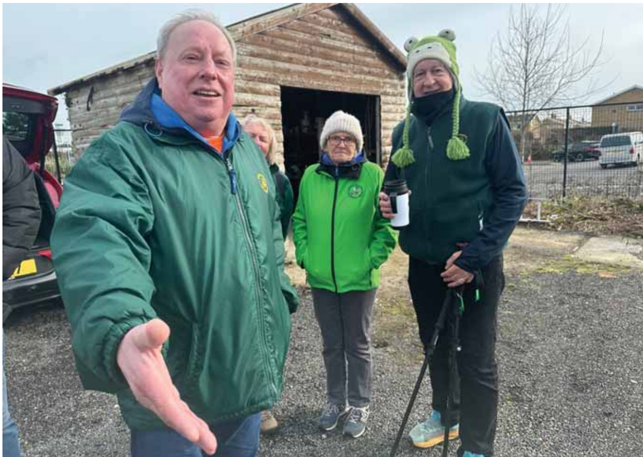
Rampant's Hand of Friendship (Tinks)