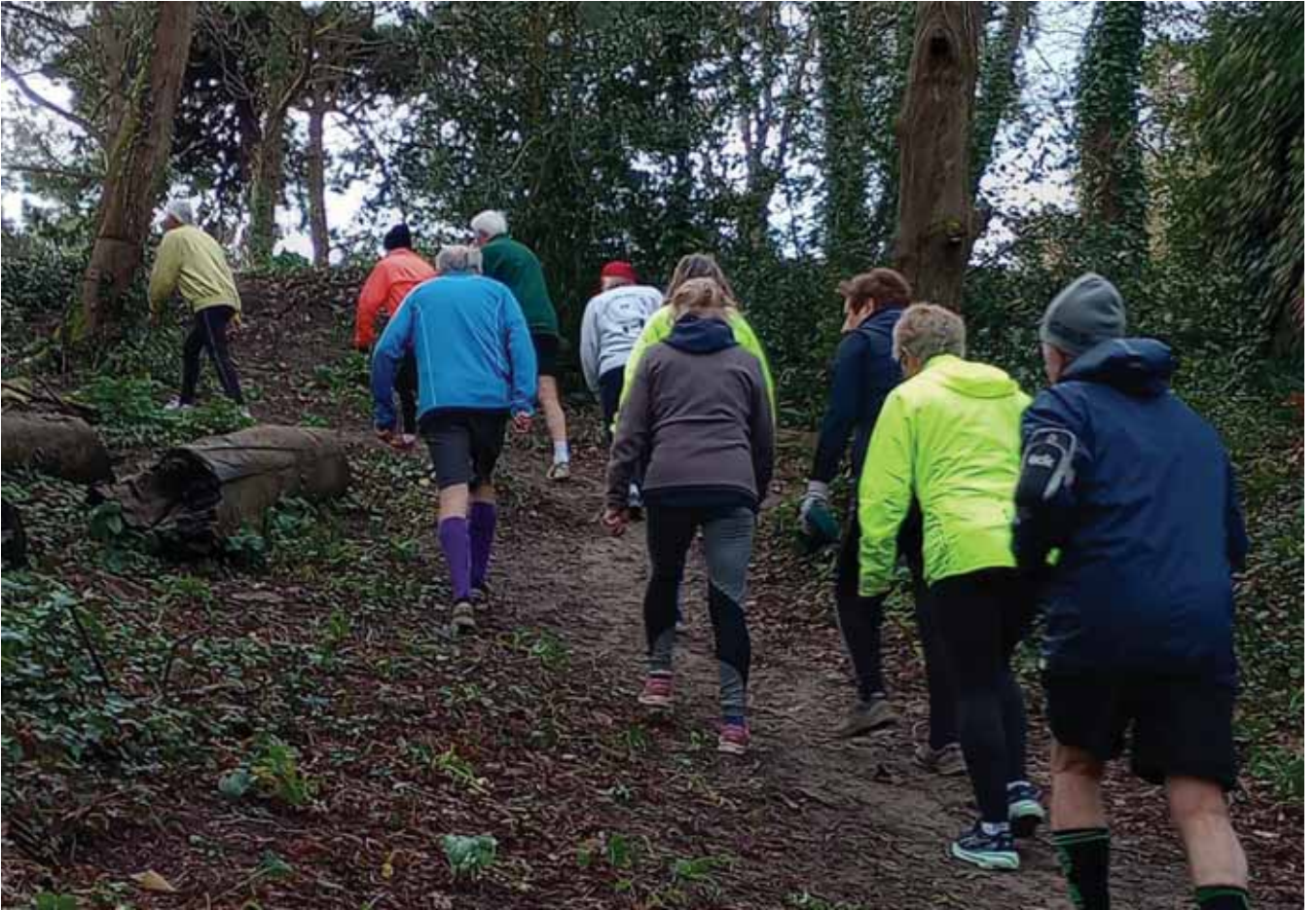
Climbing back up above Chemin des Creux! (Big Dick)