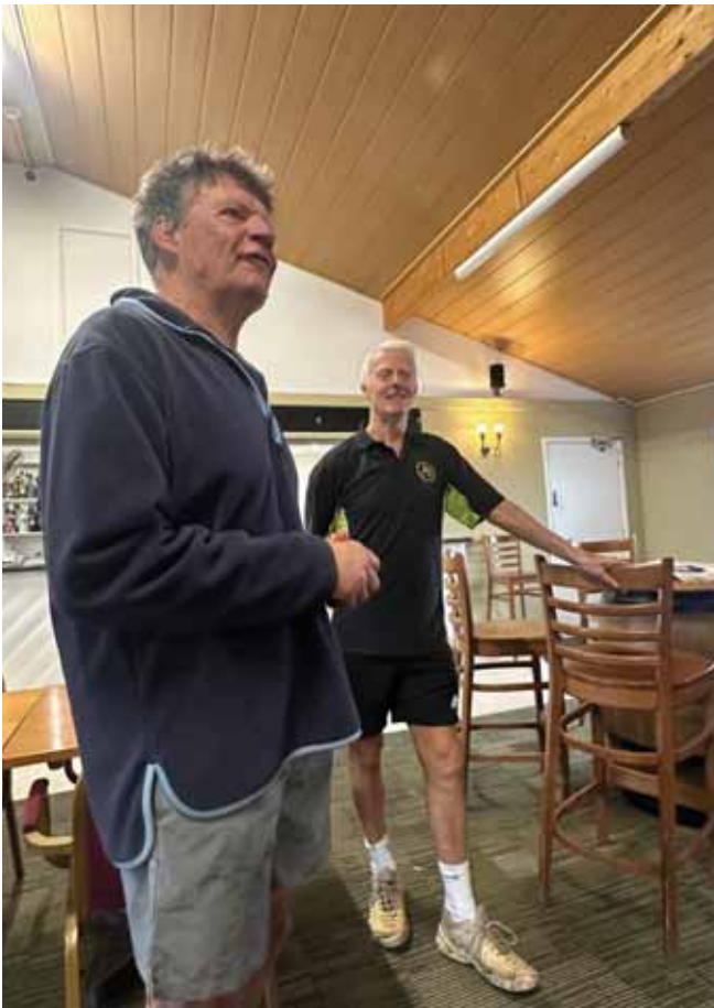
CH3's New GM Takes Over! (Tinks)