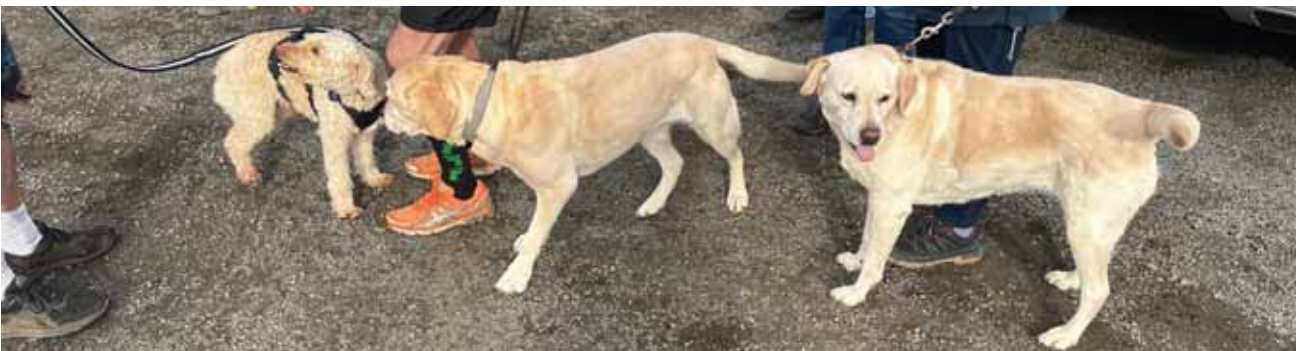
It's a Dogs Life! (Tinks)