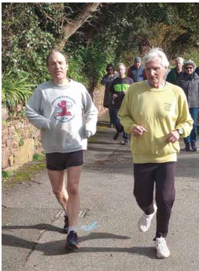
Joint Runners! (Big Dick)