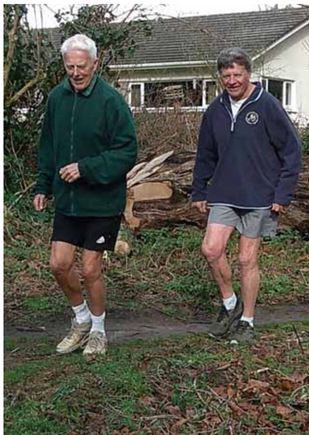
CH3's New GM Stalking RA! (Steptoe)