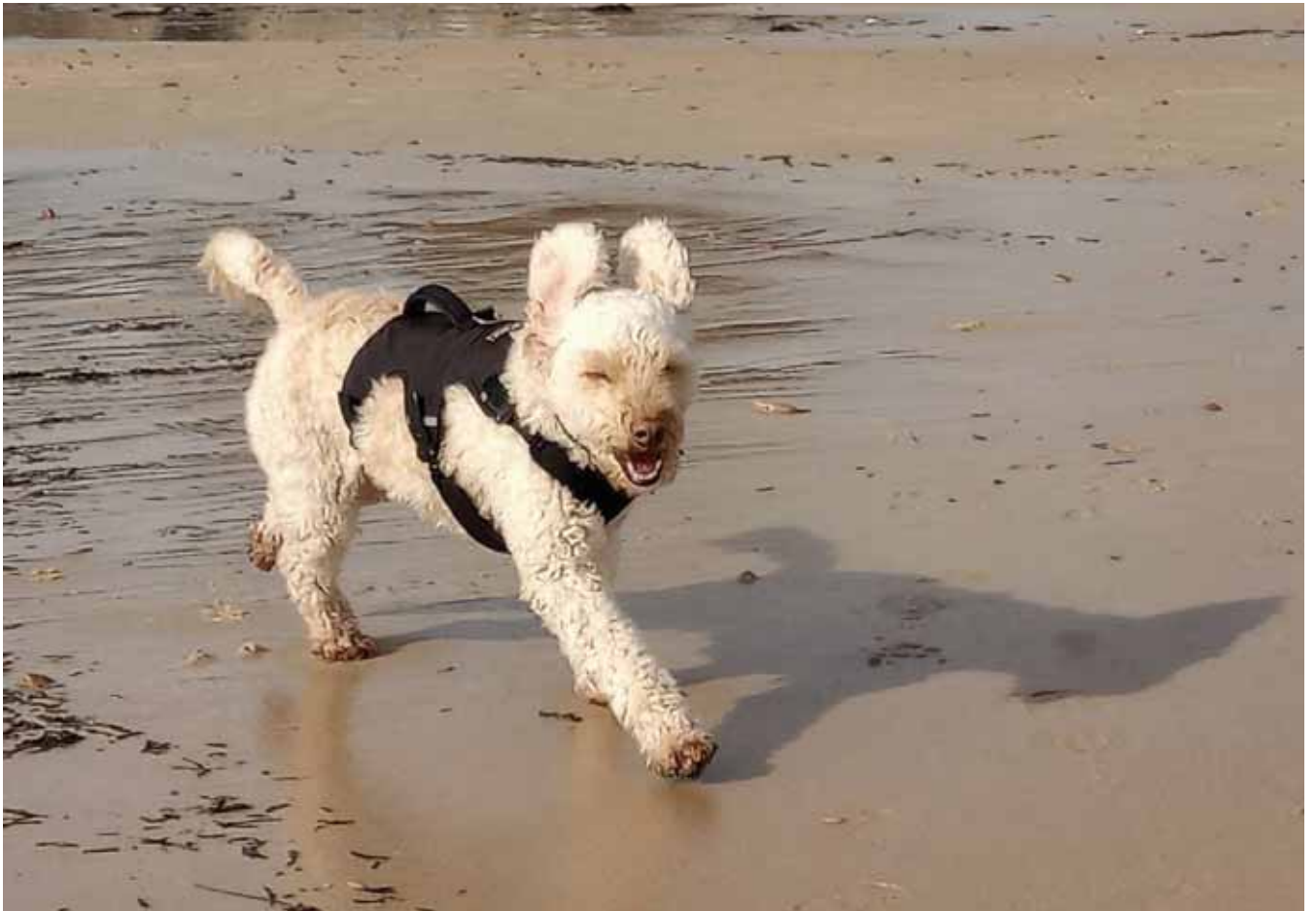
Gallop ing on the Beach! (Big Dick)