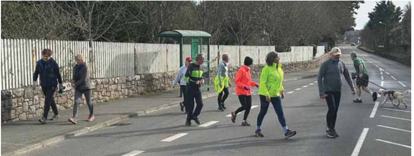
Runners Going in all Directions! (Tinks)