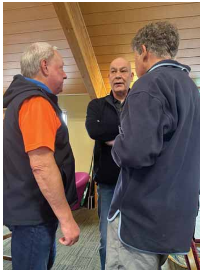
Serious Hash Discussion! (Tinks)