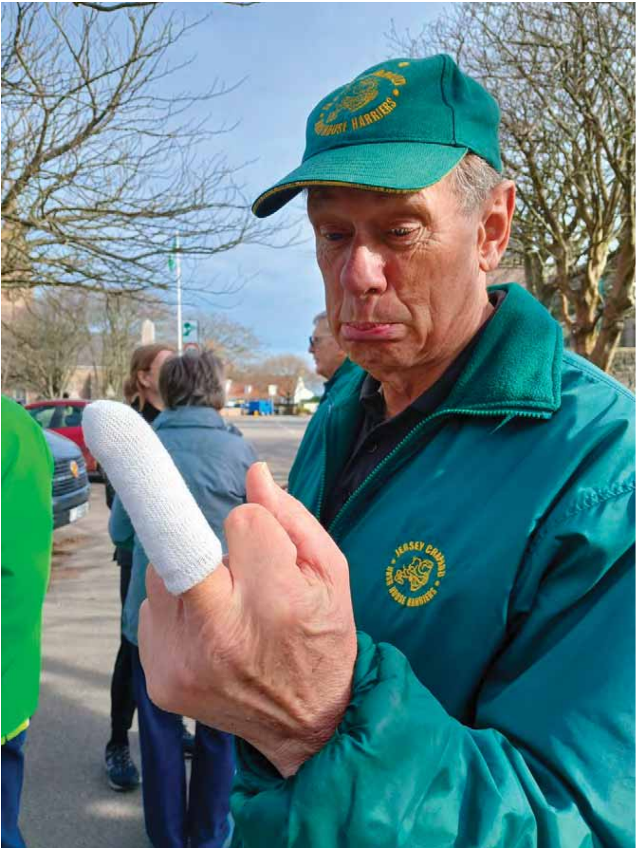
Smuggler's poorly finger.....