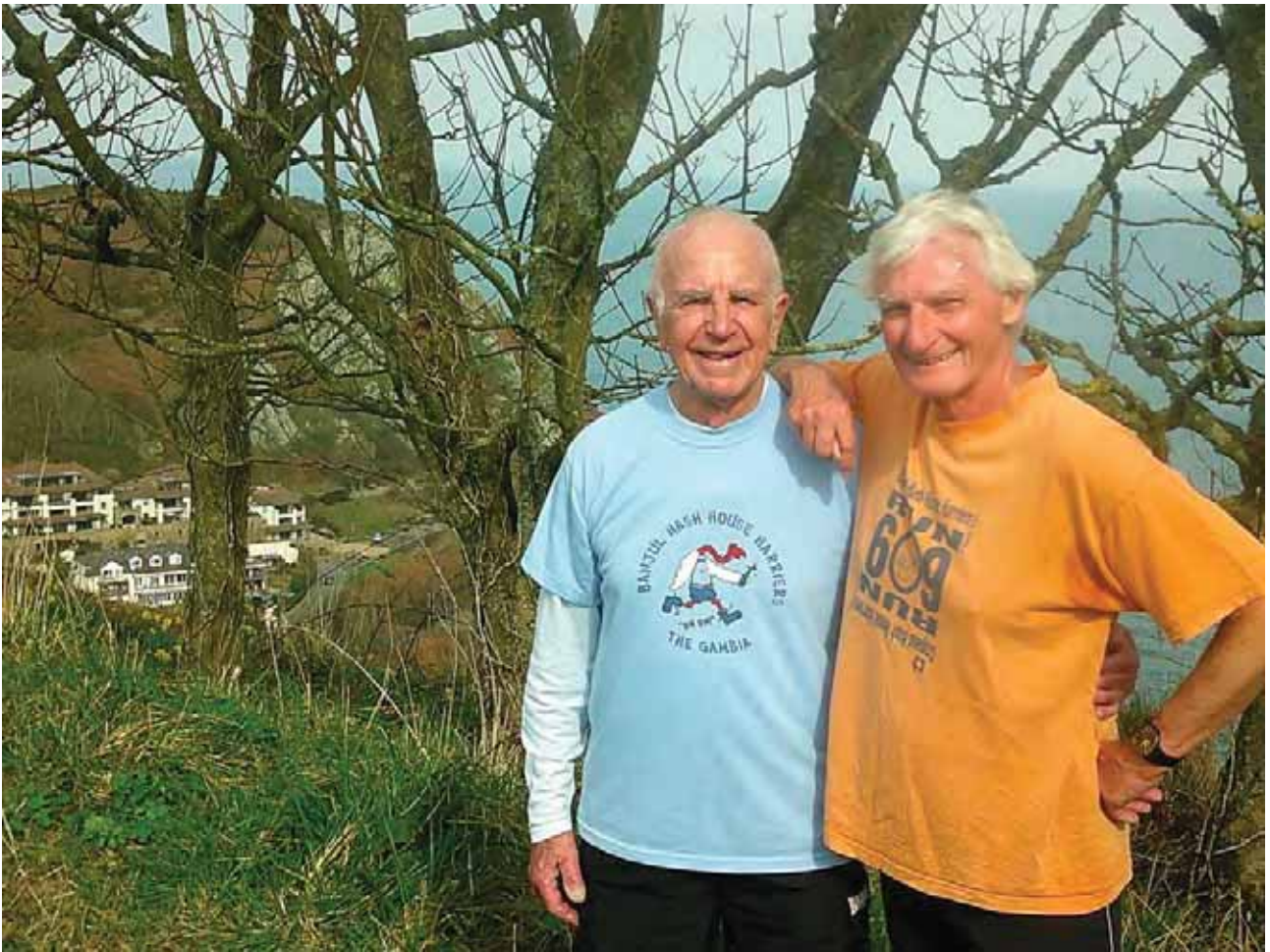
At the(ir) peak...