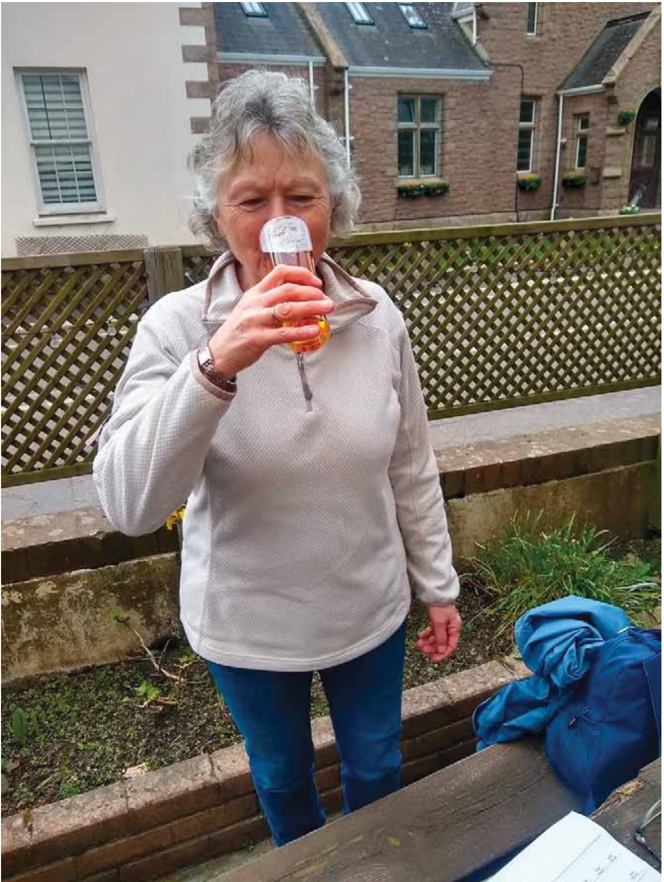
Punishment for the hare...