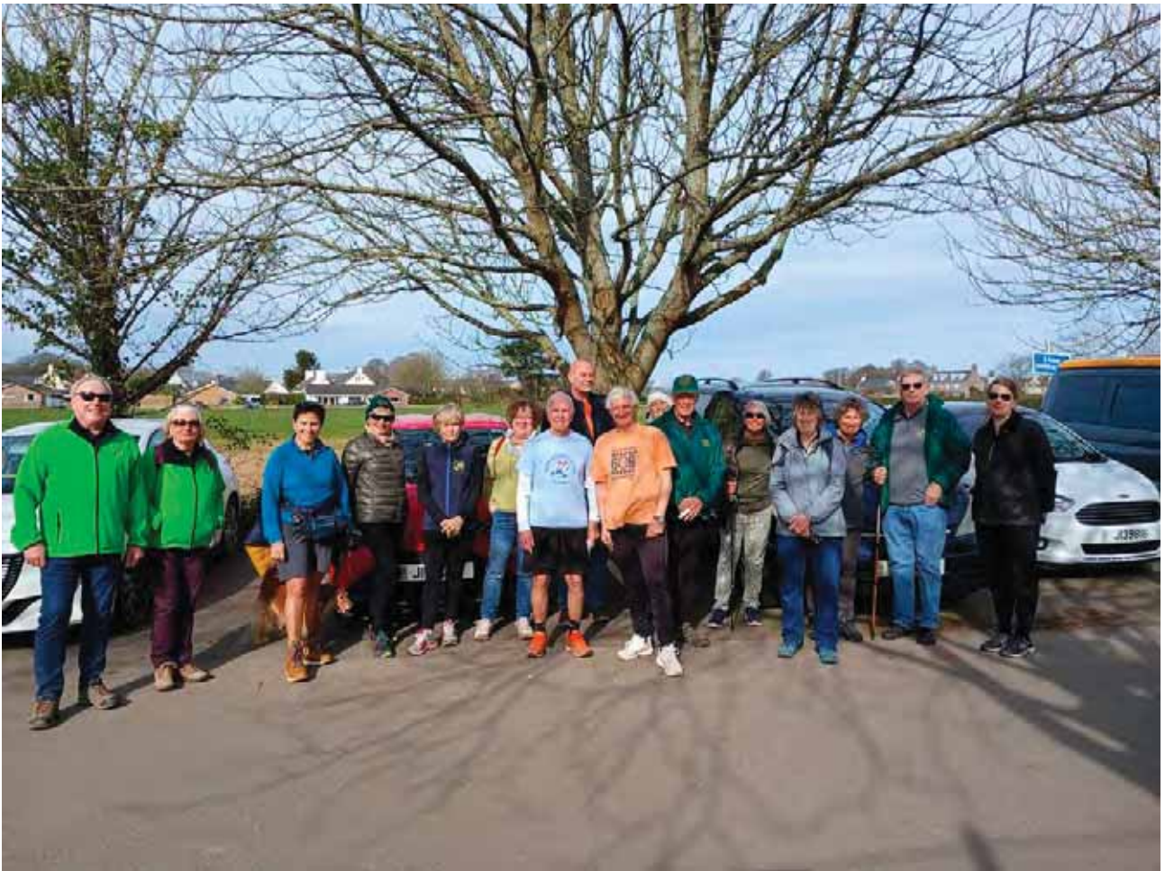
Called to order.....