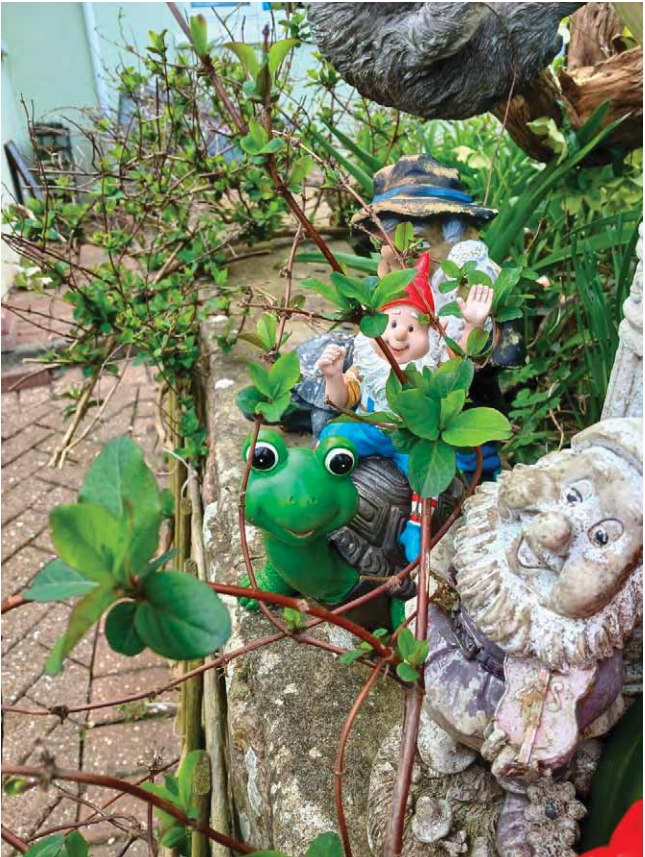
A toad pretending to be a tortoise.....