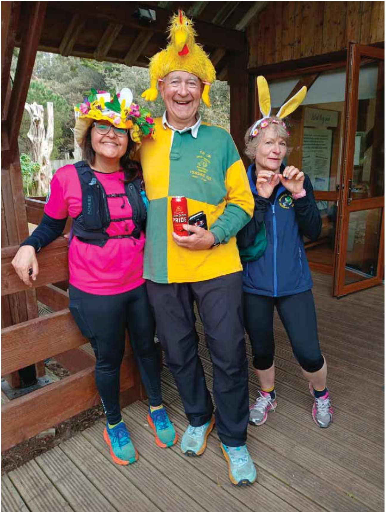
Easter Hat competition.....