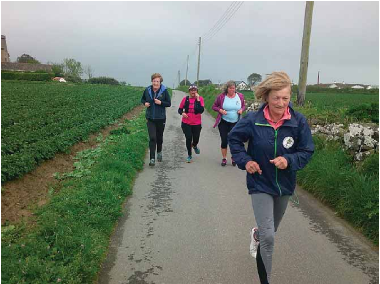
Wind in her hair.....