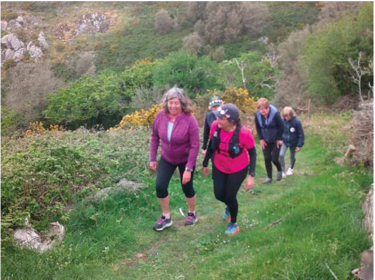
A tough climb.....