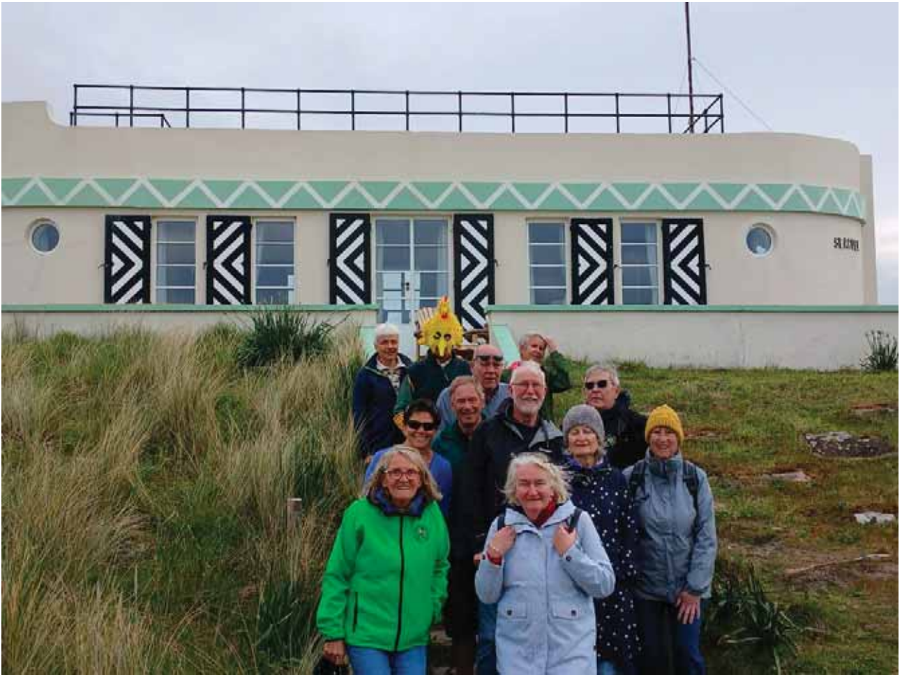
What a bunch.....