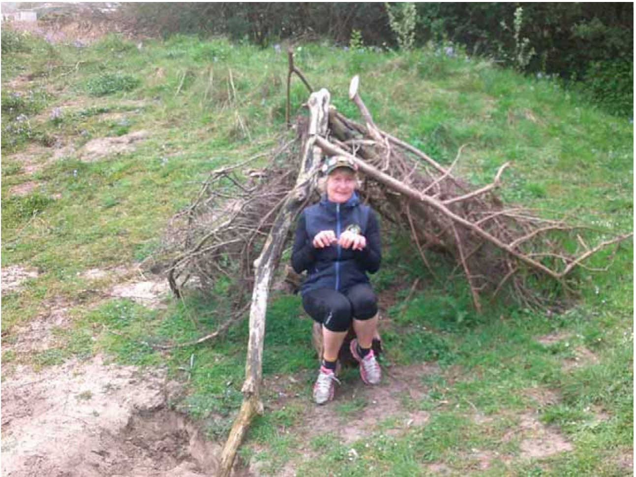
Taking to the great outdoors.....