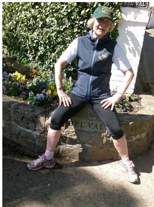
Taking a rest