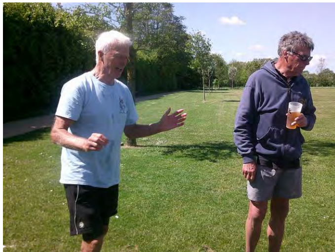
It was this big!