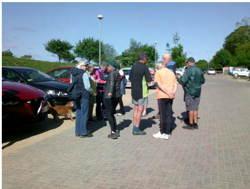
A sunny gathering