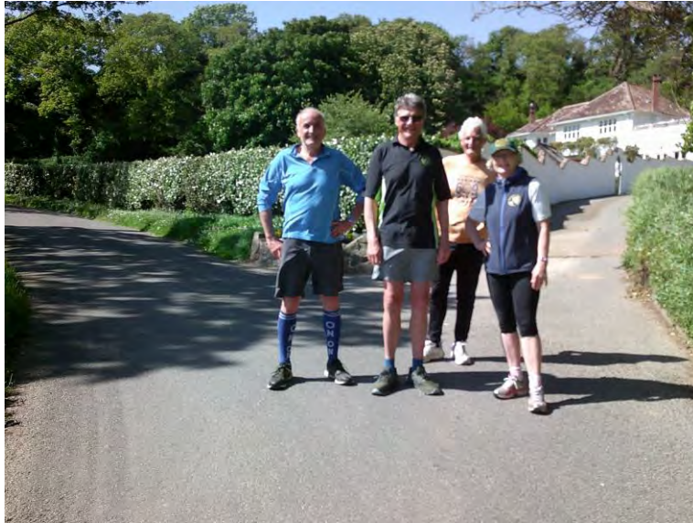
Waiting for Frisco