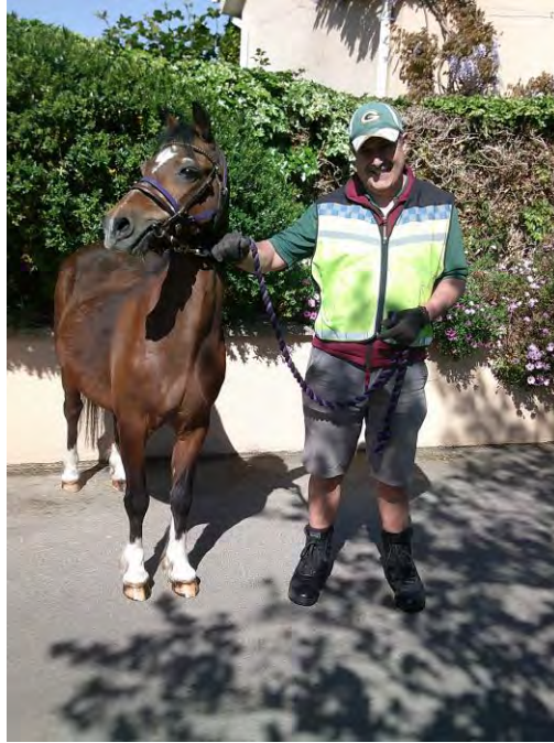
Champion the Wonder Horse (pony)