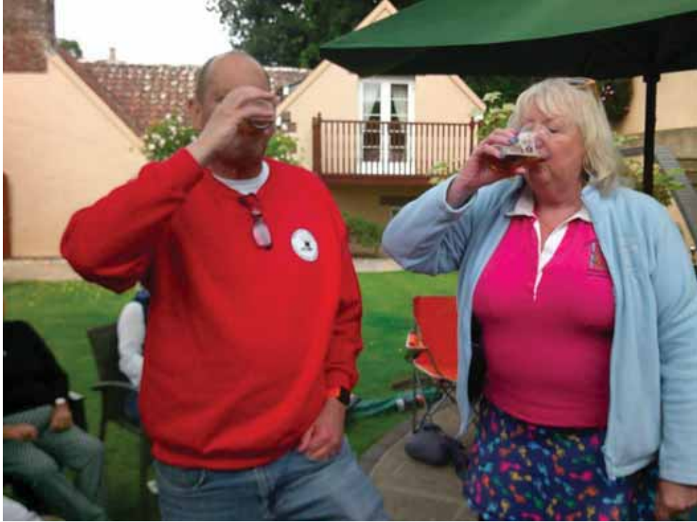
Welcome visitors rewarded