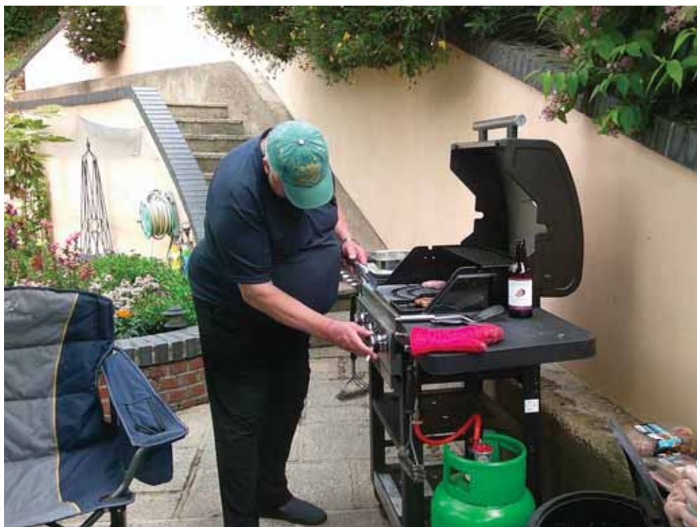
Our busy bee