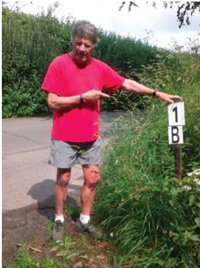
Only one bee