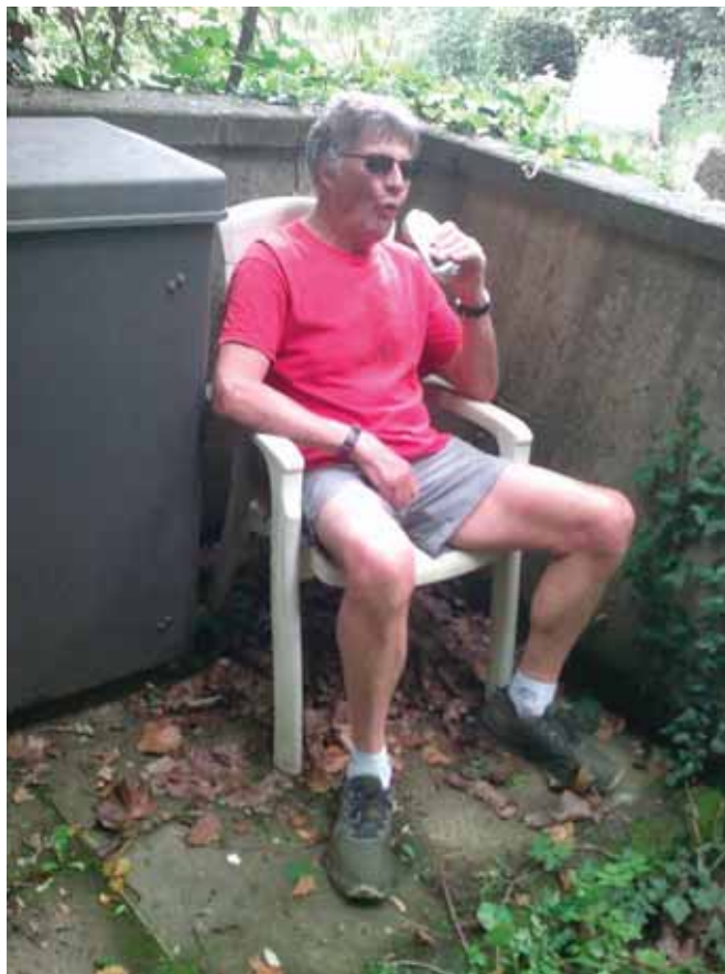
Unscheduled Drinks Stop?