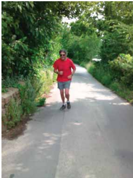
GM returning from a FT