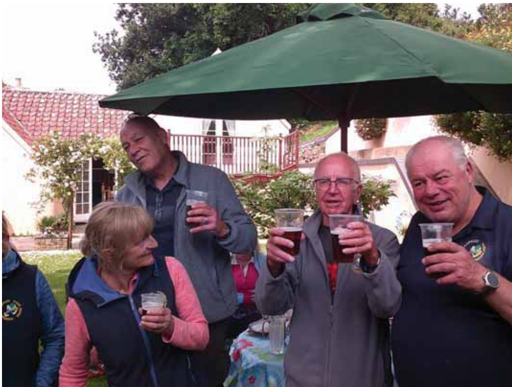
Multiple down downs