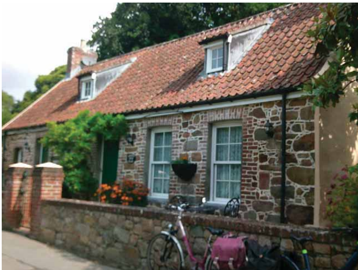
Tinky Towers in the sun