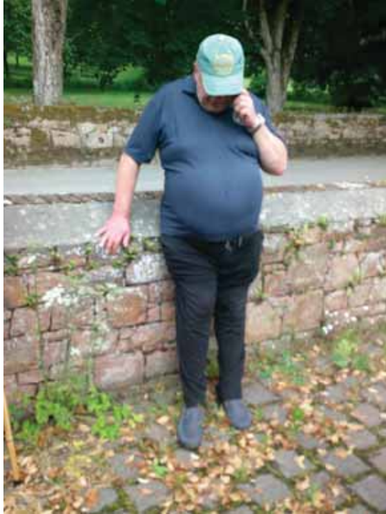
Tnky advises Double Tops