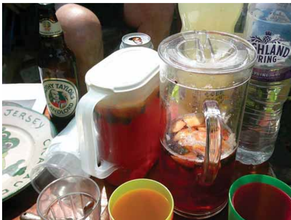
Take your pick