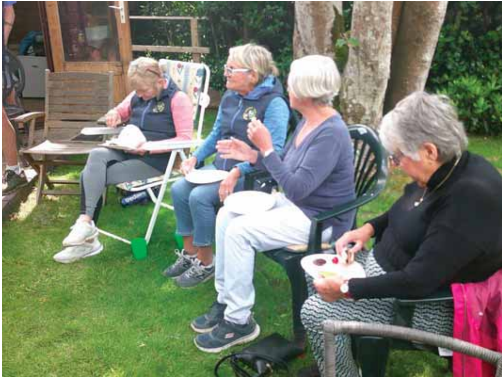
Doing justice to the BBQ