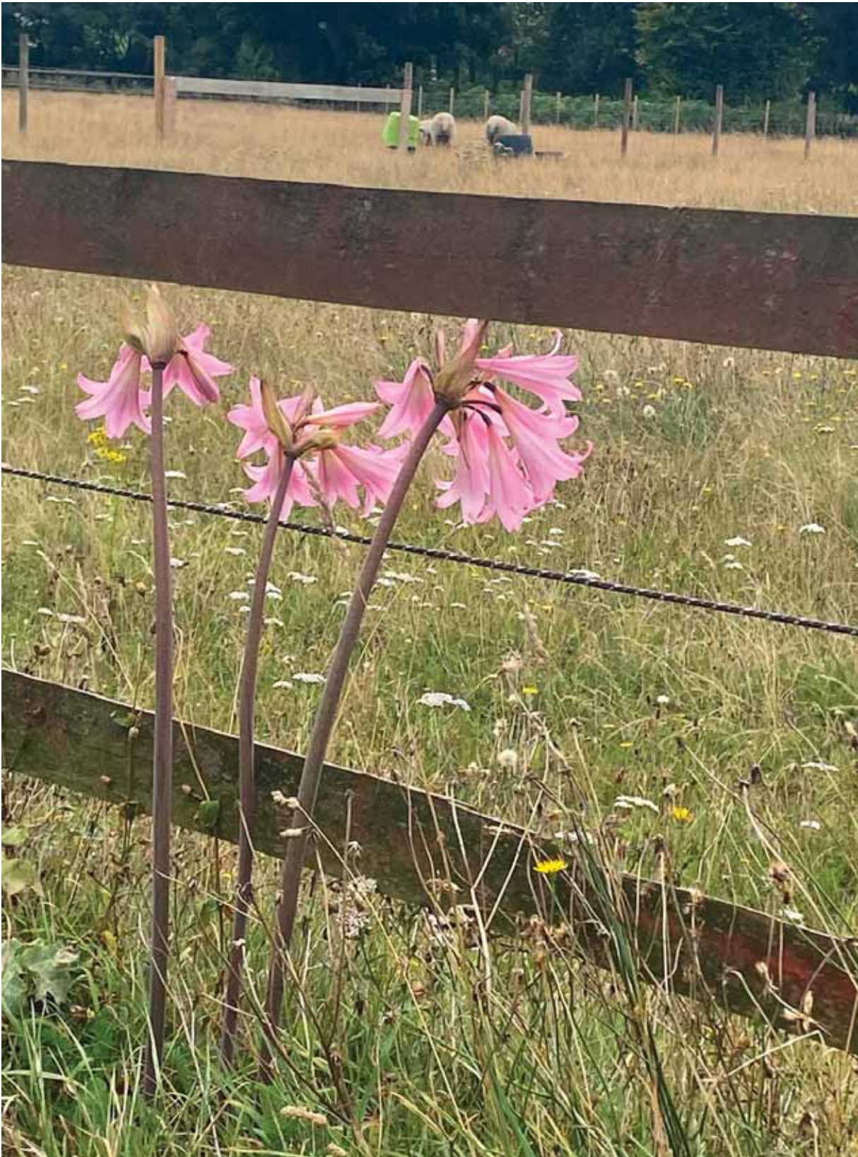
Lovely Jersey lilies