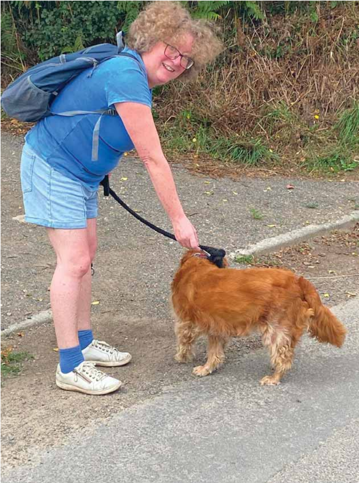
Becks trying to make a break for it