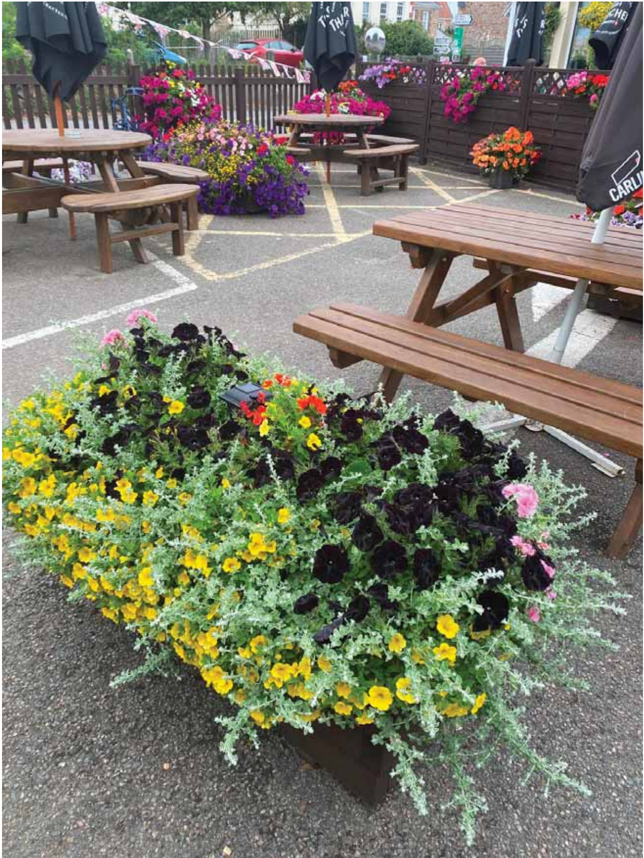
The Farmers' beautiful floral display