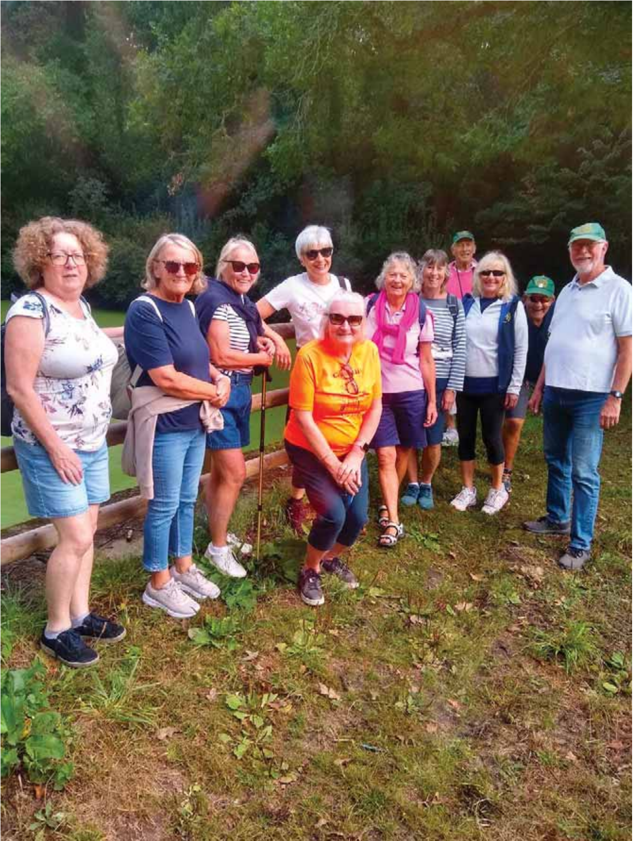
Walkers (and a couple of crouchers!)