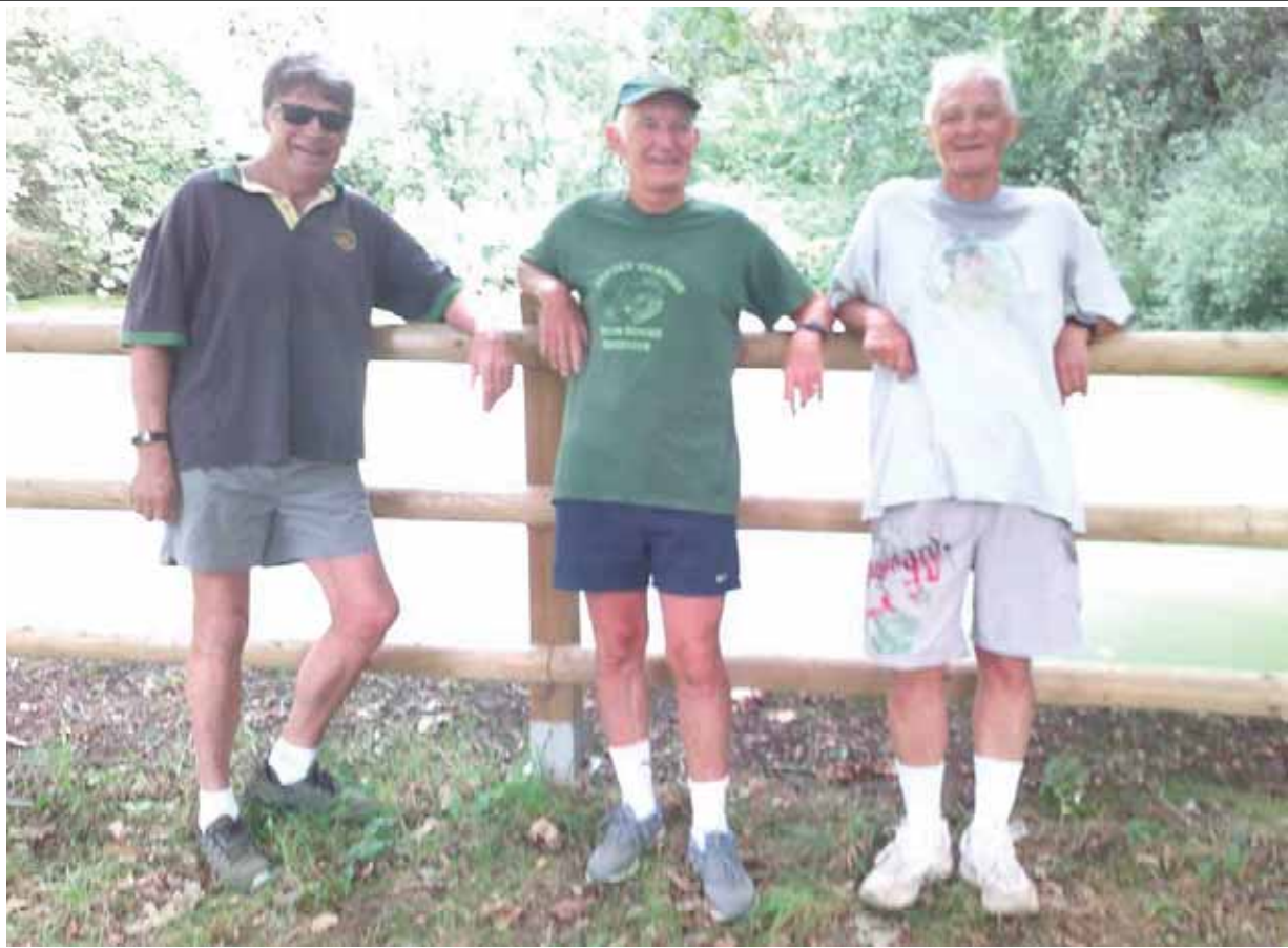
Top: a trio of lovelies