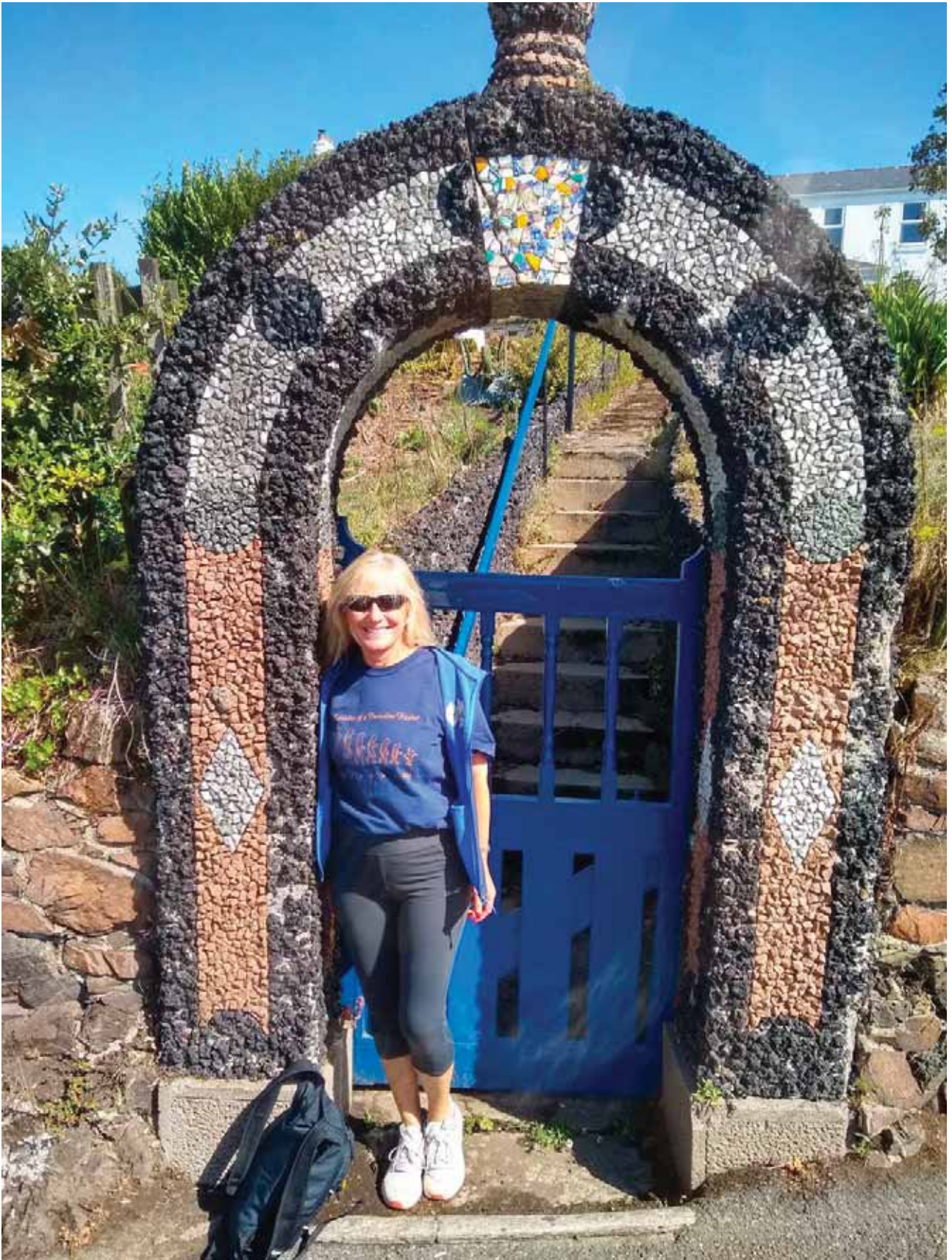
Underneath the arch