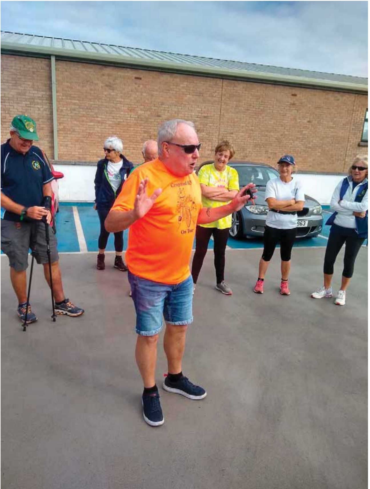
Rampant Rabbit in full flow