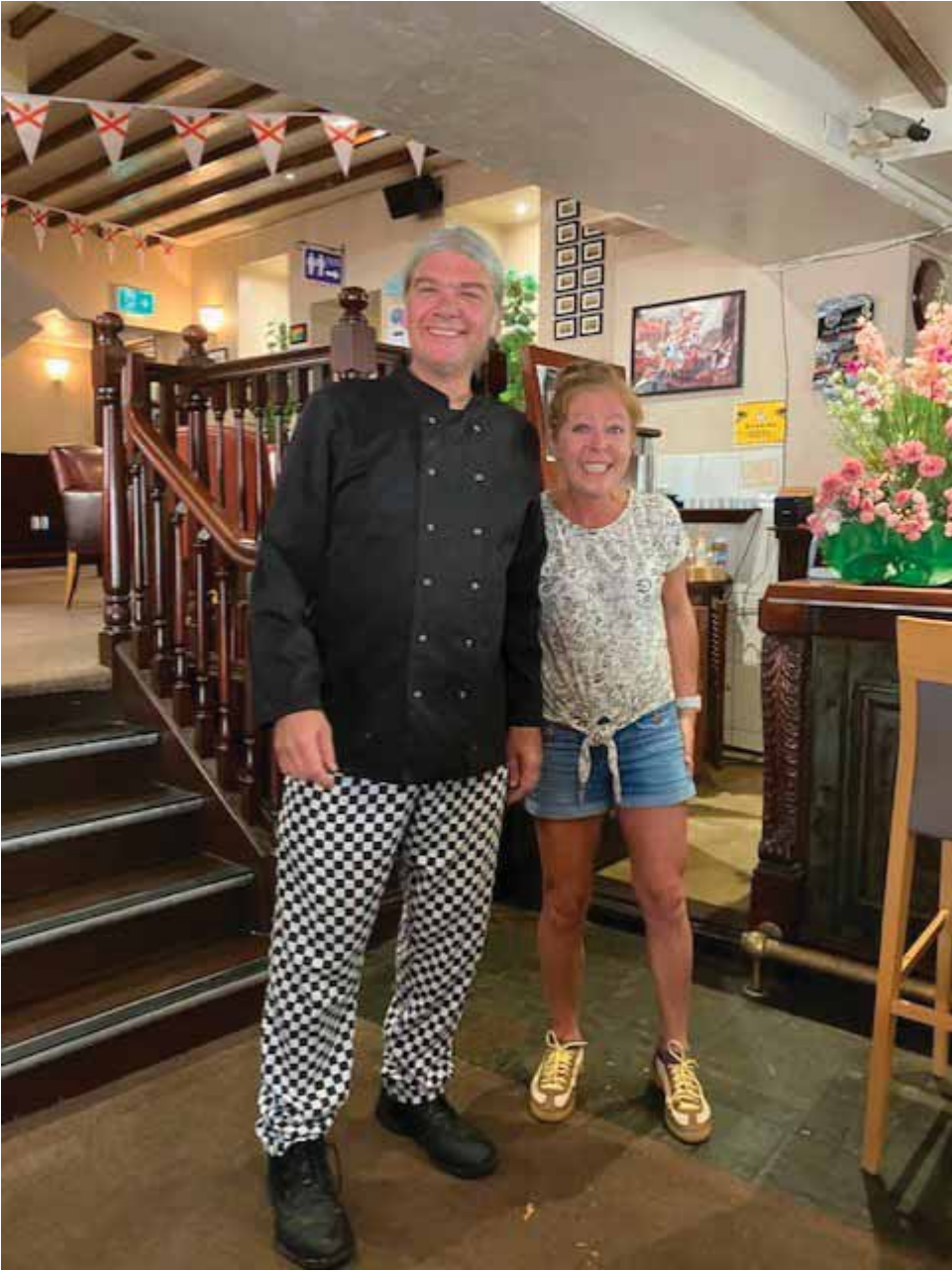
Our lovely hosts