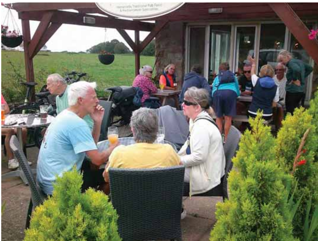
Waiting & chatting