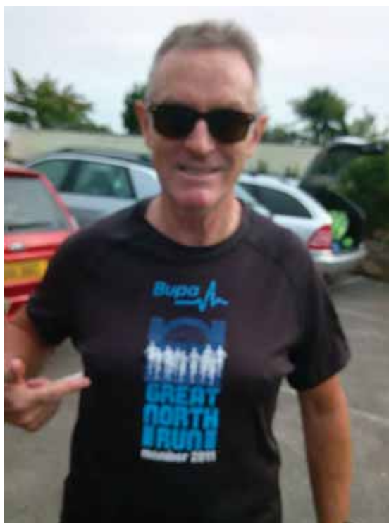
The Great North run was also taking place again today