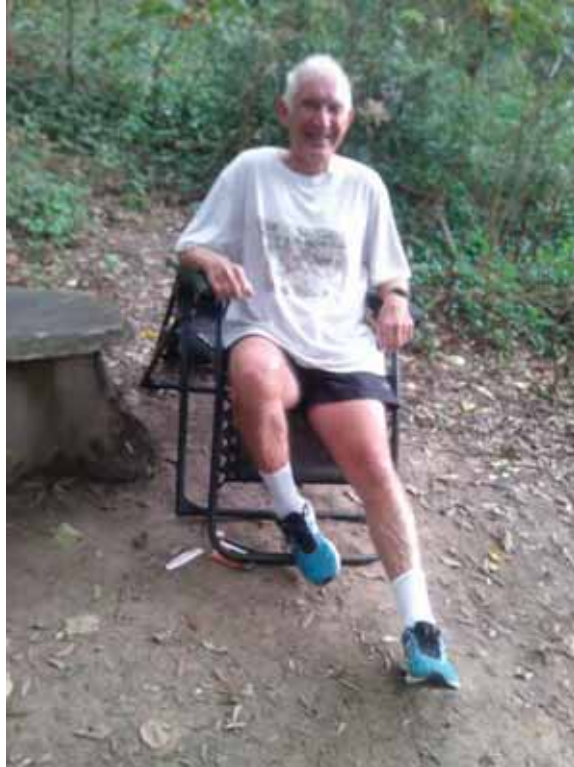
Taking it easy