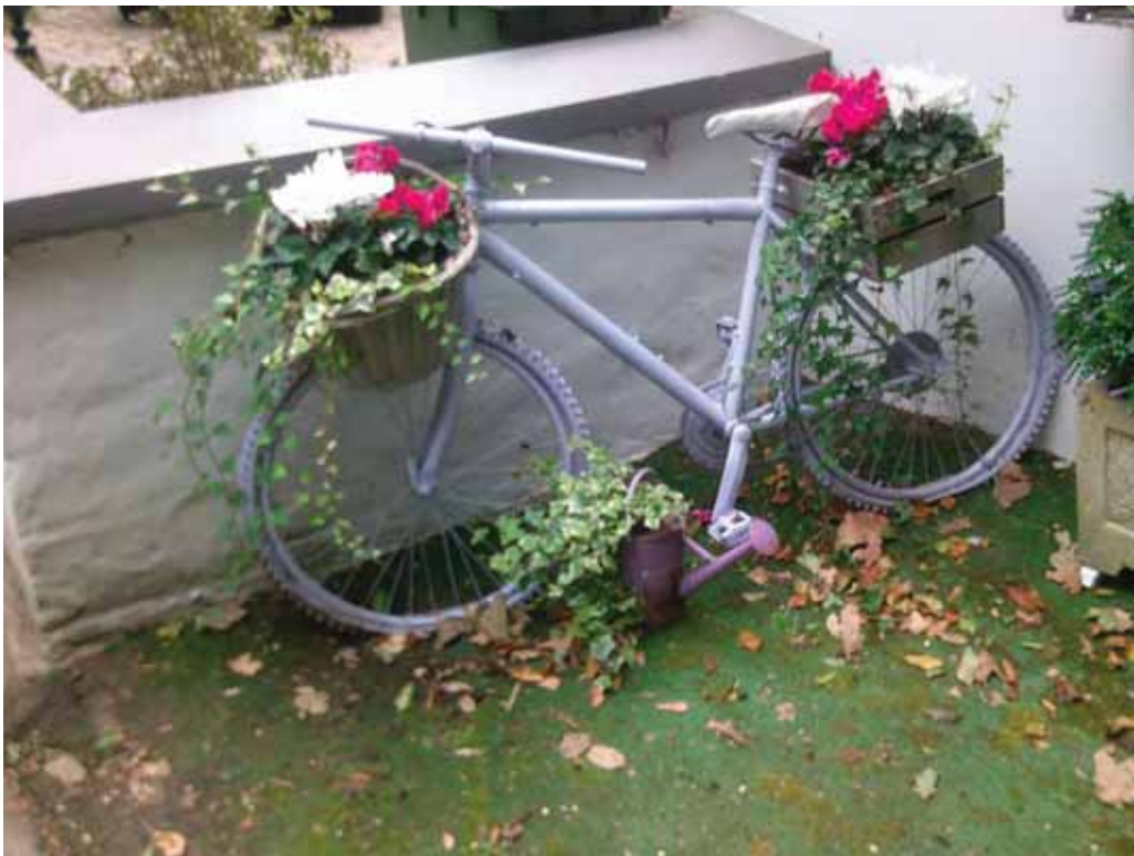
Ready for the Bike Bash