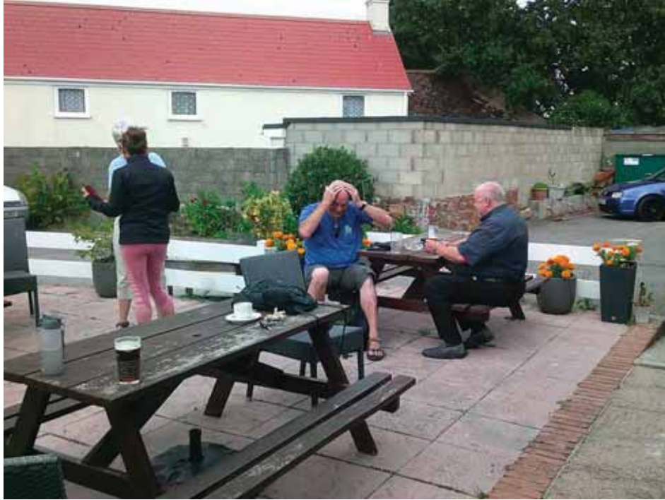
My head hurts!