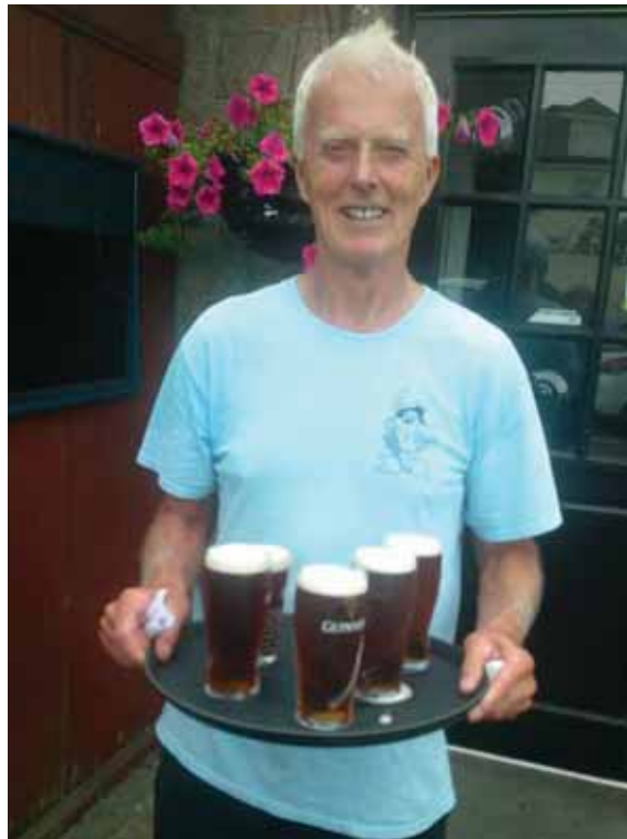
Down downs aplenty