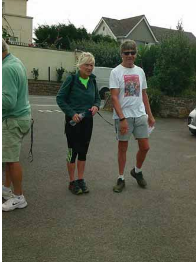
Instructions for all