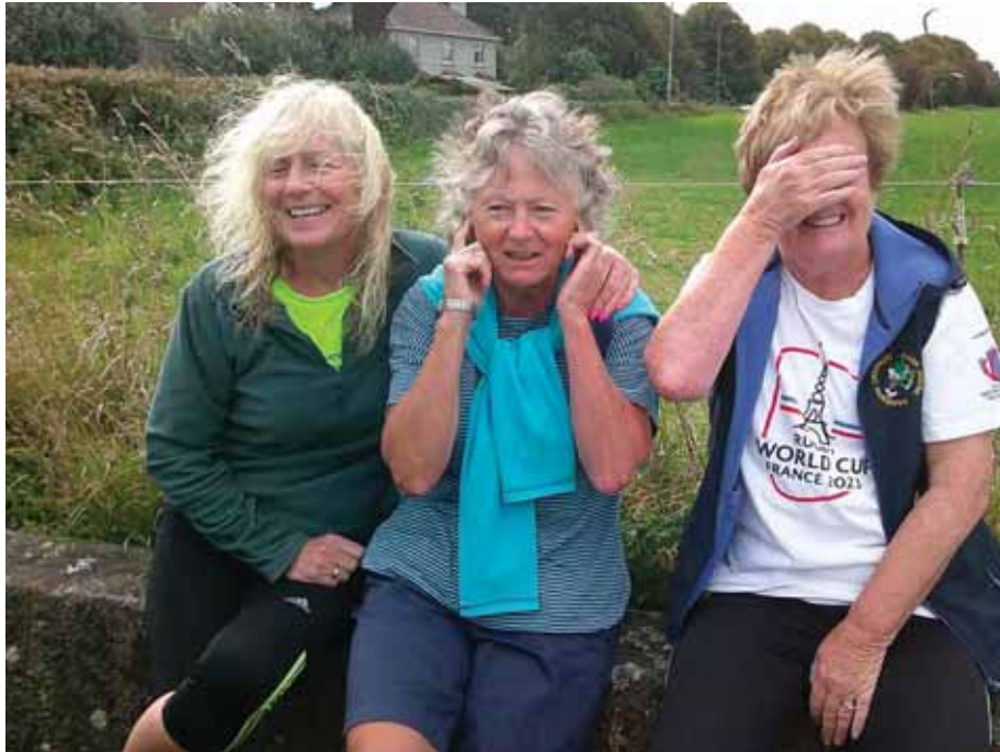
Three wise harriettes (or not).