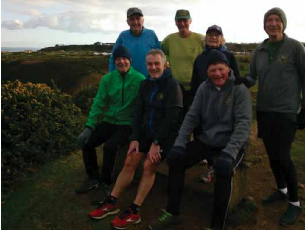
A well deserved rest