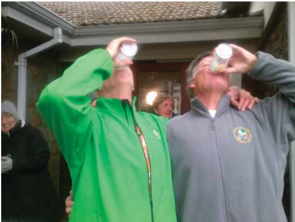
Our hare with Twinkle Toes