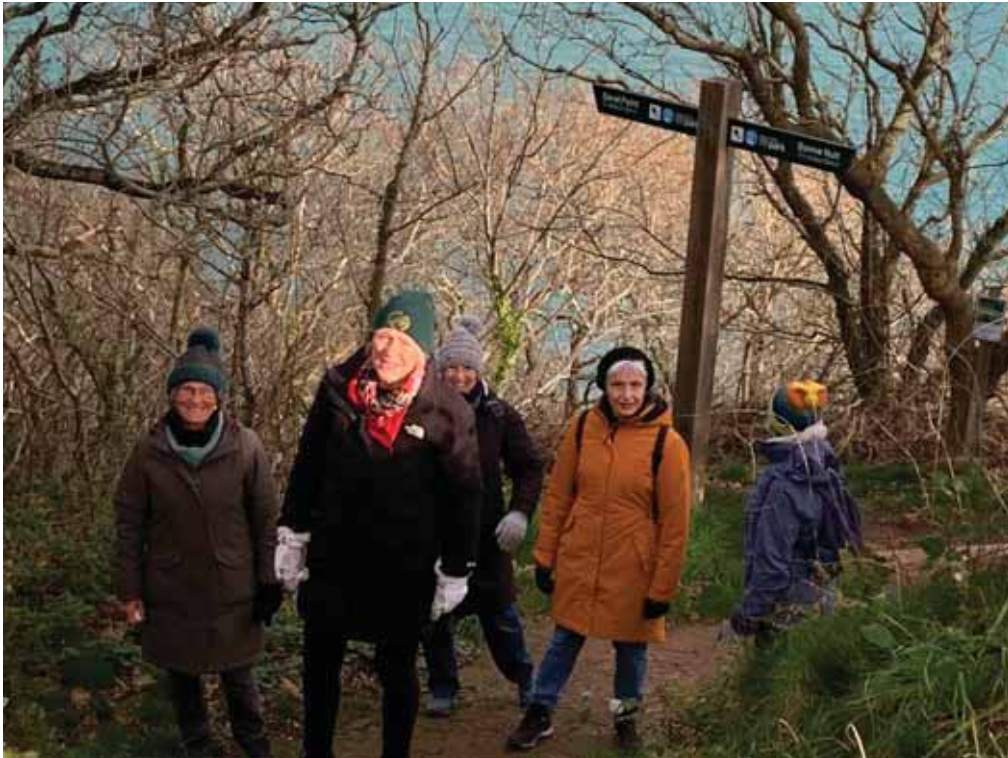
The walkers pause