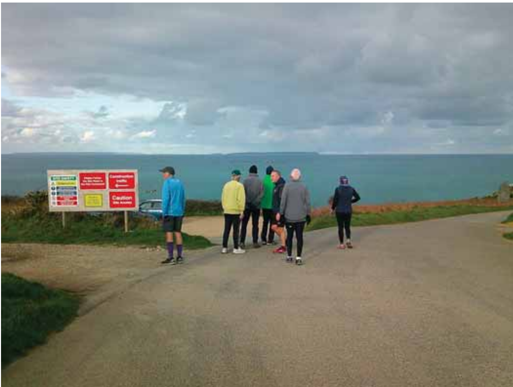
Heading for Sark