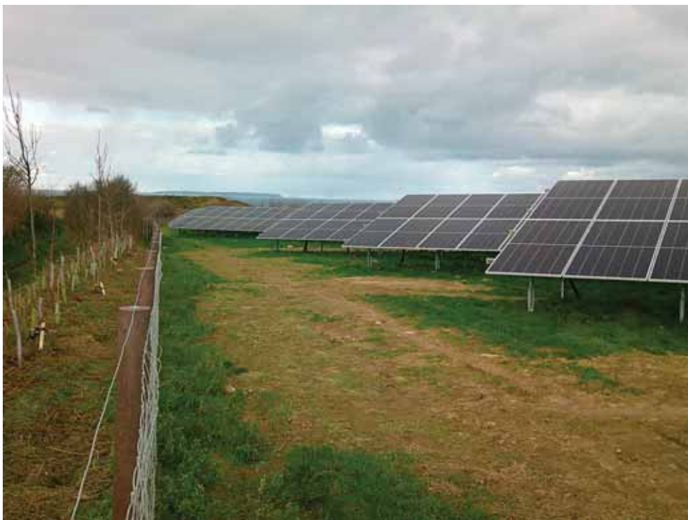
The future of farming?