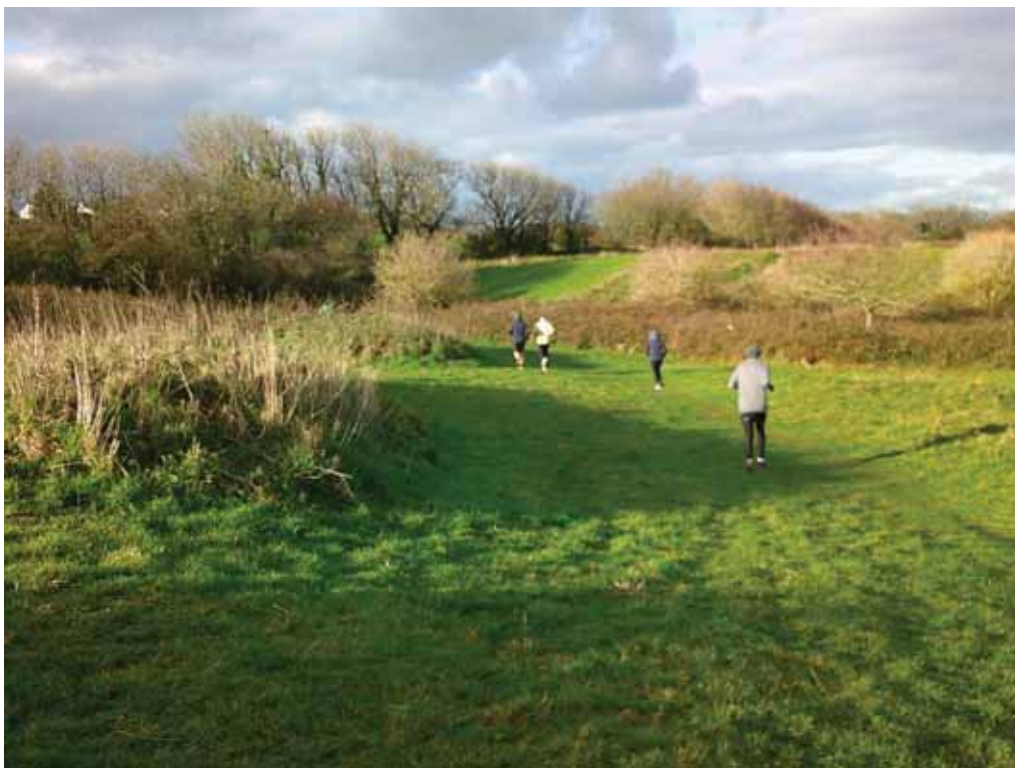
Runners stretching out in the sunshine