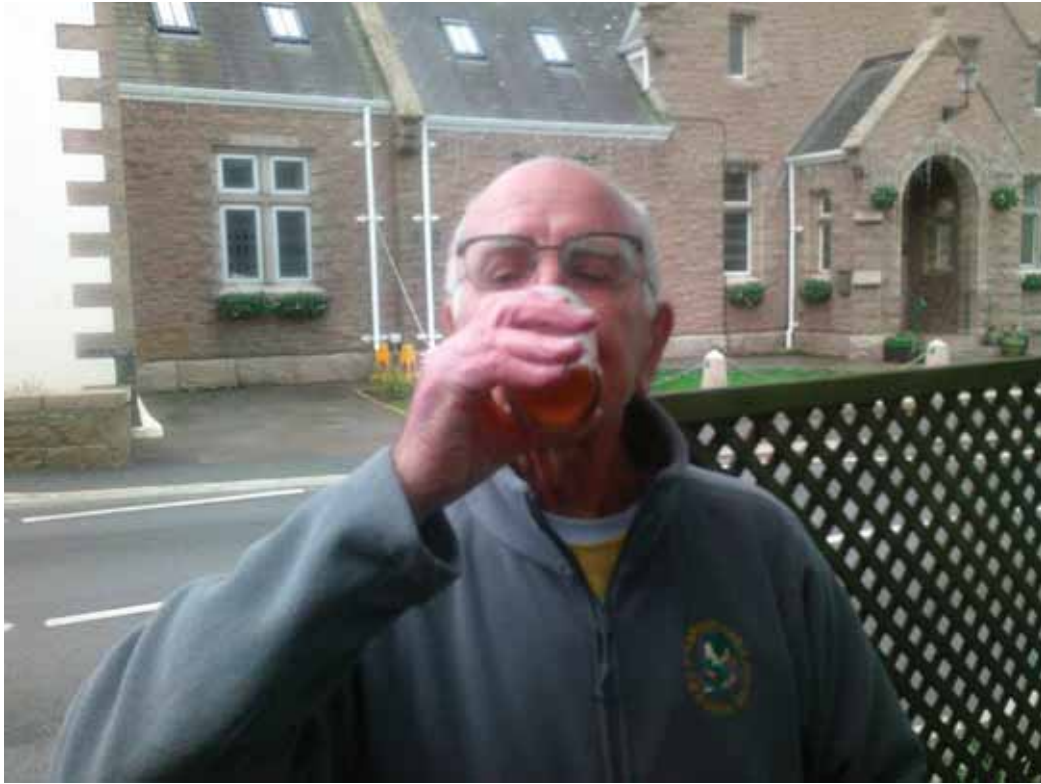
Another year older