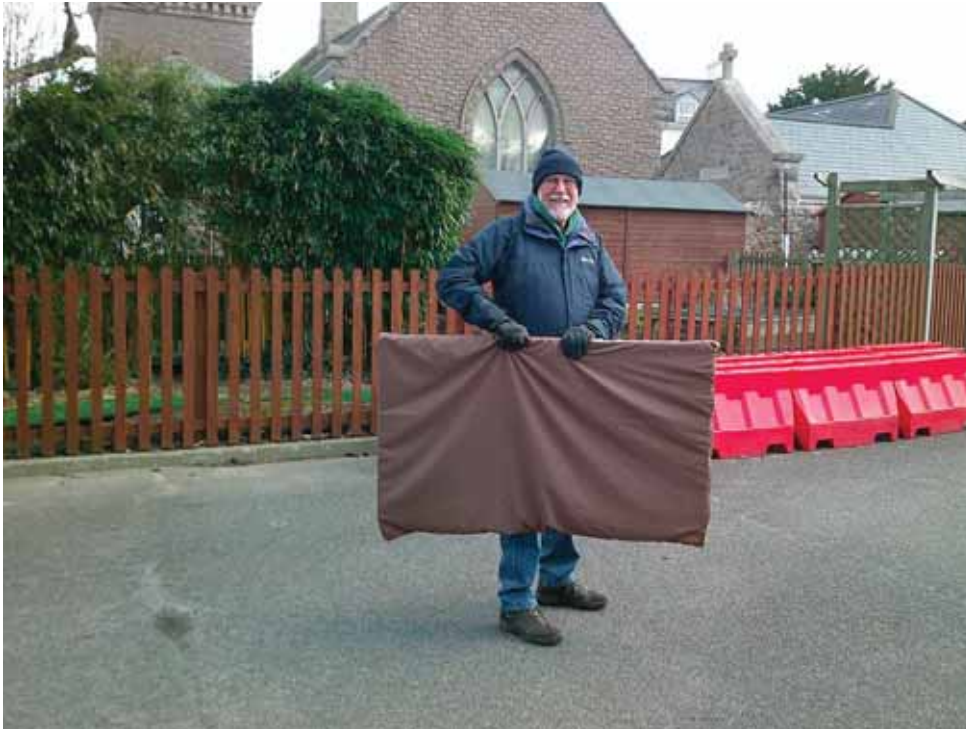
Preparing for the Board Meeting