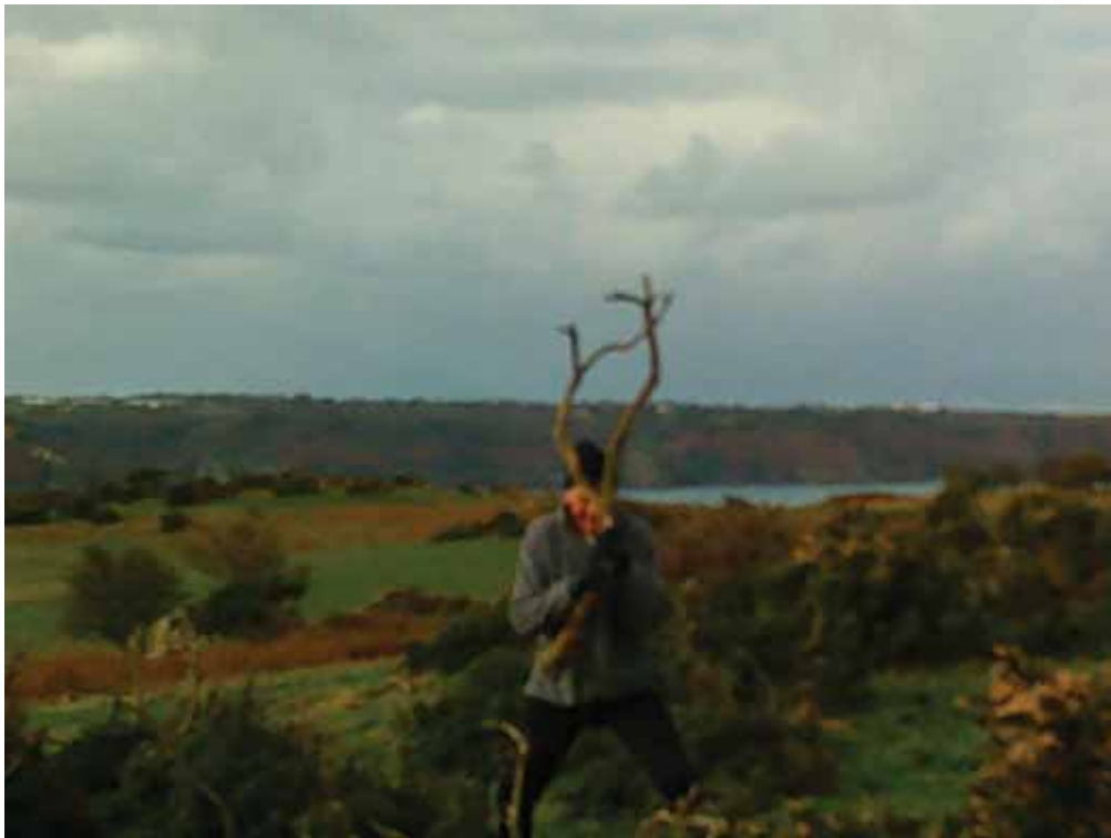
On the horns of a dilemma