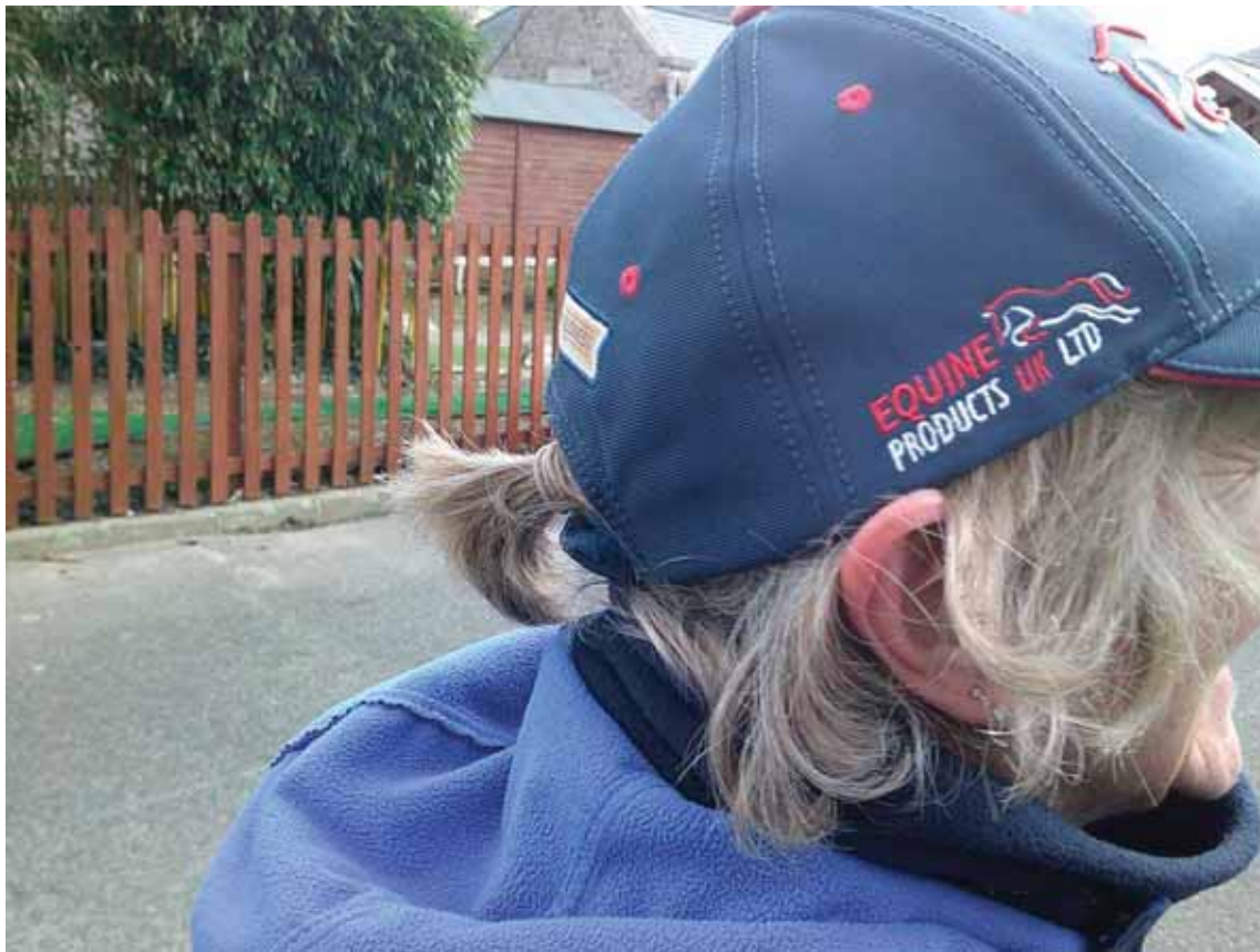
Spot the pony tail

St. John's School Car Park is the meeting spot for the first run of the New Year. The weather is again somewhat cool & runners & walkers alike are heavily clothed. Our GM welcomes all & gives us the sporting news. He admits to having indulged enthusiastically on New Year's Eve.