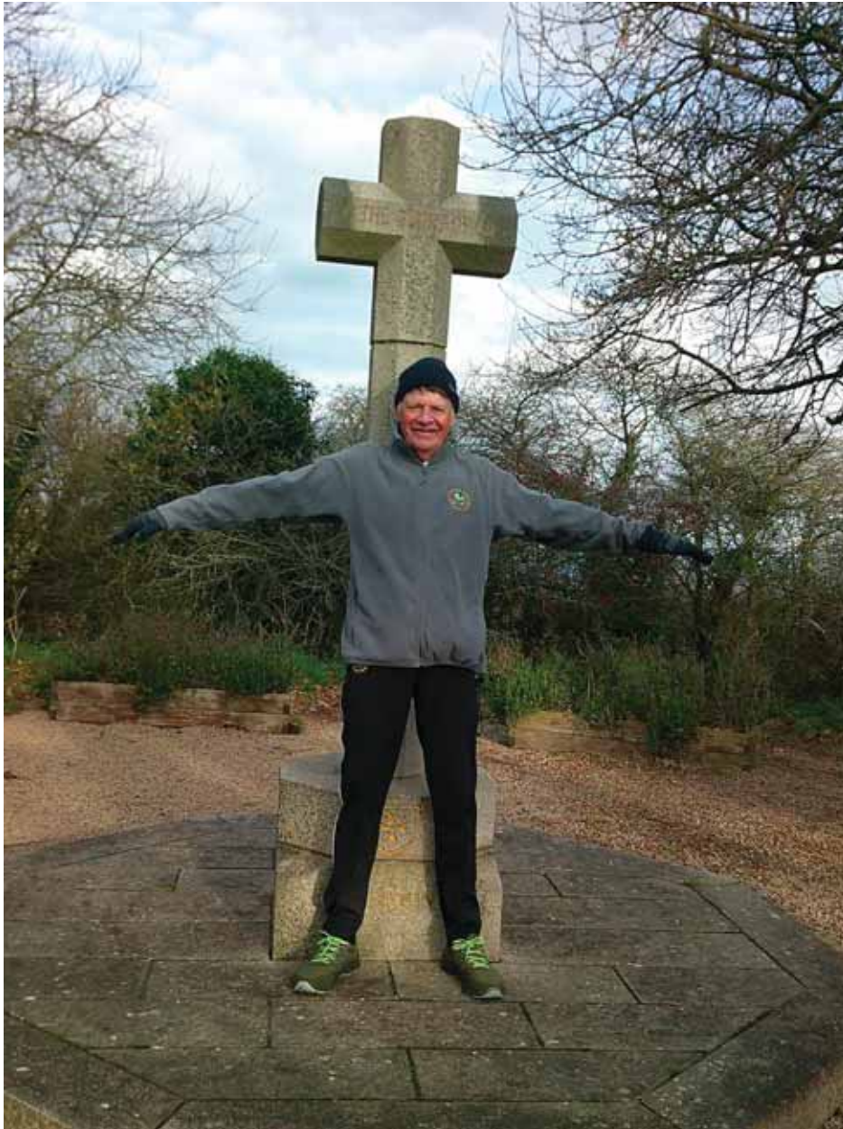
Ready for anything