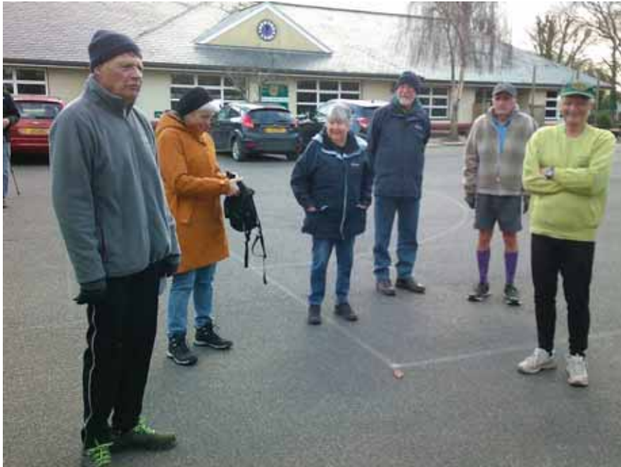
GM - still suffering after New Year?