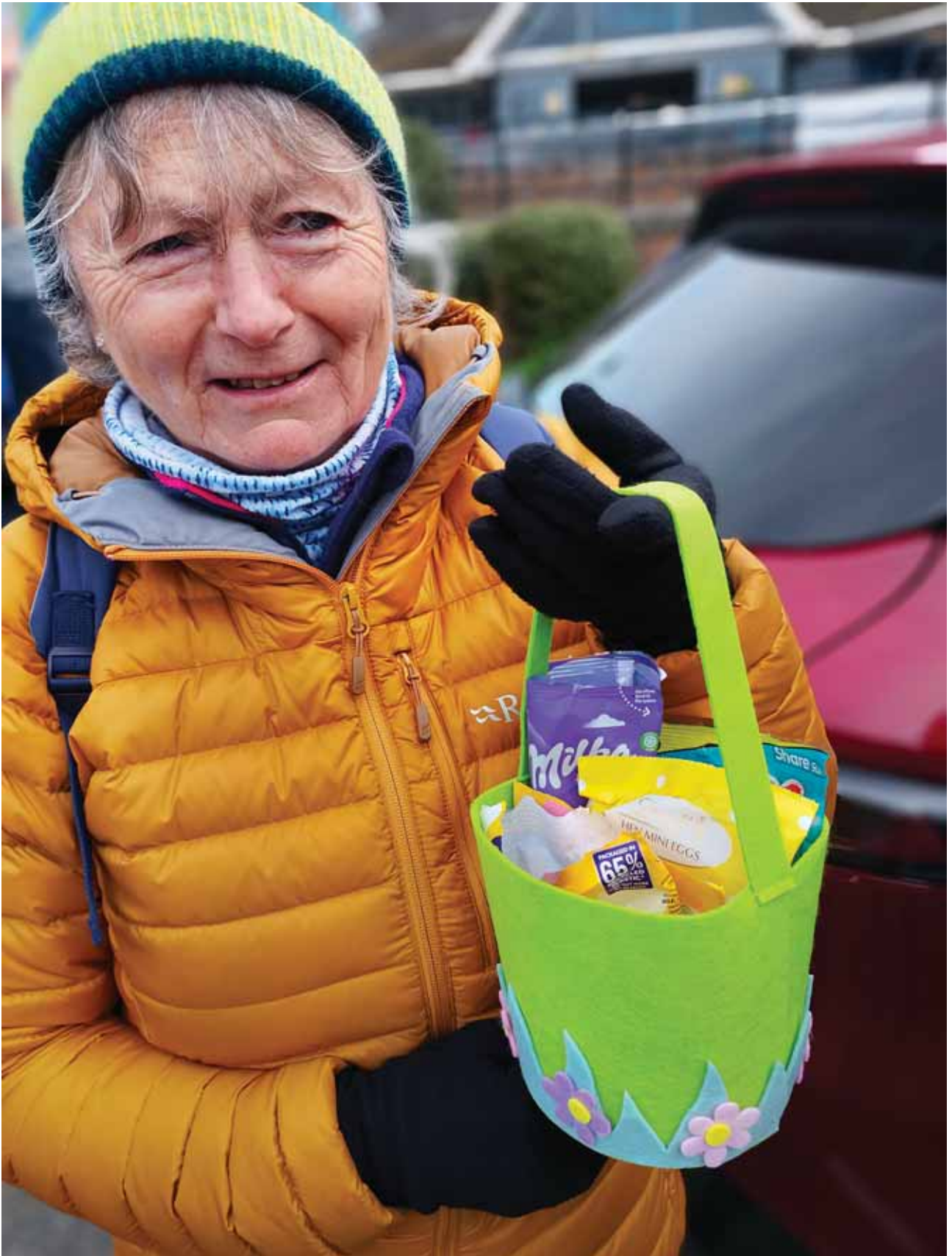
Channelling her inner Easter Bunny