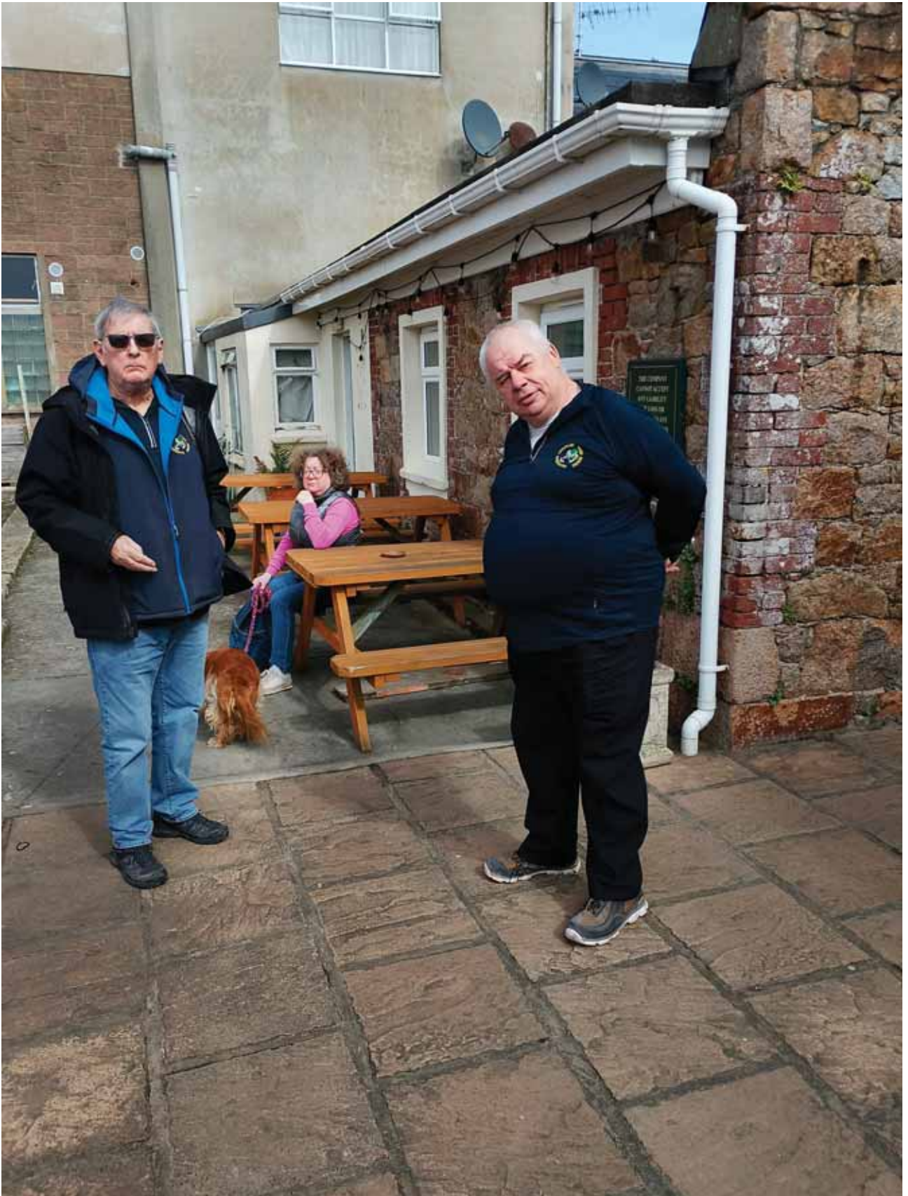
Waiting for the pub to let them in