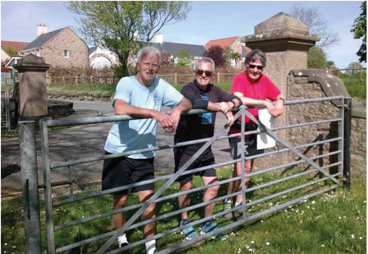
Three's Company! (Steptoe)