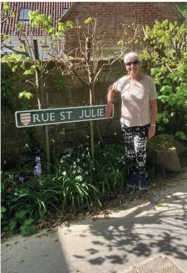
Fuzz's Place! (Muff Diver)