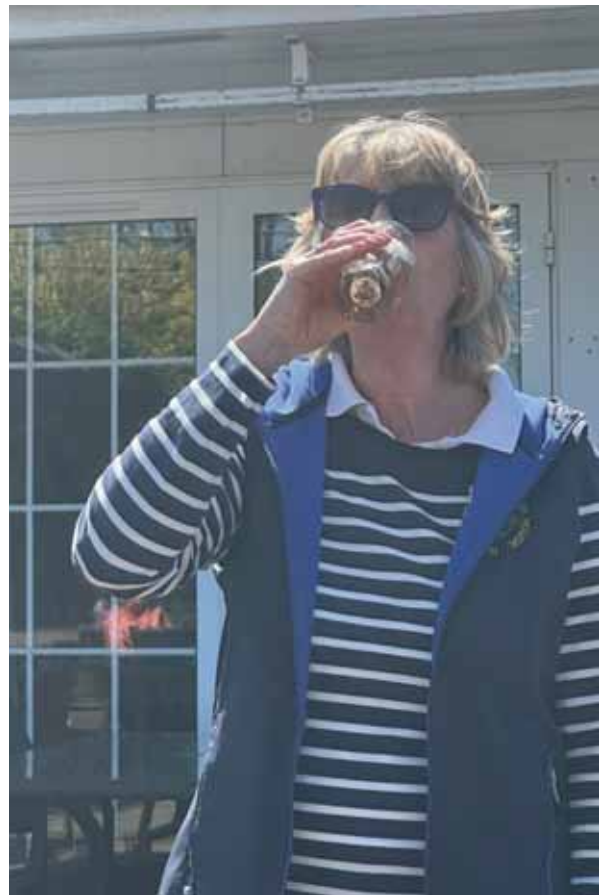
Birthday Girl gets Down-Down! (Tinks)