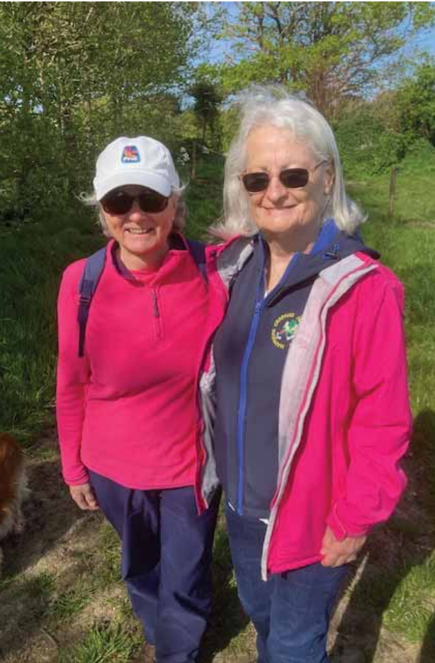
Magnificent Pair! (Muff Diver)