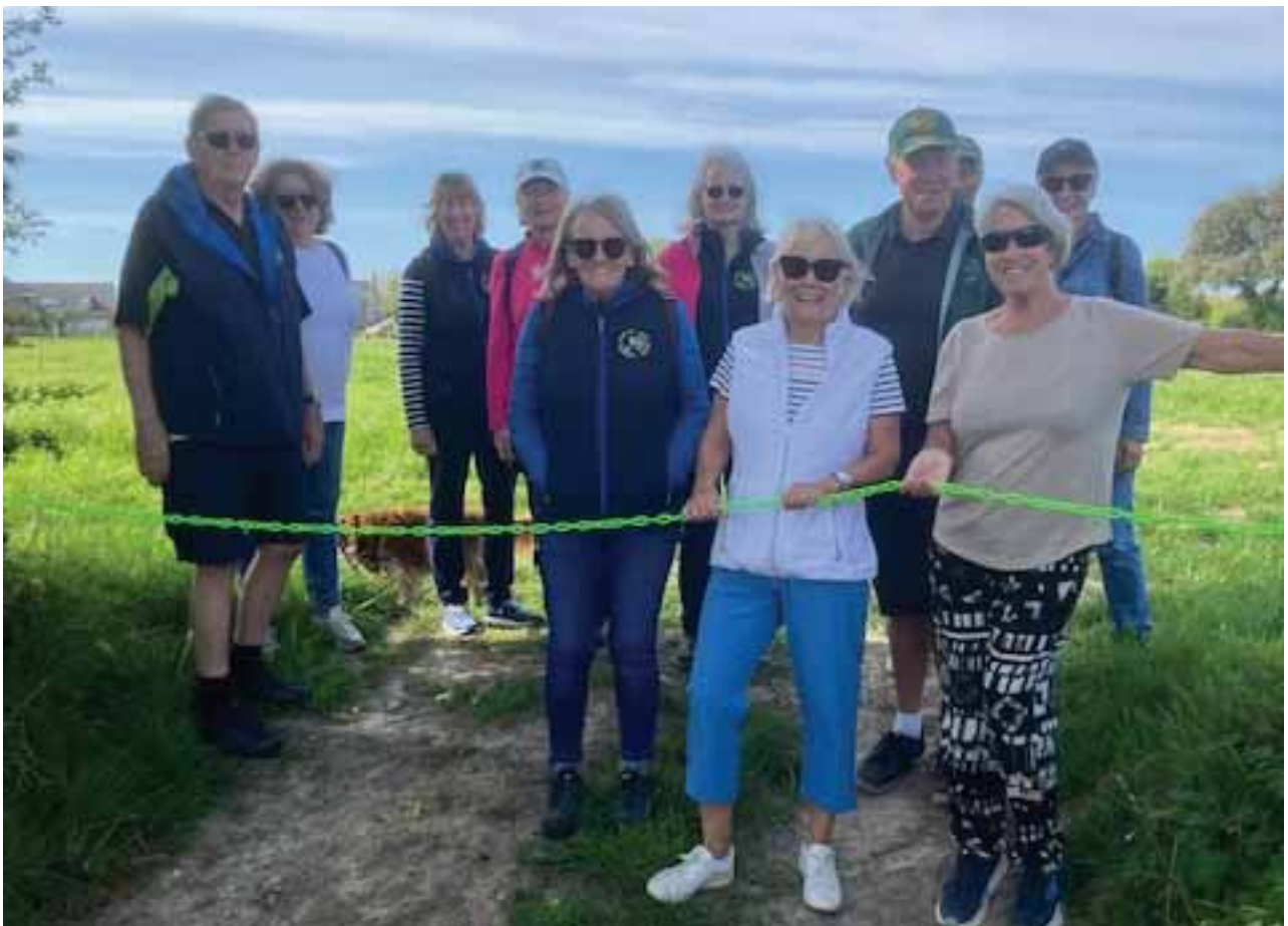
Walkers United! (Muff Diver)