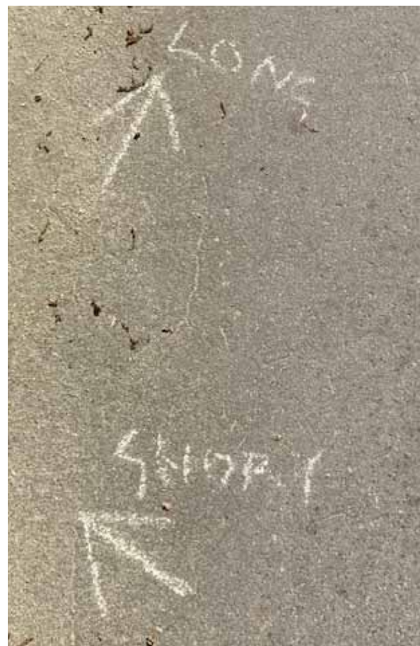
Short-Cut Give-Away! (Muff Diver)