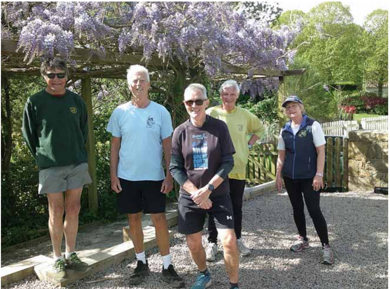
Runners under the Wisteria! (Steptoe)