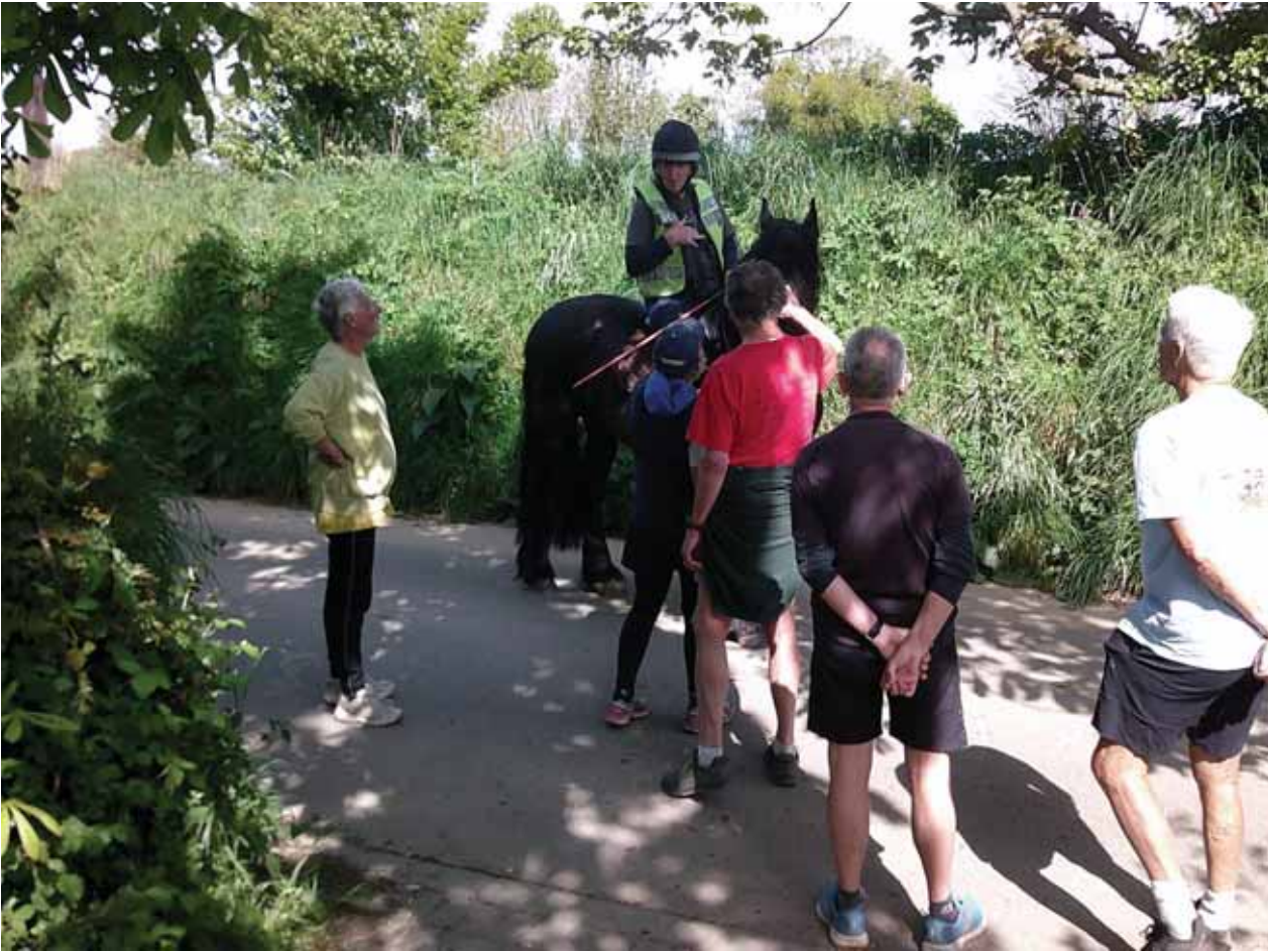
Equine Encounter! (Step toe)