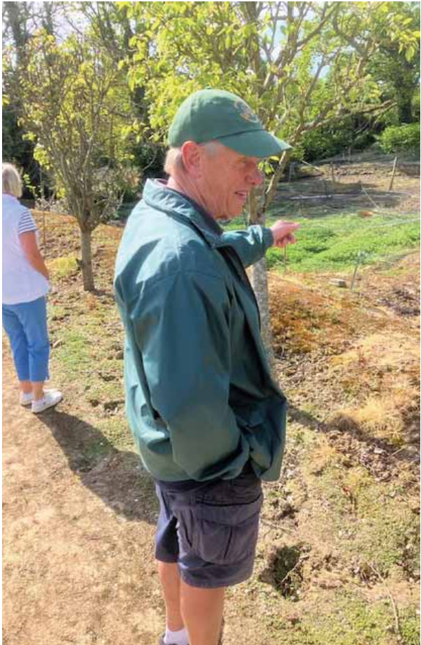
Trail Goes That Way! (Muff Diver)