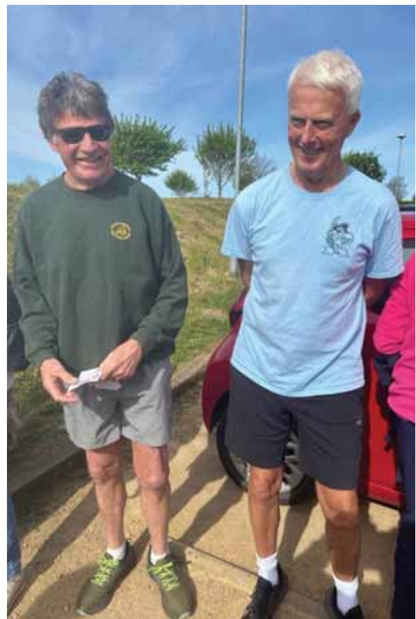
Another Fine Pair? (Tinks)