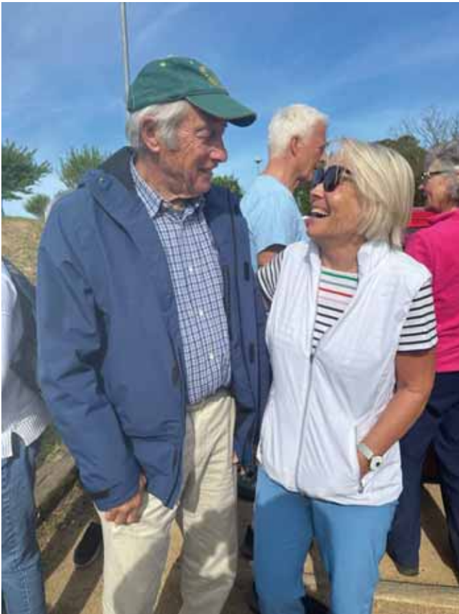
A Fine Pair! (Tinks)