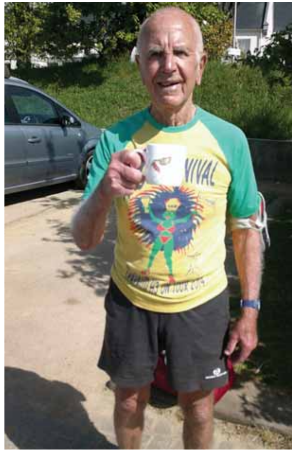
What? Coffee not Beer! (Anon)