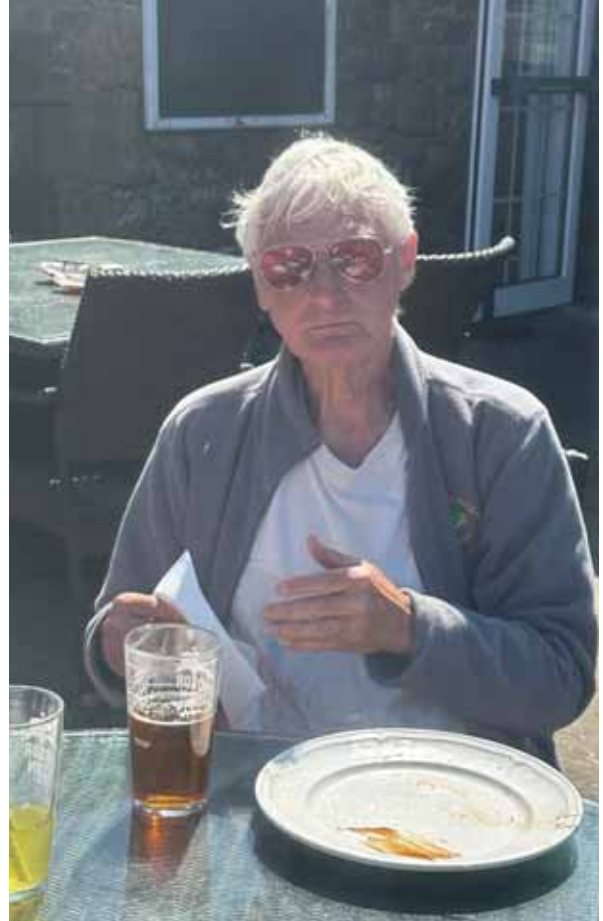
Scoffing the Last Chip! (Tinks)