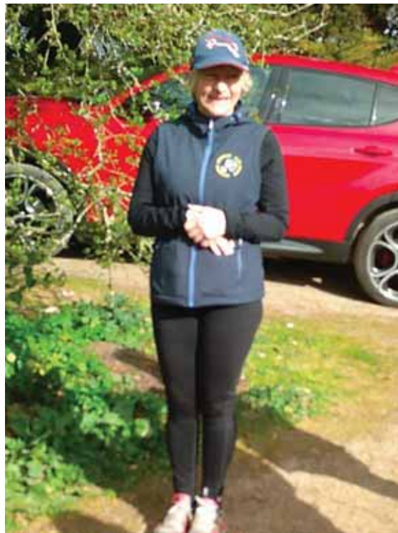
A neat hare