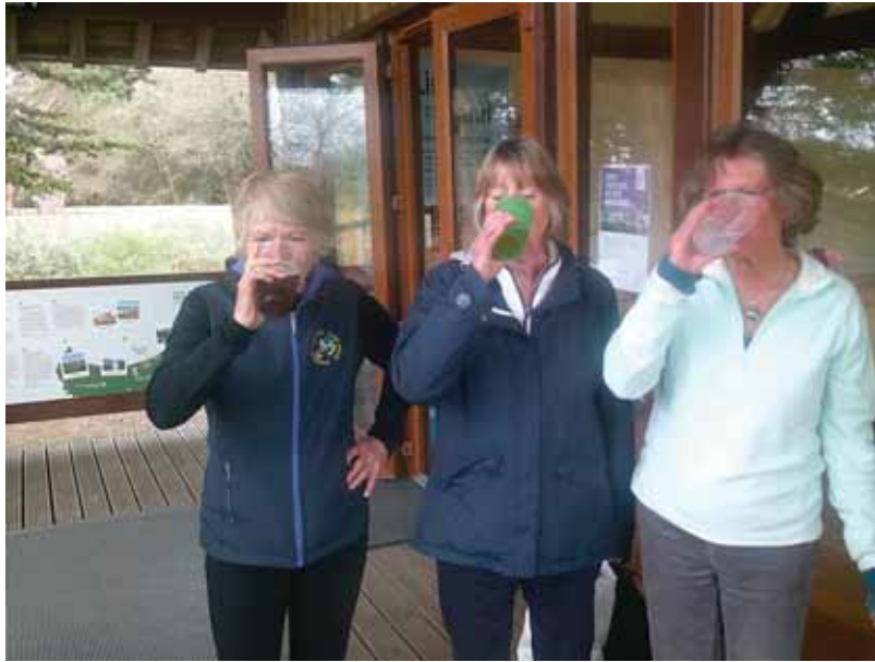
Two week's Hares