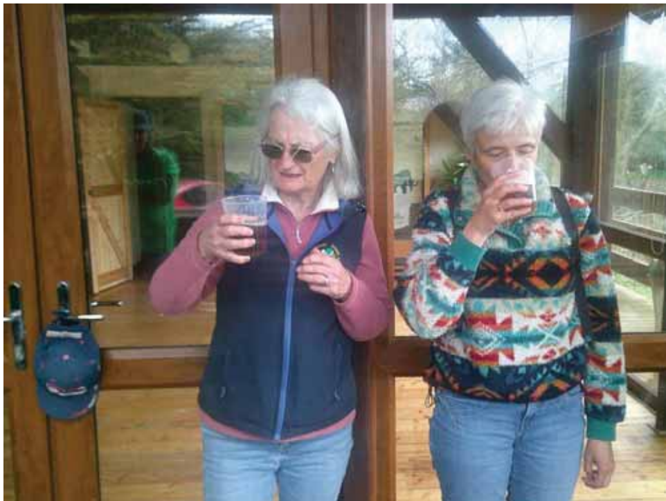
What is this?